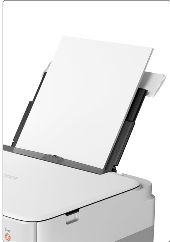
100-Sheet Rear Paper Tray (Plain Paper, Letter Size)