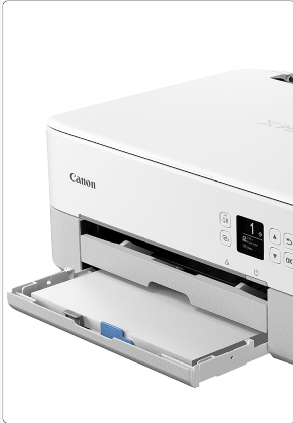
100-Sheet Front Paper Tray (Plain Paper, Letter Size)