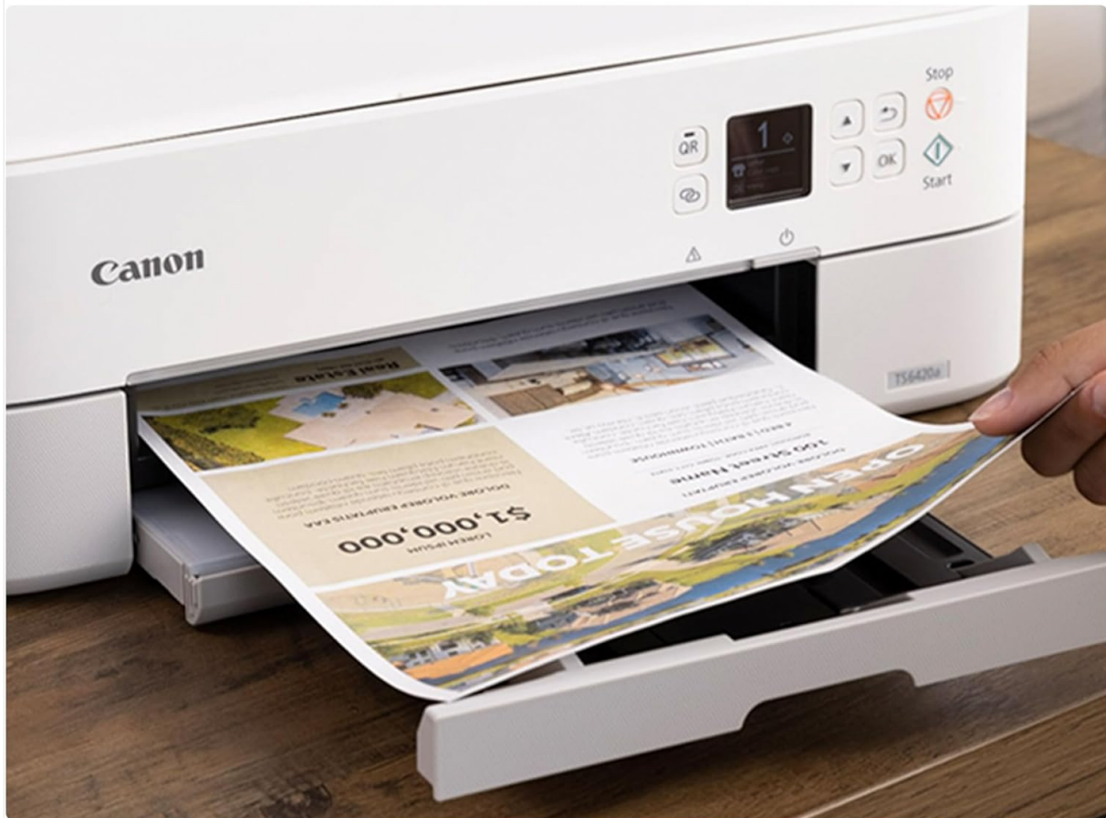
Figure 4: Print Speed demonstration of the PIXMA TS6420a.

Fast print speeds of approx. 13 ipm black and 6.8 ipm color.