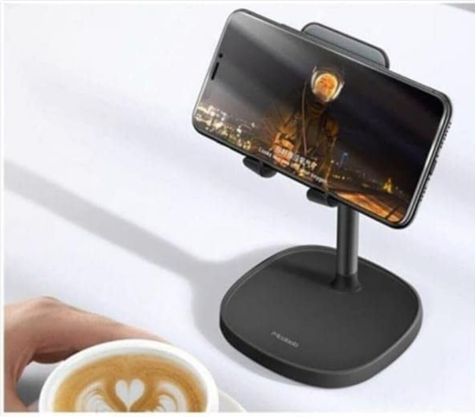
Figure 2: Smartphone placed on the holder in landscape orientation.