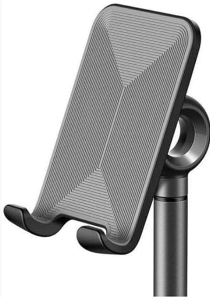
Figure 4: Detail of the adjustable device cradle.