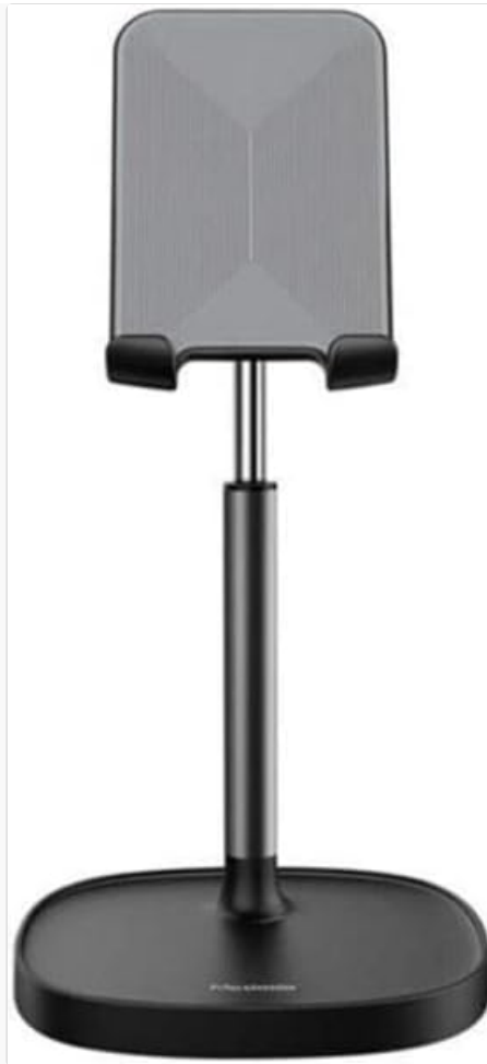
Figure 3: The holder demonstrating its adjustable height.