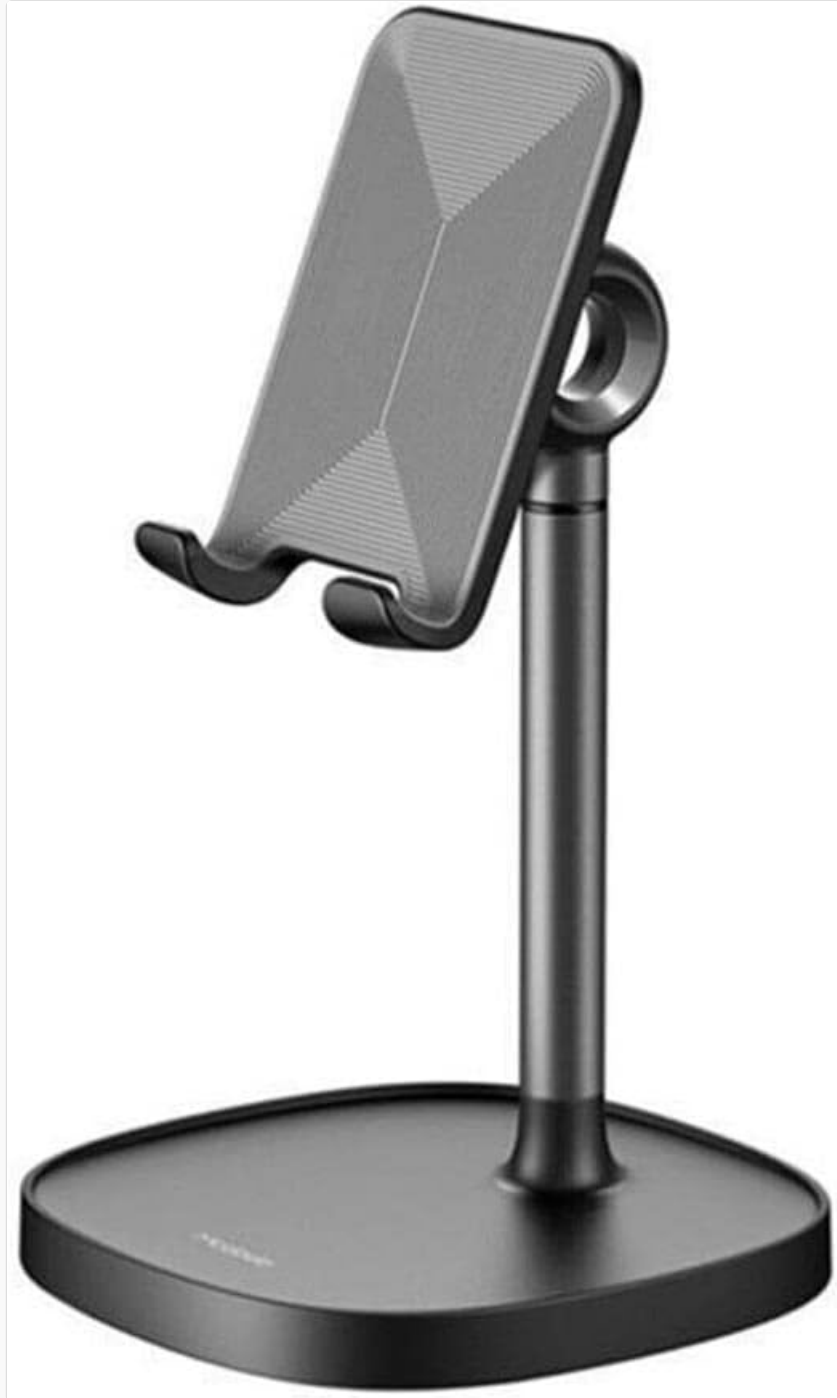
Figure 1: Front view of the Mcdodo TB-7821 Telescopic Desktop Holder.