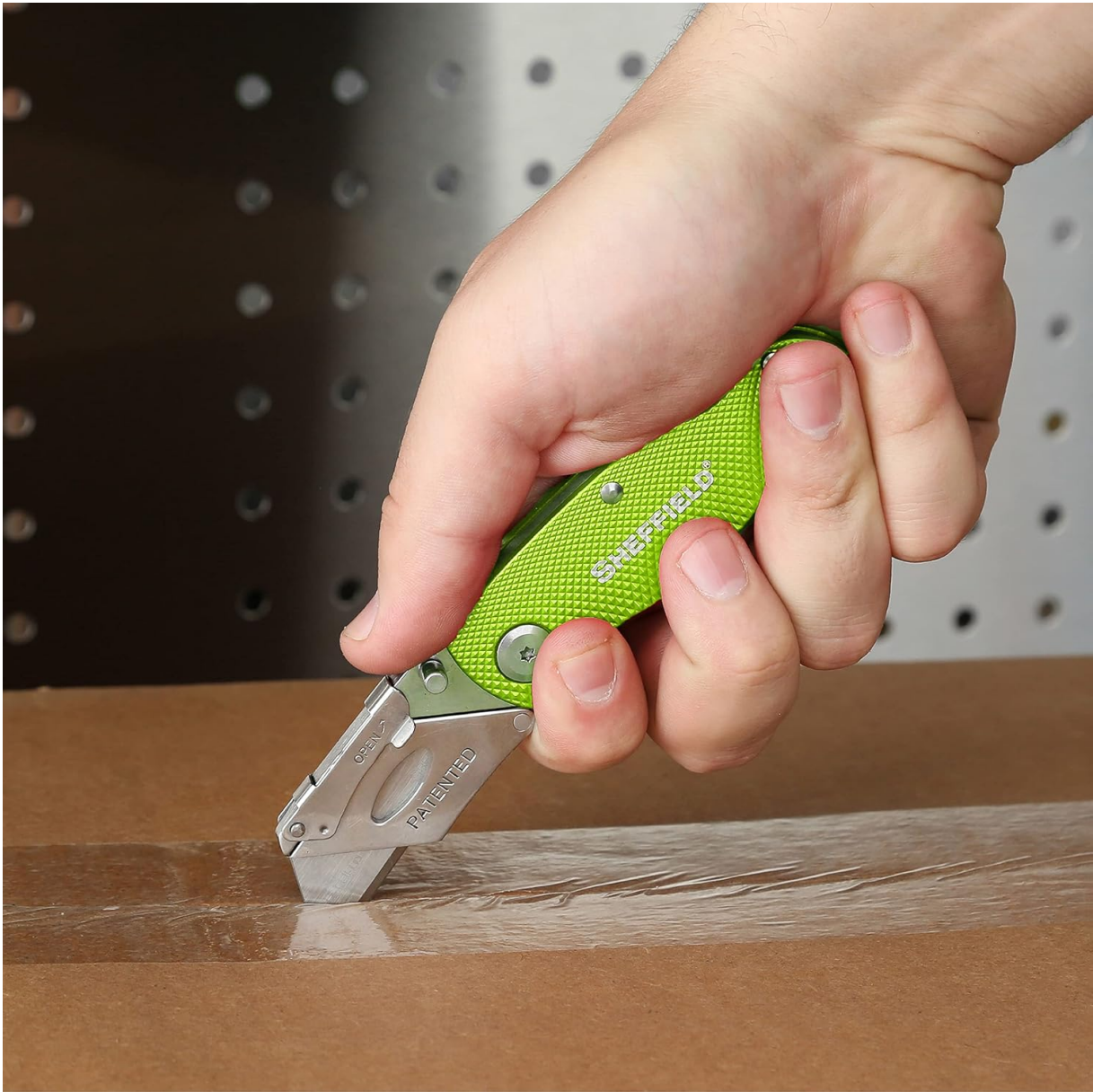
Image 3.1: A hand demonstrating the use of the utility knife to cut tape on a cardboard box.