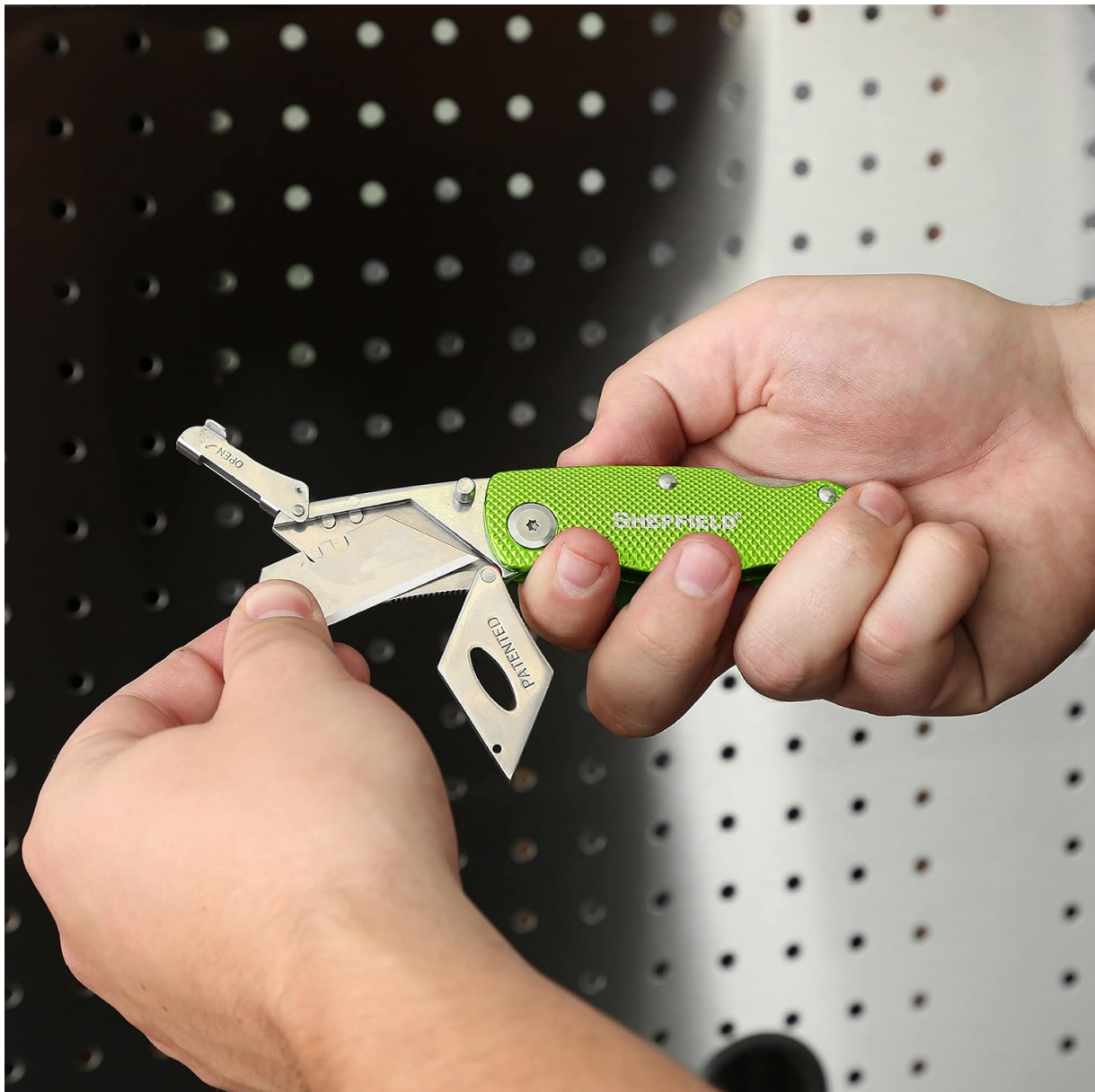
Image 2.2: A user demonstrating the process of replacing a blade using the quick-change mechanism.