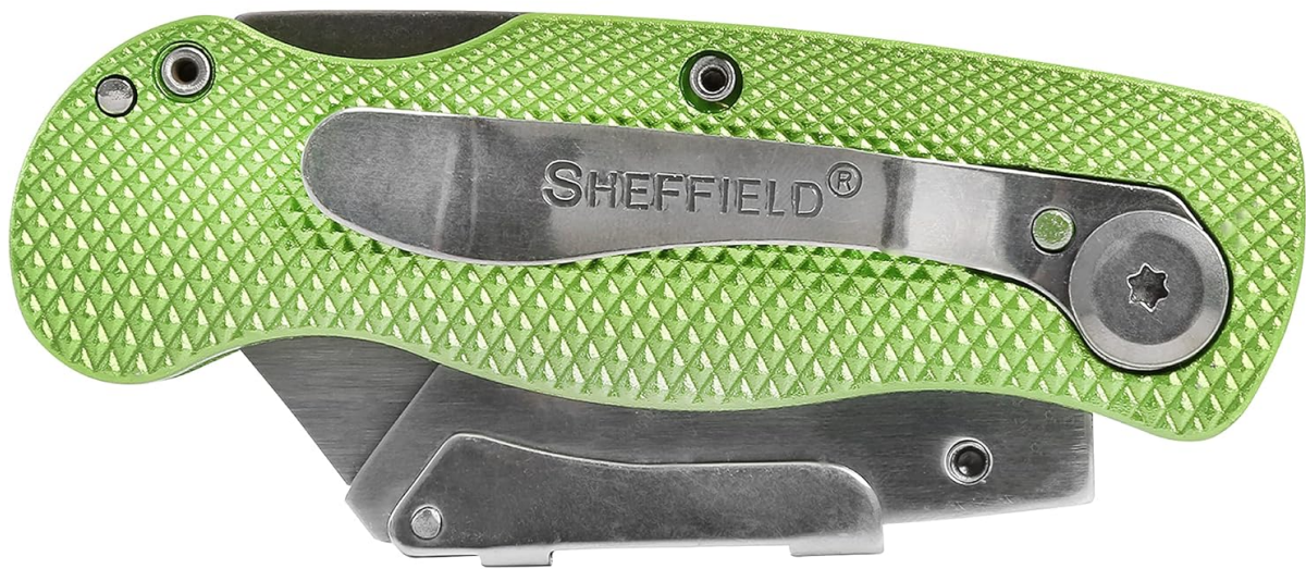
Image 1.2: Top and bottom views of the Sheffield Folding Utility Knife, highlighting the integrated pocket clip for convenient carrying.