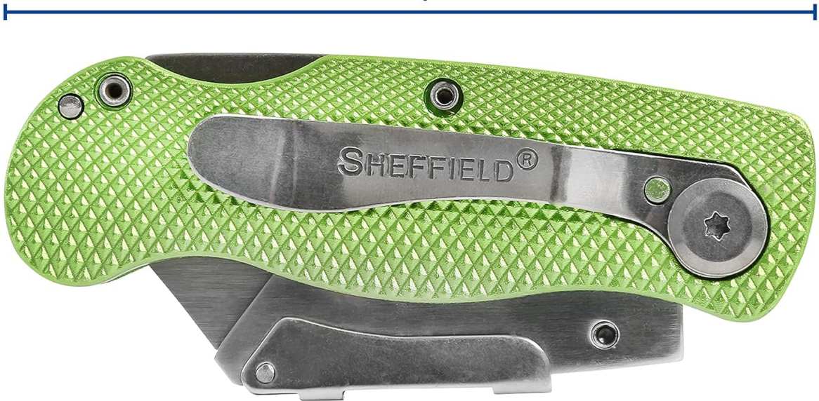
Image 1.1: Sheffield Folding Utility Knife showing its open length of 6 inches and closed length of 3-1/2 inches.