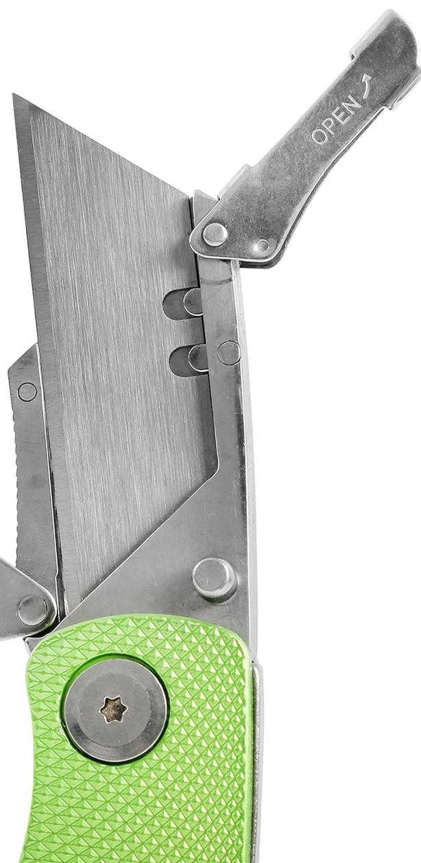
Image 2.1: Close-up view of the patented quick-change blade mechanism, illustrating how to open the holder for blade replacement. The knife accepts all standard utility blades.