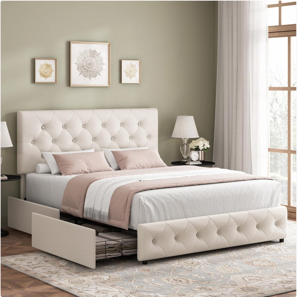
Image 1.1: The Keyluv Modern Upholstered Bed Frame with four storage drawers.