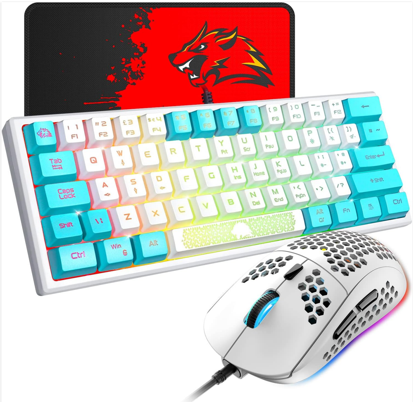
Image 1.1: The XINMENG 60% Gaming Keyboard and Mouse Combo, featuring a compact keyboard with RGB backlighting and a lightweight honeycomb optical mouse.