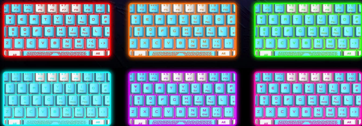
Image 4.1: Examples of various RGB backlight effects available on the keyboard, showcasing different color patterns.