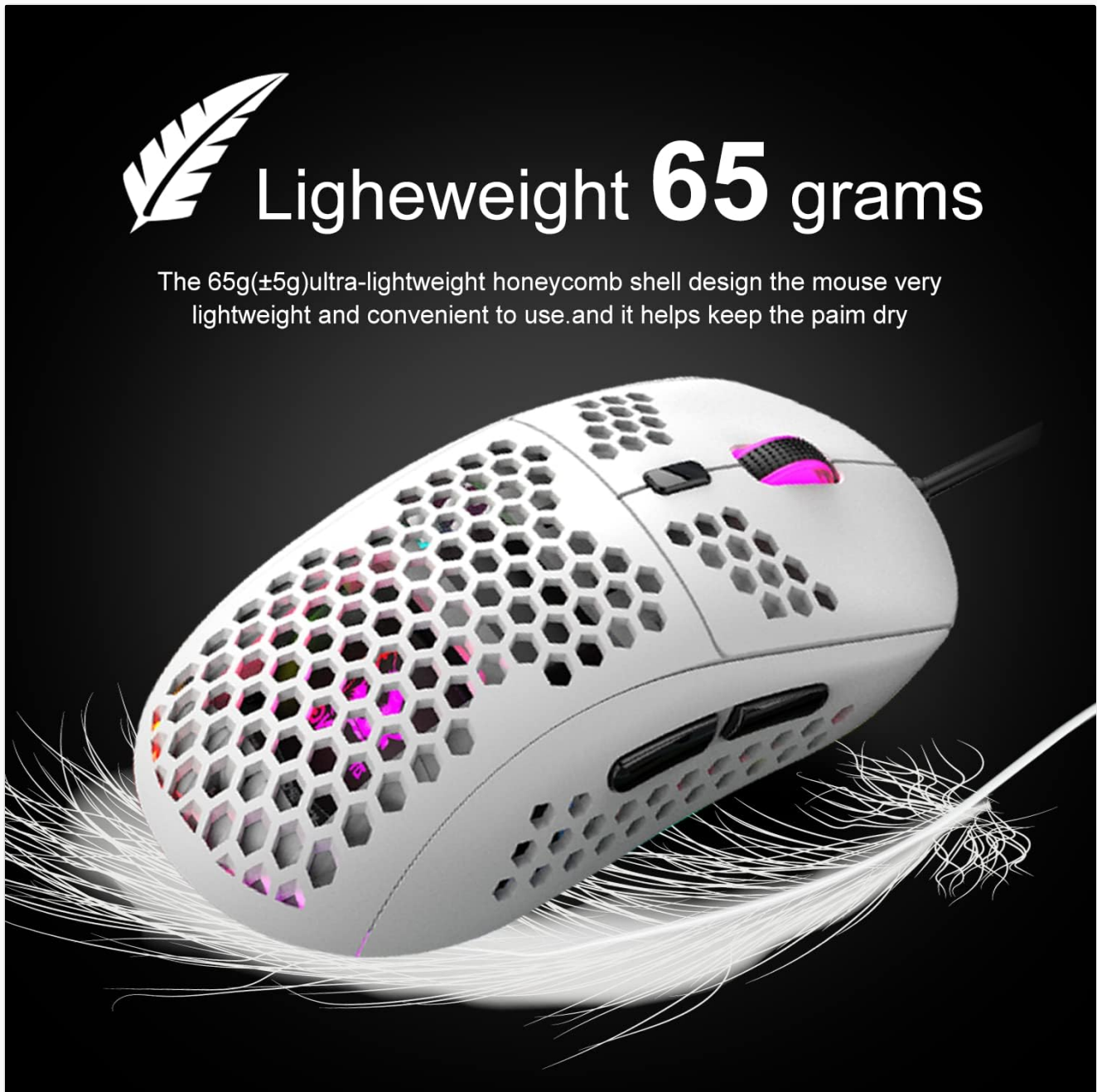
Image 4.6: The lightweight honeycomb shell design of the mouse, highlighting its ergonomic shape and perforated structure for comfort and heat dissipation.