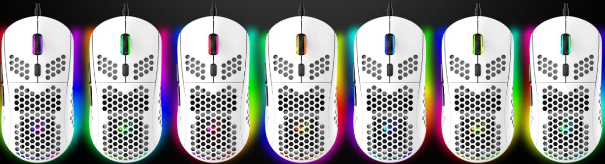
Image 4.4: Diagram of the 6-button gaming mouse, labeling the DPI button, scroll wheel, left/right buttons, and forward/backward buttons. It also shows the 7-color auto-changing breathing backlight.