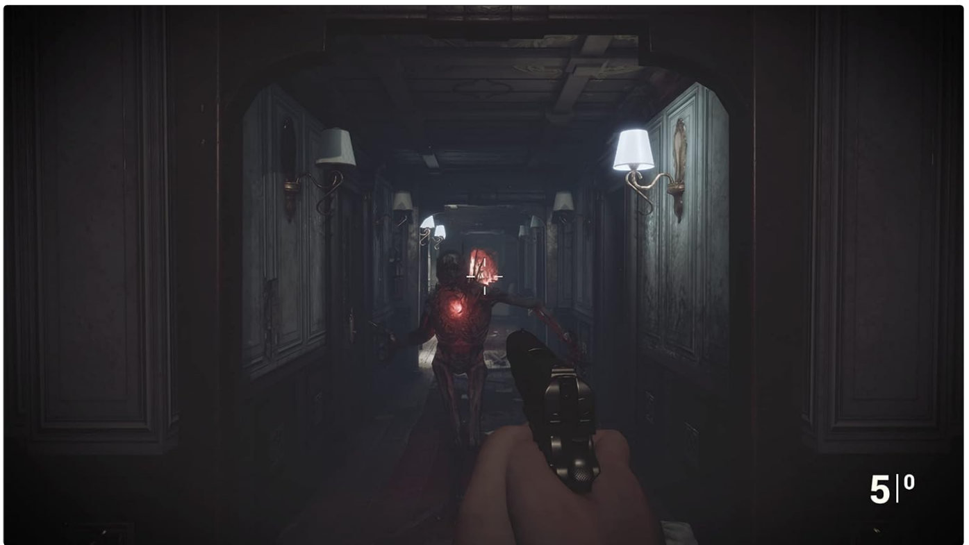
First-person perspective showing the player aiming a pistol at an approaching monster in a dimly lit corridor.