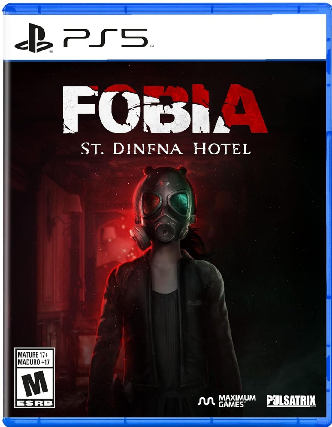
The official game cover for Fobia - St Dinfna Hotel on PlayStation 5.