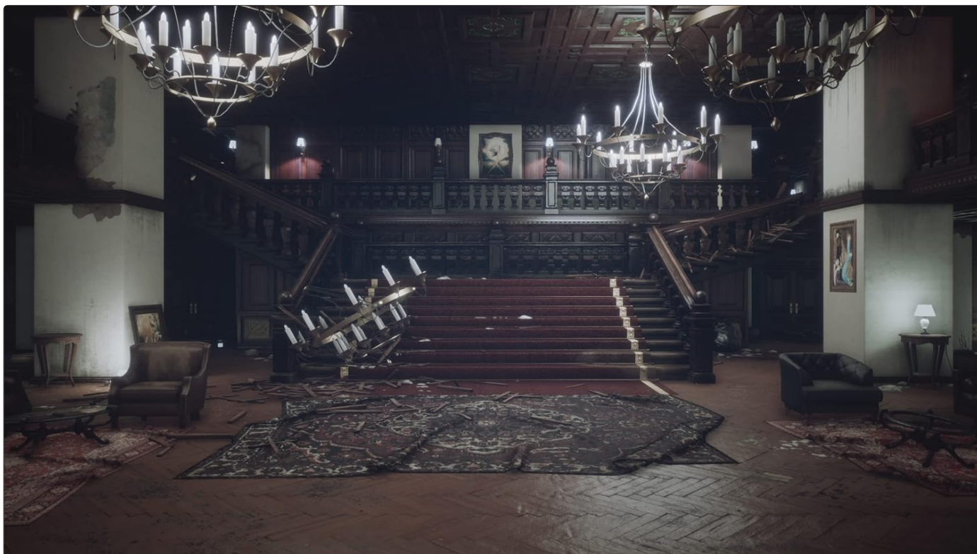
A view of the grand, yet decaying, lobby of the St. Dinfna Hotel, a key location in the game.