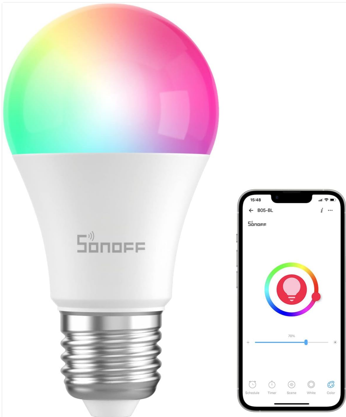
Image 1: SONOFF B05-BL-A19 Smart RGB LED Bulb and its eWeLink app interface.