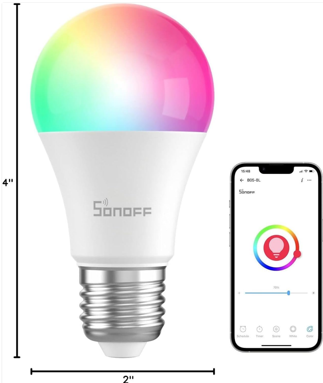
Image 9: Technical specifications and dimensions of the SONOFF B05-BL-A19 Smart RGB LED Bulb.