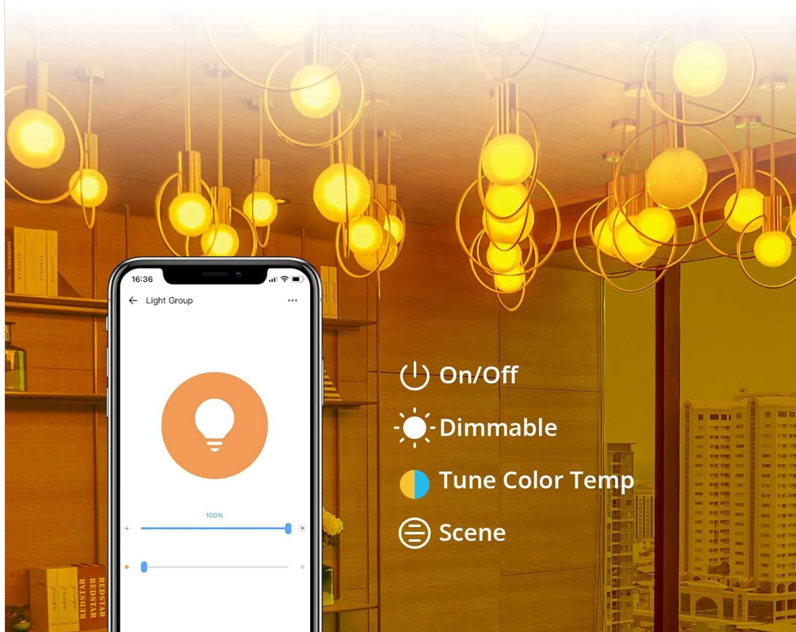
Image 7: Group control allows managing multiple bulbs simultaneously through the eWeLink app.

Manage all lights by group-control. Lightening your home and decorating your life.