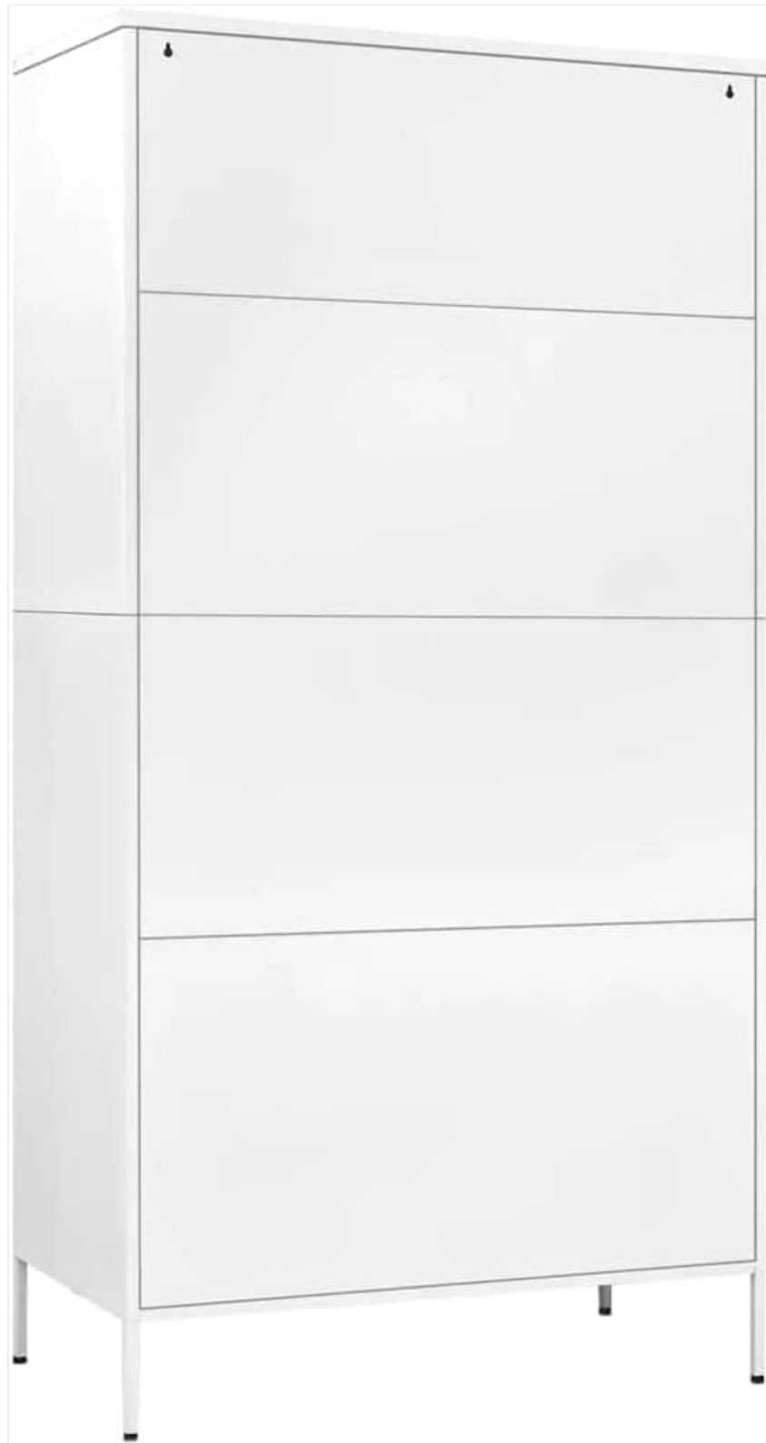
Image 2.1: Detail of the rear of the wardrobe, indicating the wall attachment points for stability.