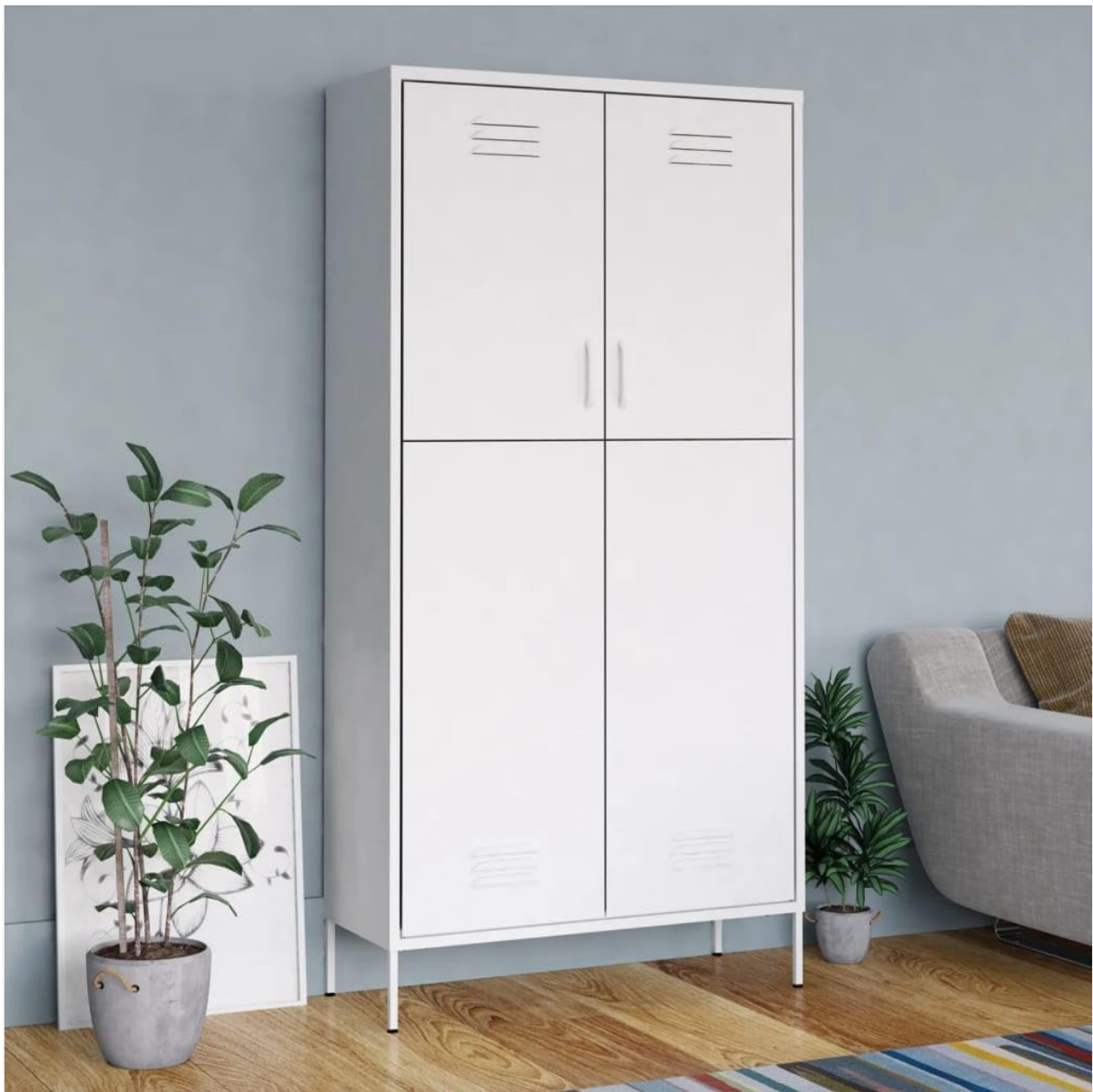
Image 1.1: The vidaXL White Steel Wardrobe, showcasing its design and how it fits into a living space.