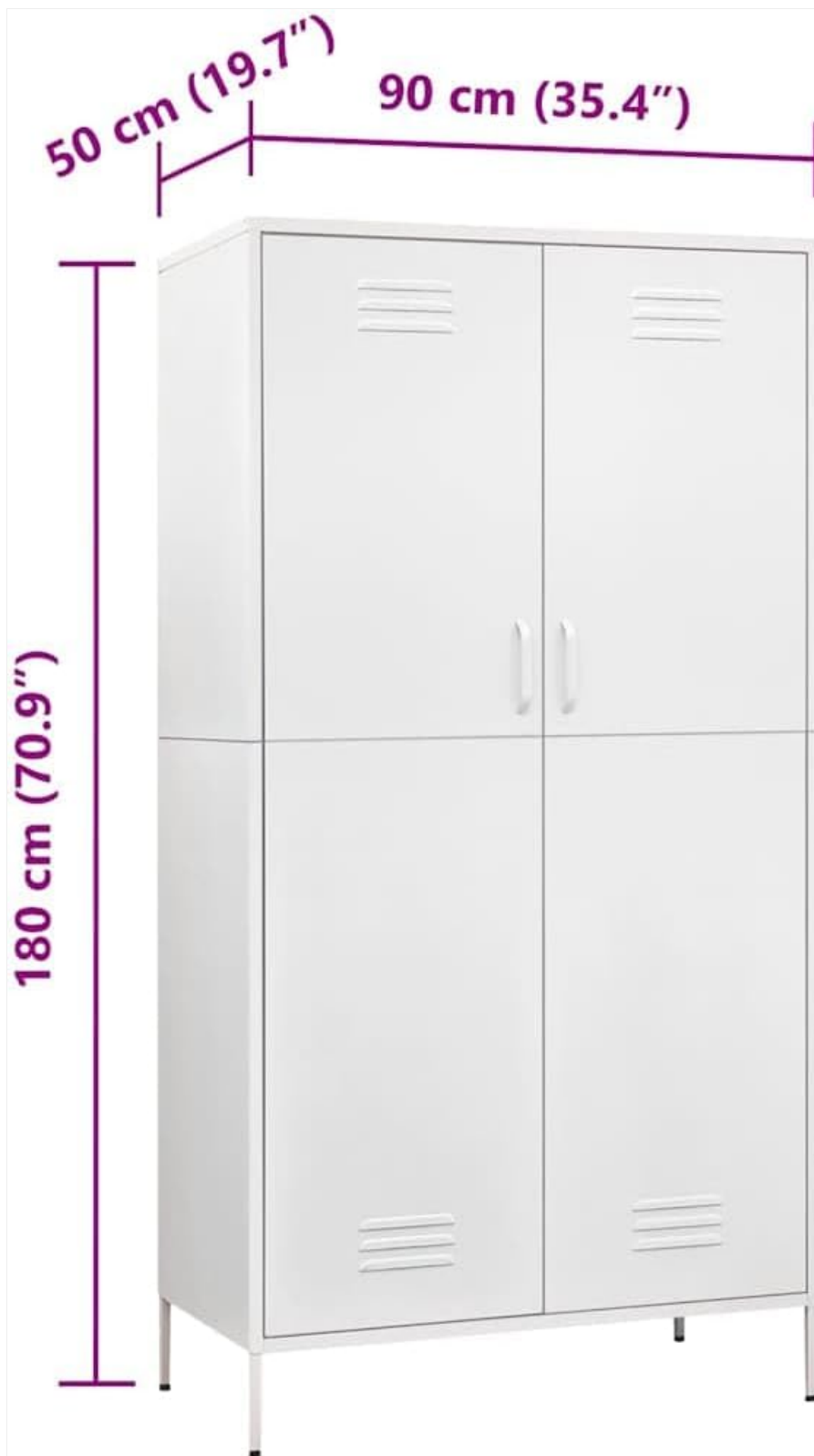
Image 3.1: Dimensional diagram of the wardrobe, illustrating its width, depth, and height.