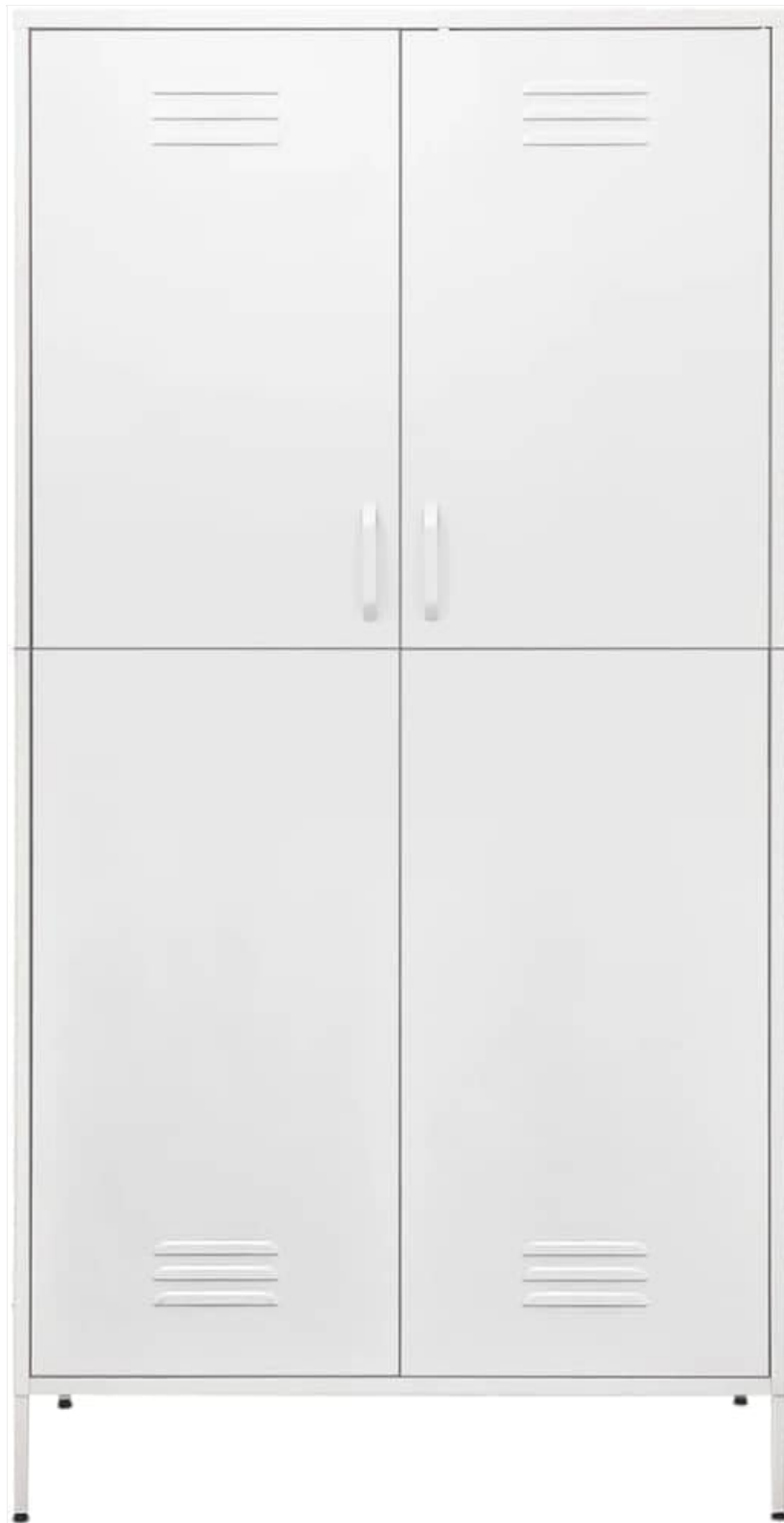
Image 5.1: Front view of the wardrobe, showing the four doors and overall structure.