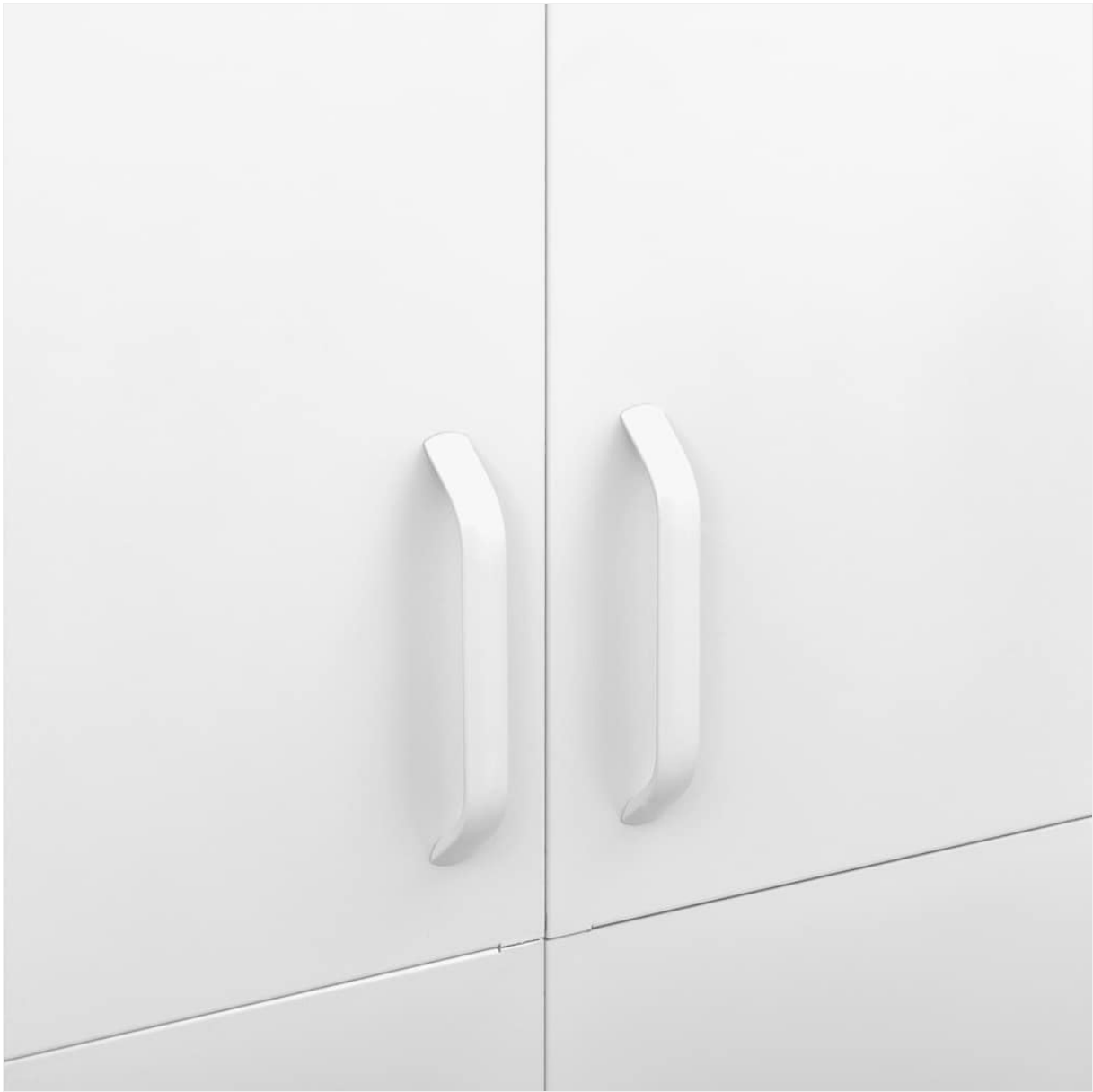
Image 4.2: Detail of the door handles, which are installed during the final assembly steps.