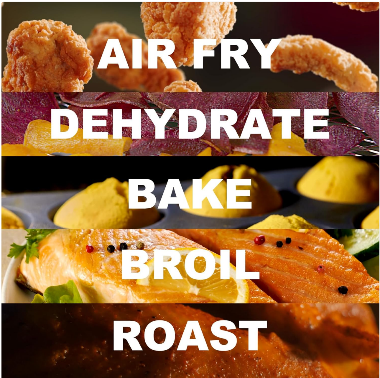
Image: Visual representation of key cooking functions available on the appliance.

The oven features 22 smart pre-set functions for convenience. Simply select the desired preset, and the oven will automatically set the optimal temperature and time. You can still adjust these settings manually if needed.