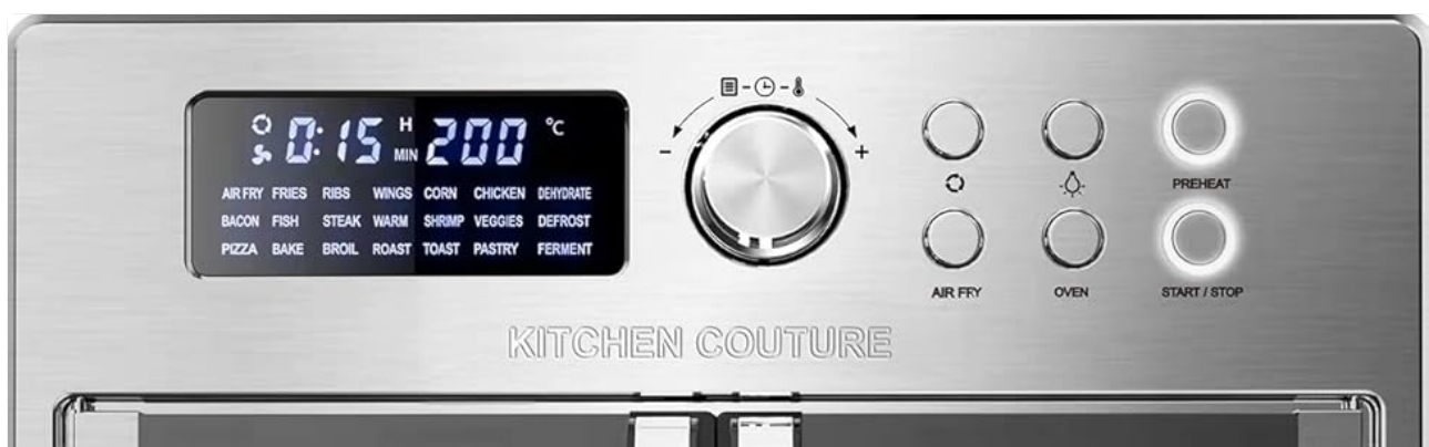
Image: Detailed view of the digital control panel, showing the display, rotary knob, and function buttons.

The Kitchen Couture Air Fryer Oven features an intuitive control panel with a digital display, a rotary knob, and several function buttons.