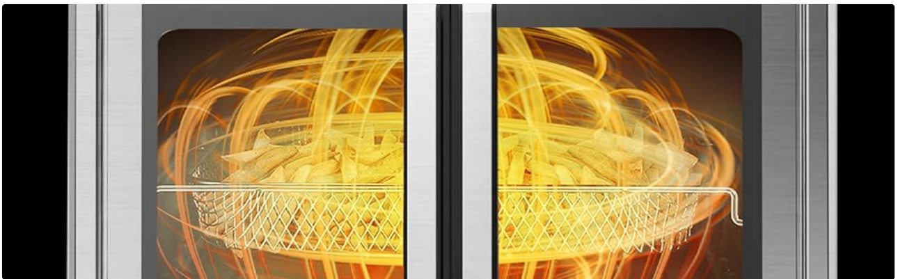
Image: French fries being air-fried in the basket, illustrating the rapid air circulation technology for crispy results.