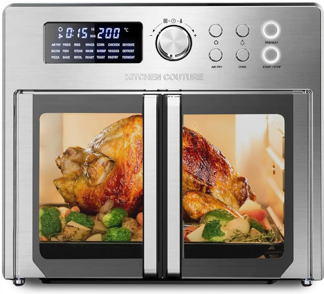
Image: The Kitchen Couture 25 Litre French Door Air Fryer Oven, showcasing its sleek stainless steel design and dual French doors.