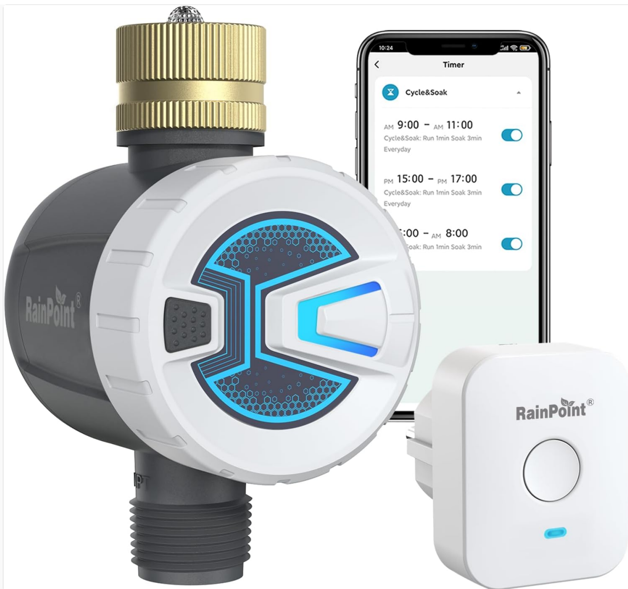
Figure 1: RAINPOINT Sprinkler Water Timer and Wi-Fi Hub

Description: This image displays the main components of the RAINPOINT Smart Wireless Hose Faucet Timer system, including the water timer unit, the compact Wi-Fi hub, and a smartphone screen illustrating the accompanying mobile application interface.