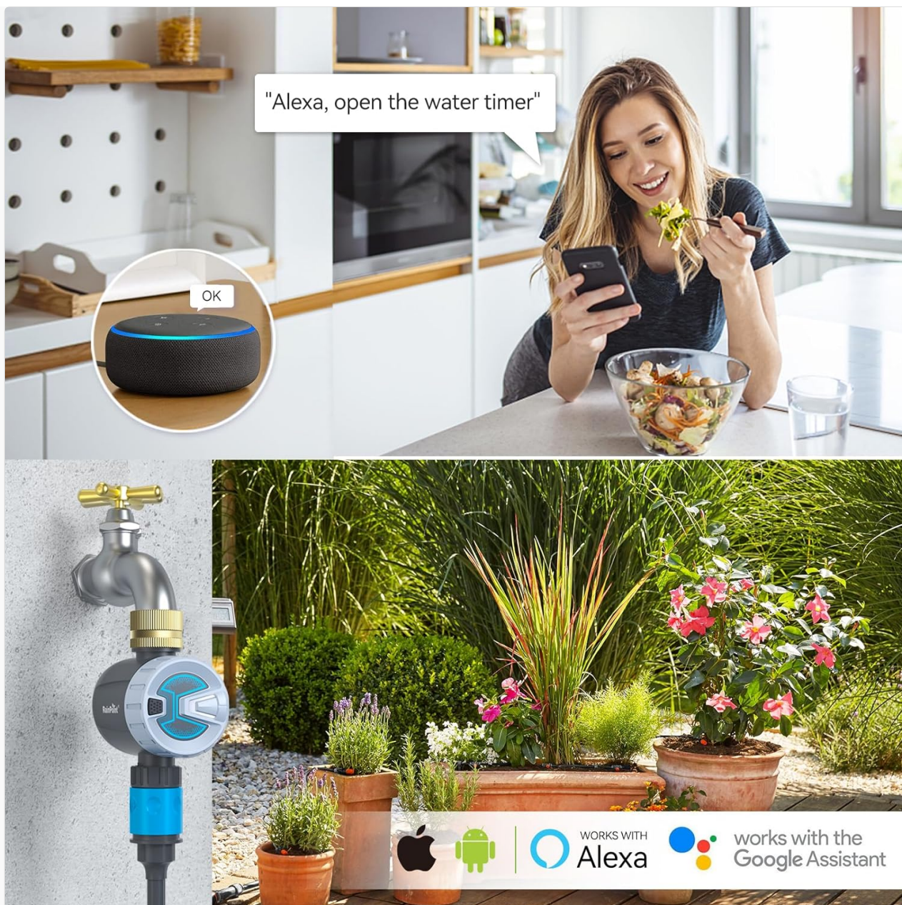
Figure 3: Water Timer Connected to Faucet

Description: This image shows the RAINPOINT water timer securely attached to an outdoor hose faucet, ready for operation. The connection point is clearly visible.