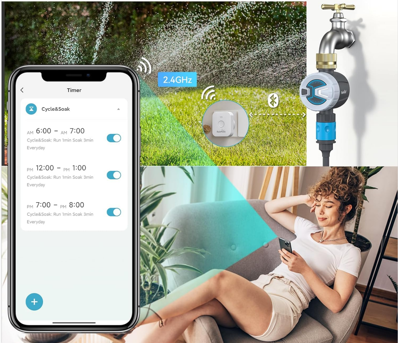
Figure 6: Multiple Timers in App

Description: This image illustrates the RAINPOINT app's capability to manage multiple water timers, showing a network diagram of a central Wi-Fi hub connected to several individual water timers.