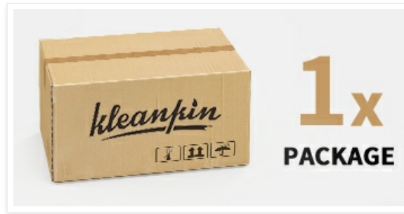
Image 3.1: The product is shipped in a single package. Ensure the package is intact upon delivery.