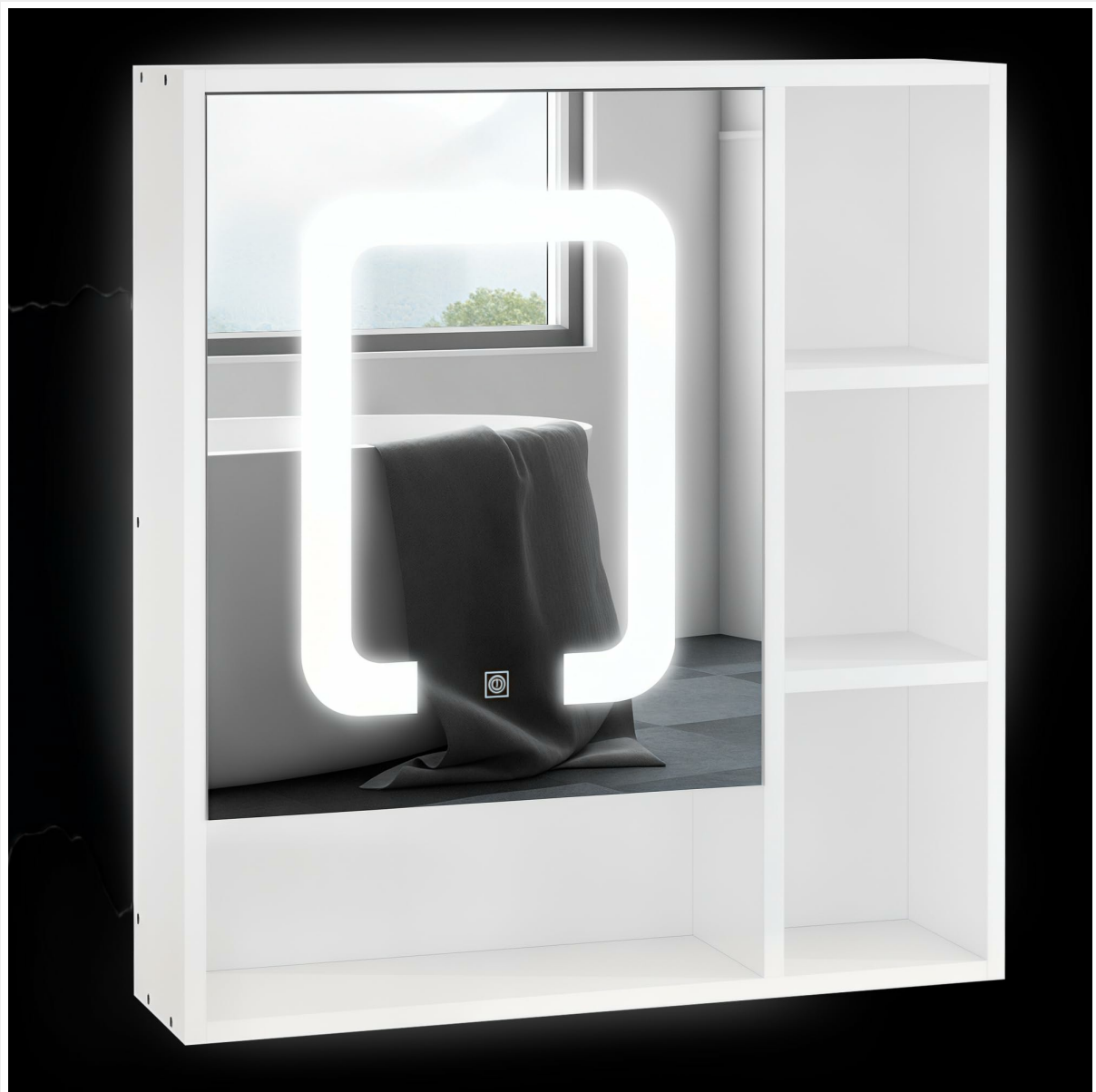
Image 1.1: The Kleankin Lighted Medicine Cabinet installed in a modern bathroom setting, showcasing its integrated mirror and open shelving.