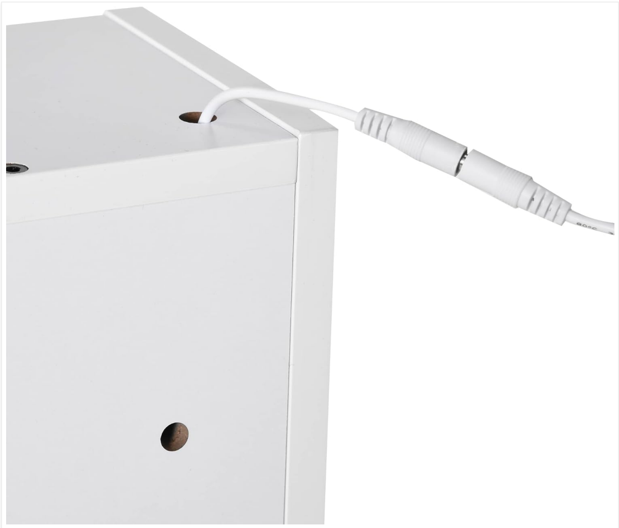
Image 6.2: The USB power input for the LED lights and charging port is located on the side of the cabinet.