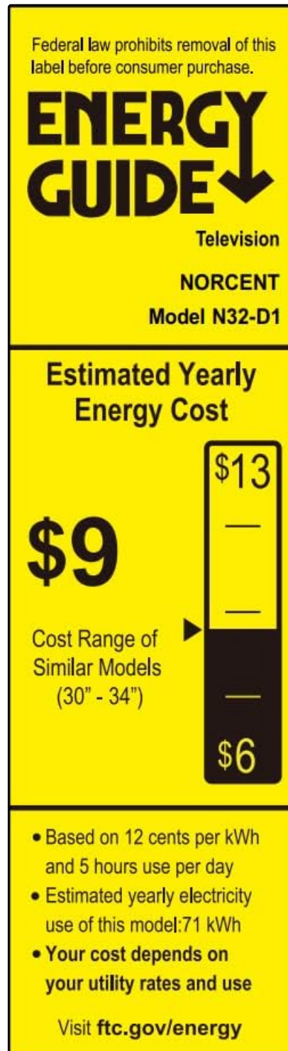
Energy Guide label for the Norcent N32-D1, indicating estimated yearly energy cost and consumption.