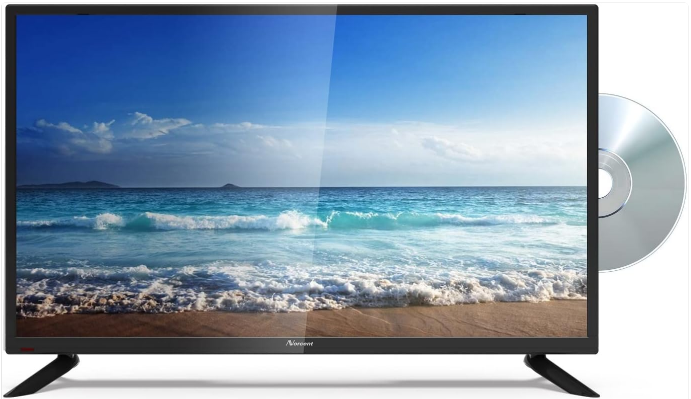
Front view of the Norcent N32-D1 TV, showcasing its display and integrated DVD player design.

This manual provides comprehensive instructions for the setup, operation, and maintenance of your Norcent N32-D1 32-Inch 720P LED LCD HDTV with a built-in DVD player. Please read this manual thoroughly before operating the unit to ensure proper use and to maximize your viewing experience.