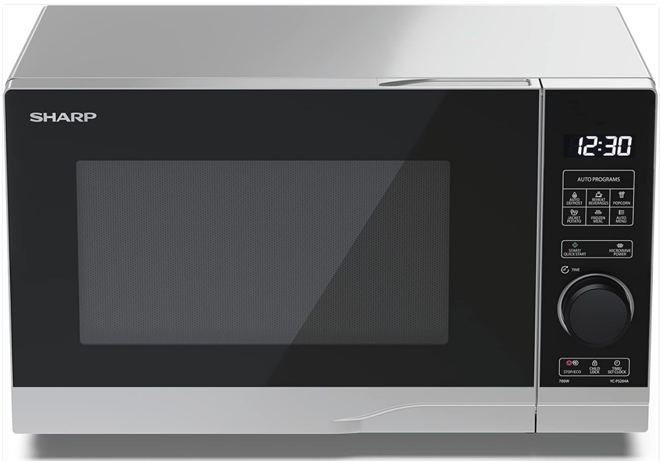
Image: Front view of the Sharp YC-PS204AE-S microwave oven, highlighting the semi-digital control panel on the right side. The display shows "12:30" and various auto program icons are visible above the main dial.