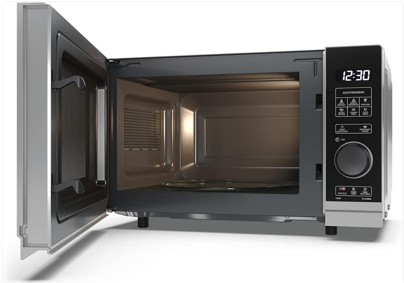
Image: The interior of the Sharp YC-PS204AE-S microwave oven with the door open, showing the glass turntable and the stainless steel interior. This view is useful for understanding how to place food and clean the cavity.