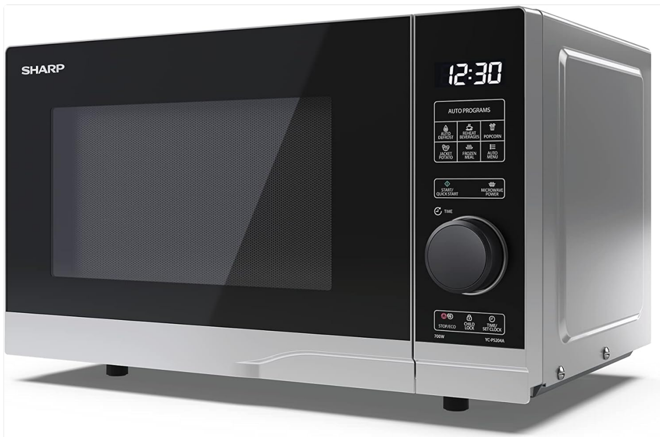
Image: Angled front view of the Sharp YC-PS204AE-S microwave, showing the sleek silver and black design. The control panel is clearly visible with its digital display and rotary knob.

The control panel features a digital display, a rotary dial for setting time and power, and several touch buttons for various functions and automatic programs.