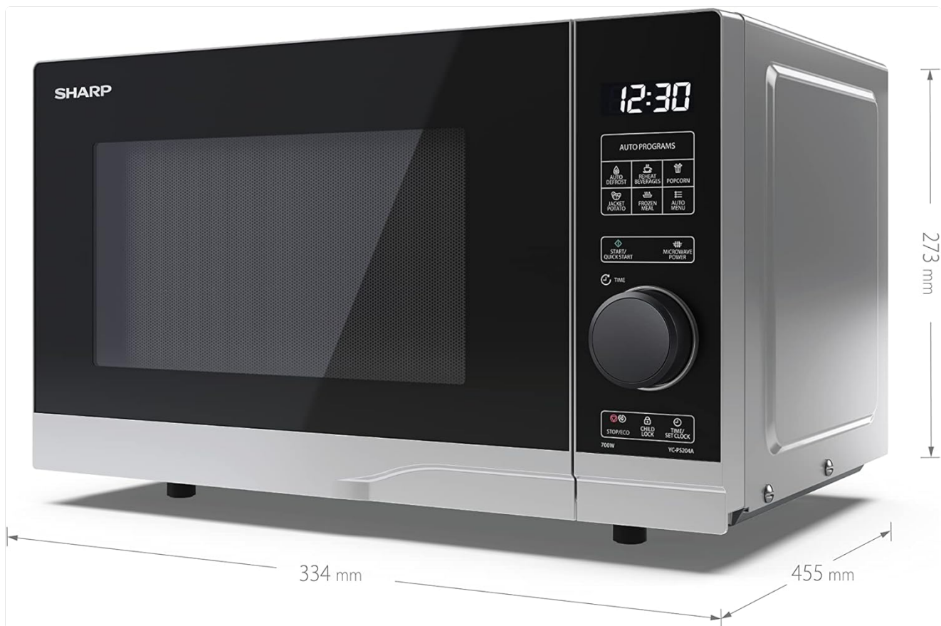
Image: A diagram showing the dimensions of the Sharp YC-PS204AE-S microwave oven, with measurements for height (273 mm), width (455 mm), and depth (334 mm). This helps users ensure proper placement and ventilation space.