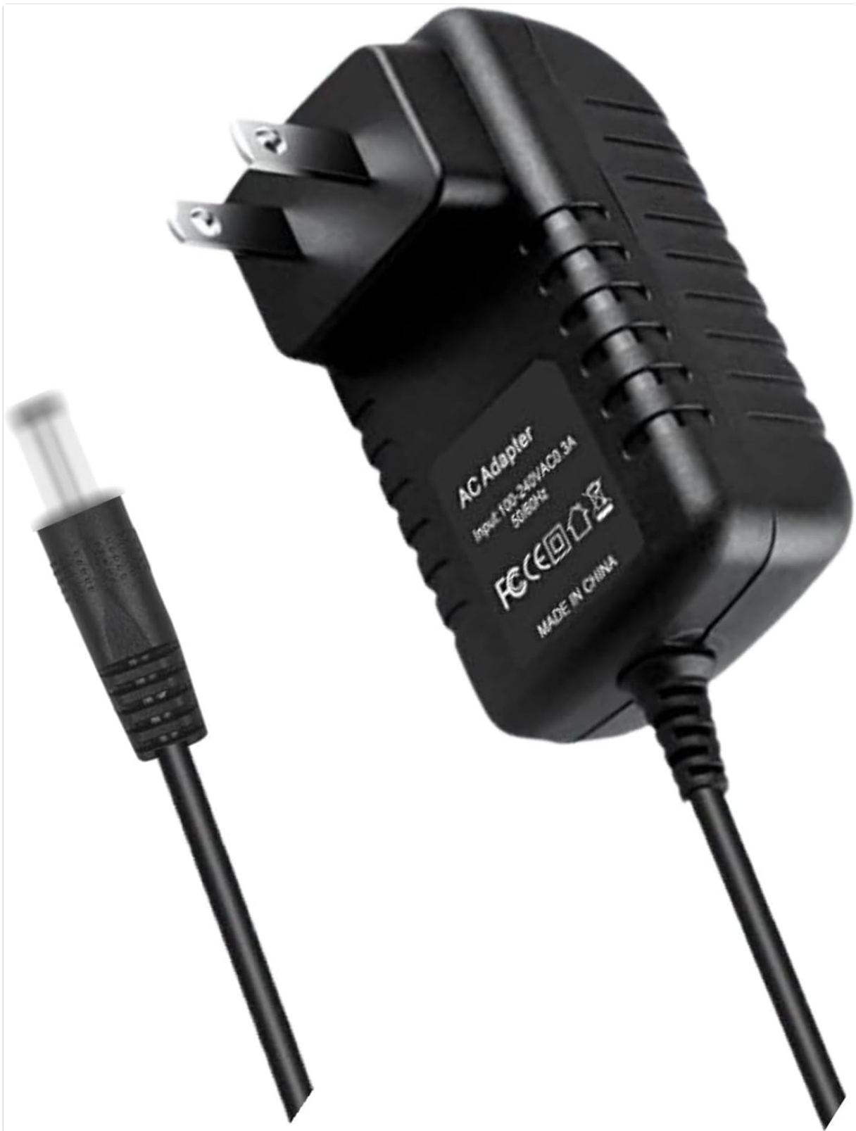
Image 1.1: The saschedross AC/DC Adapter, showing the main unit and its barrel connector cable.