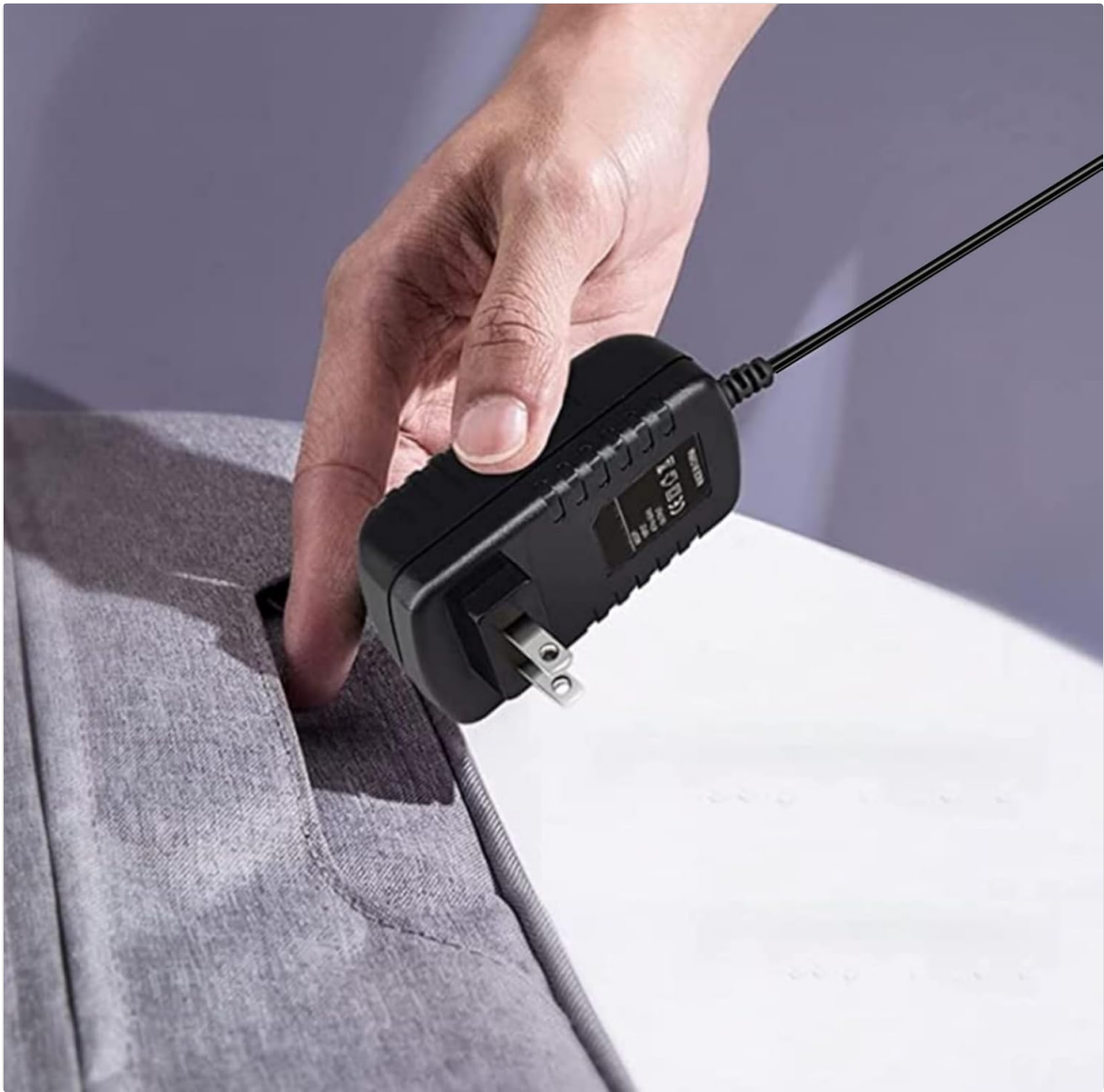
Image 6.1: The adapter with its cable, illustrating its length for proper placement and storage.