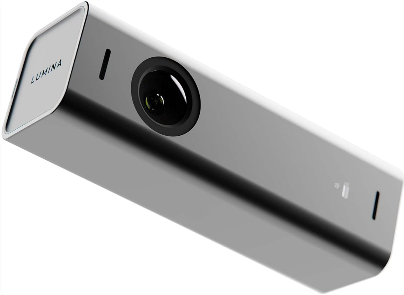
Image: The Lumina 4K Webcam, showcasing its sleek Atomic Grey design.

The Lumina 4K Webcam is designed to enhance your video call experience with its advanced AI-powered capabilities. It delivers DSLR-quality video through an ultrawide 4K camera with a 95-degree field of view. Equipped with dual noise-cancelling microphones, it captures clear audio while minimizing background noise. The webcam's aerospace-grade aluminum body ensures durability and a premium aesthetic that complements modern workspaces.