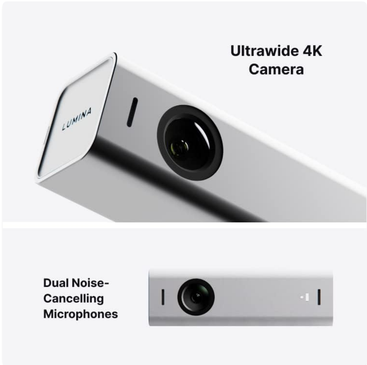
Image: The Lumina 4K Webcam connected to a computer, ready for use.

Video: A brief overview demonstrating the Lumina 4K Webcam's AI capabilities and ease of use.