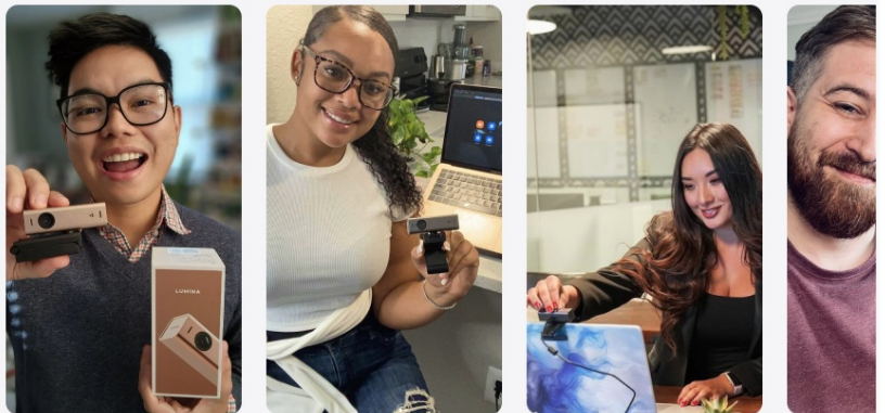
Image: A customer support representative, symbolizing the expert support available for Lumina products.