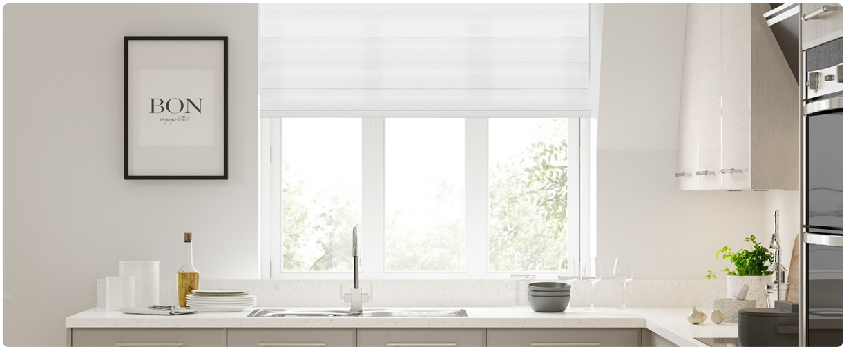
Image: Illustration of the quality craftsmanship and components of the blinds.