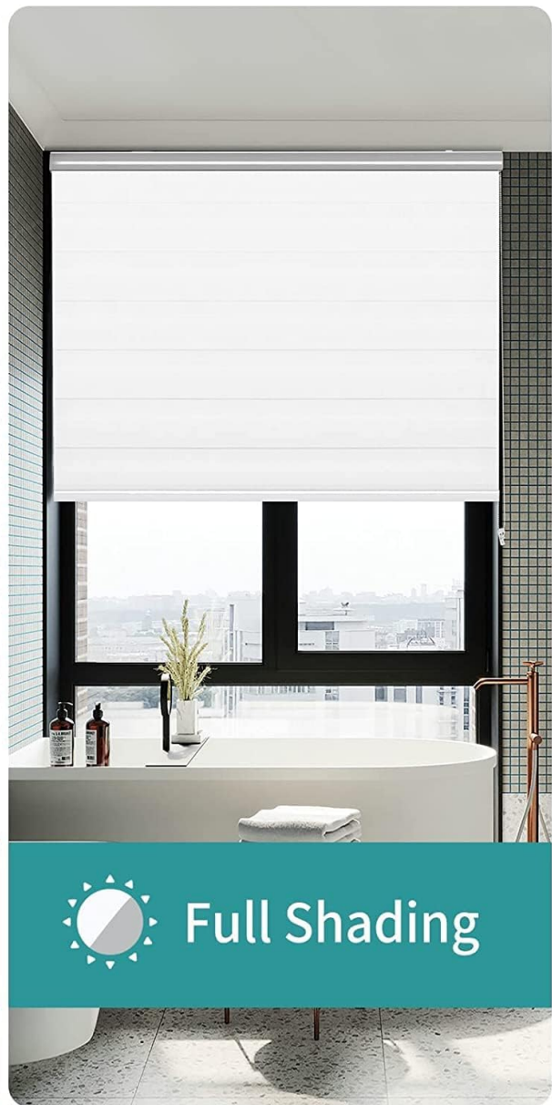
Image: Visual representation of semi-shading and full-shading modes for light and privacy control.