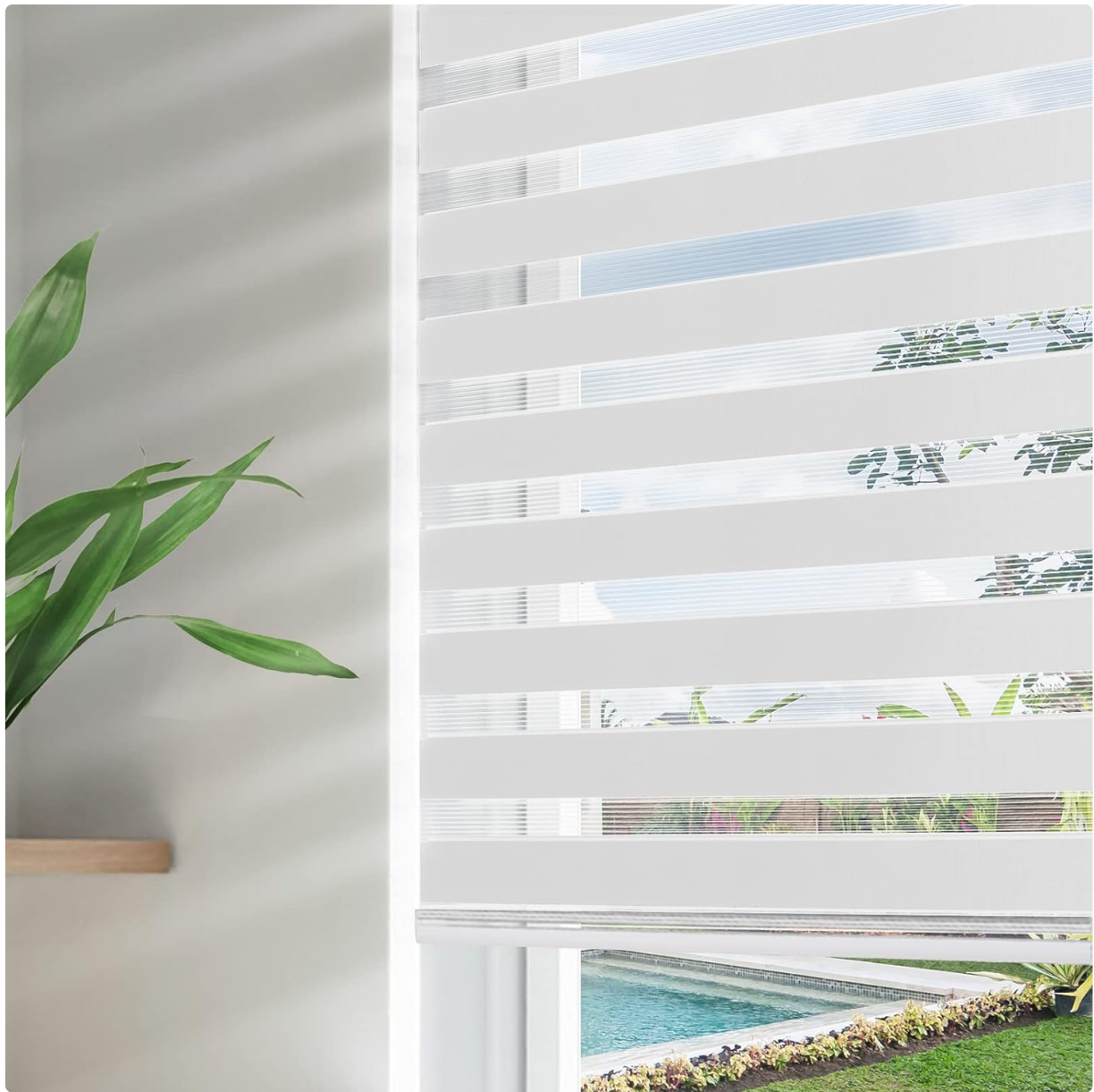
Image: Joydeco Cordless Zebra Blinds in off-white, showcasing their design and light filtering capabilities.