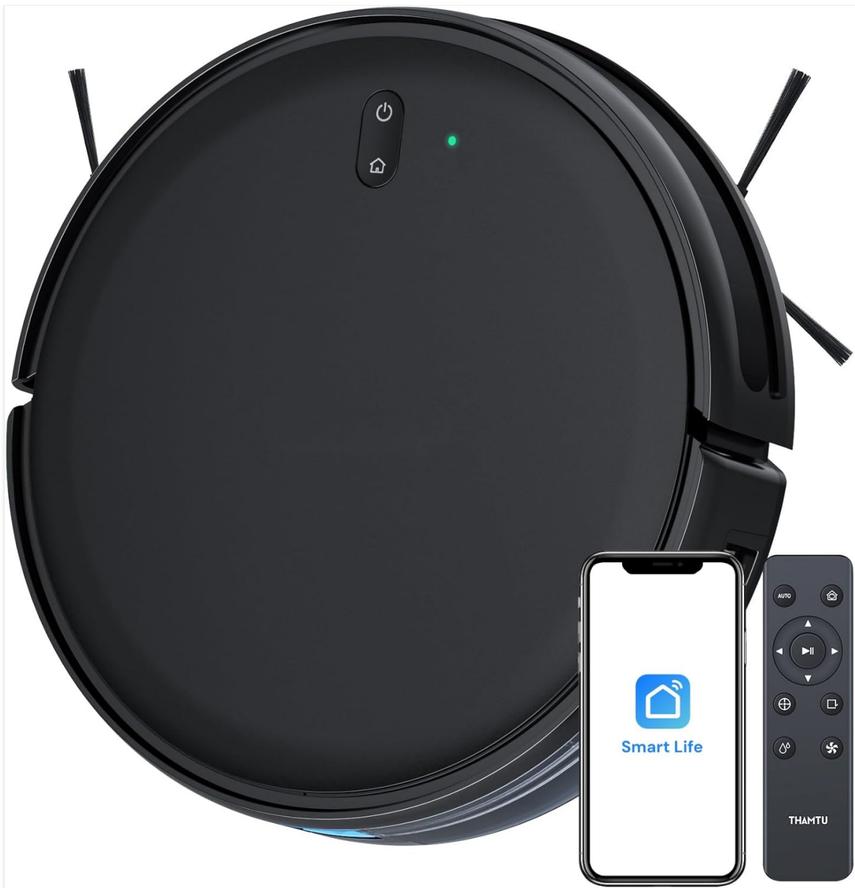
Image 1.1: Thamtu G11 Robot Vacuum Cleaner and Mop, remote control, and smartphone displaying the control application.