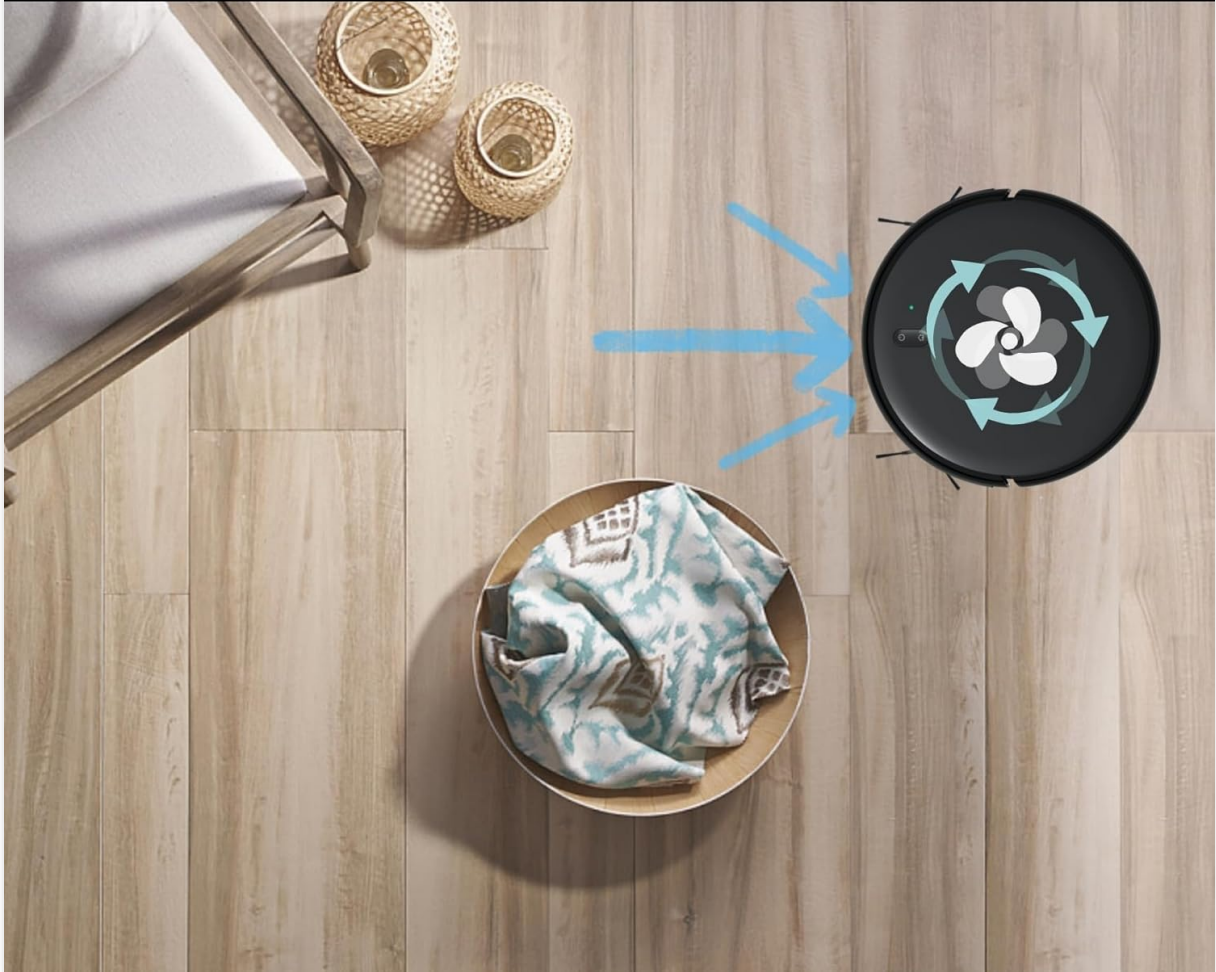
Image 9.1: A visual representation of the Thamtu G11's strong suction power, collecting debris.

Strong suction picks up debris on hard floors and carpets