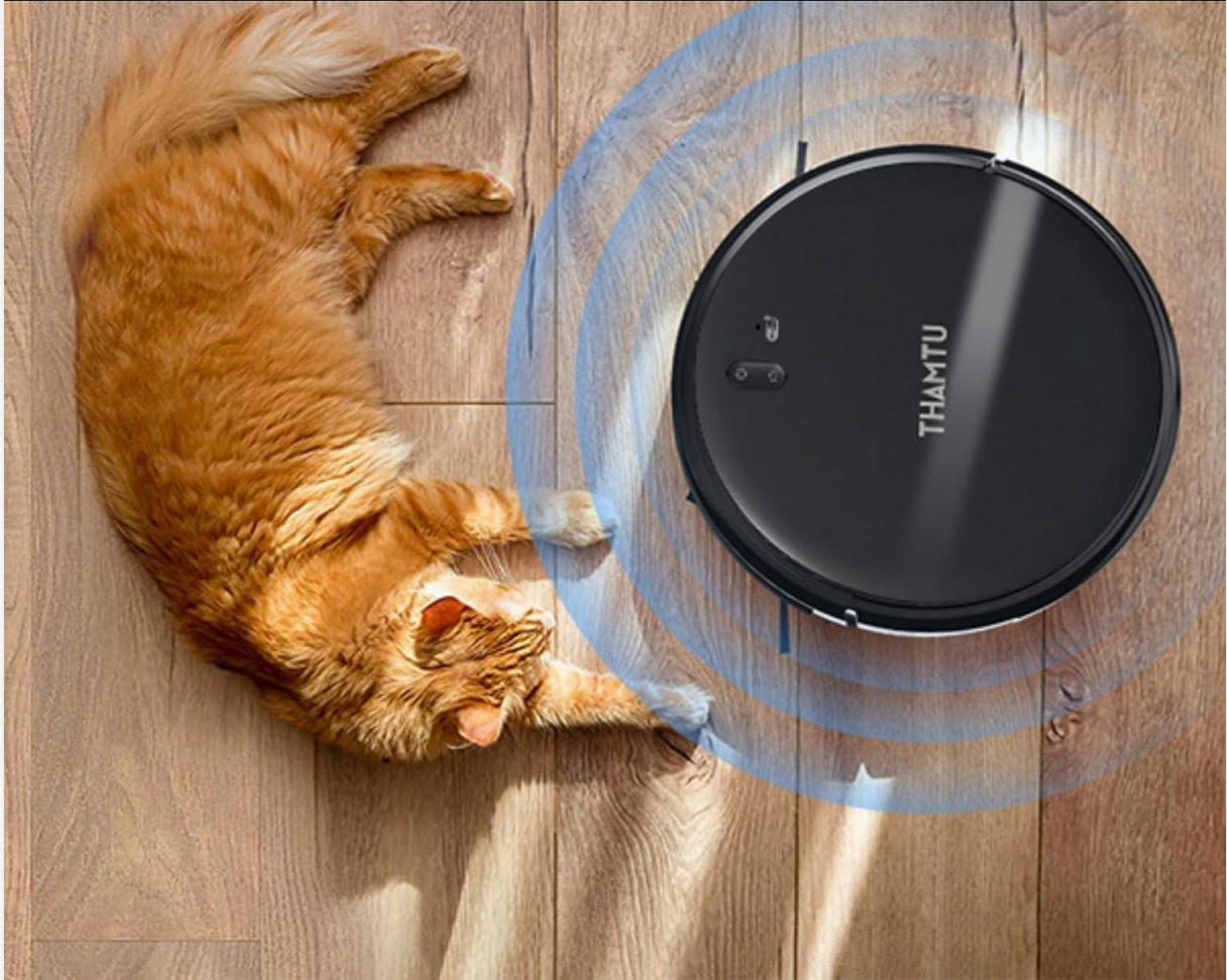
Image 6.1: The Thamtu G11 Robot Vacuum operating on a wooden floor, demonstrating its ability to clean pet hair.

Robot vacuum offers 3000Pa powerful suction to pick up pet hair