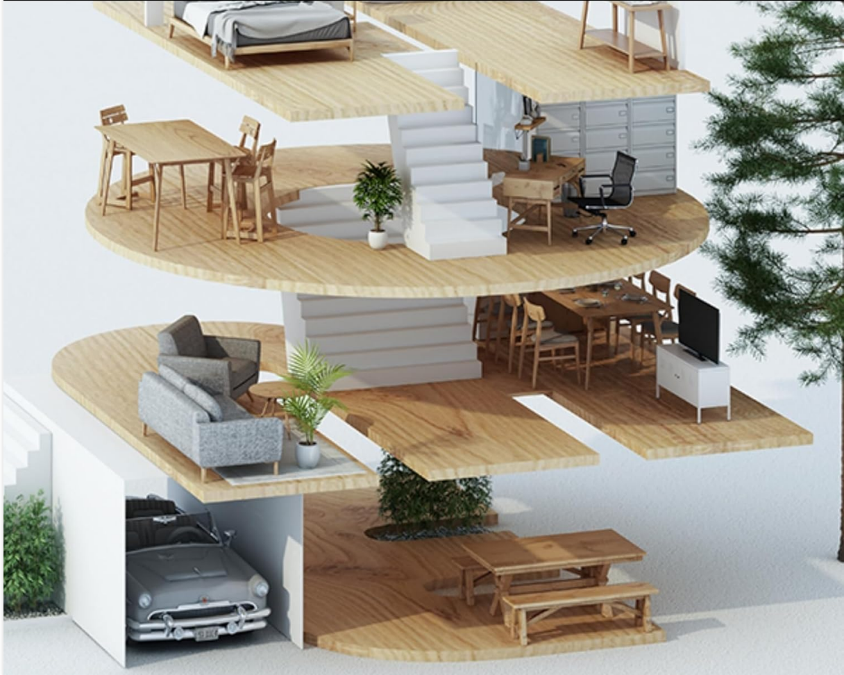
Image 6.2: A diagram illustrating the robot vacuum's capability to clean multiple areas, representing its extended running time.