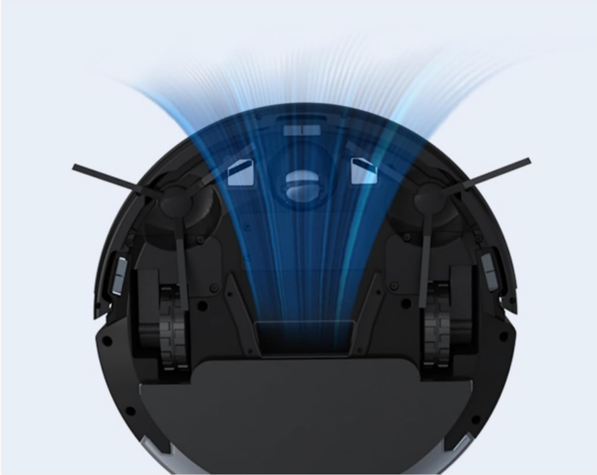
Image 4.2: Underside of the Thanttu G11 Robot Vacuum, highlighting the suction port and side brushes.

Unique suction port design does not entangle hair