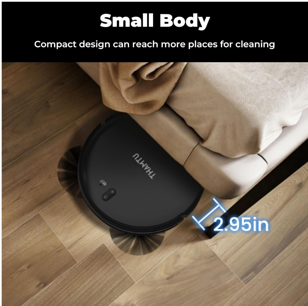
Image 4.1: The Thamtu G11 Robot Vacuum Cleaner's slim profile allows it to clean under furniture.