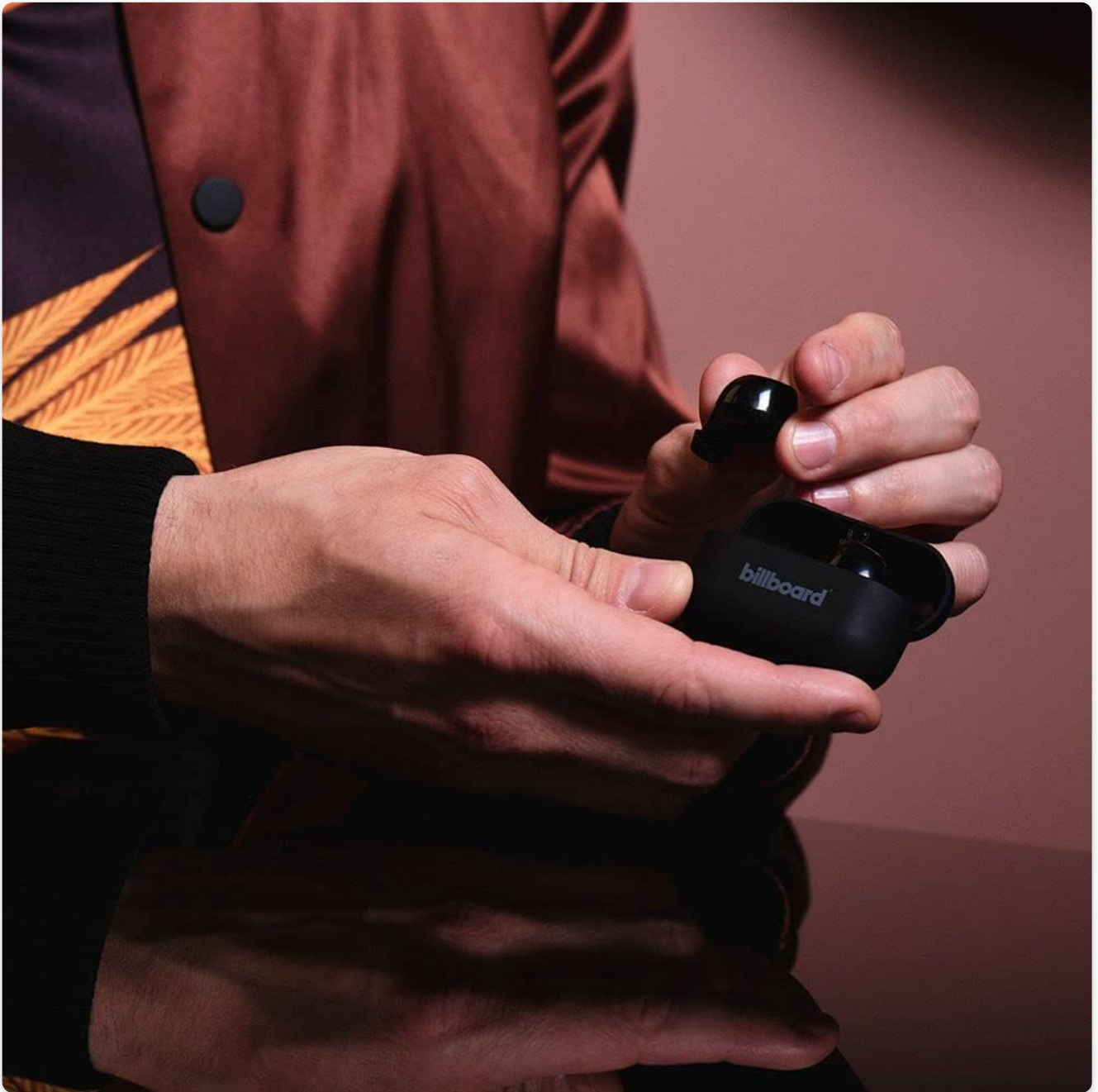
Image: Hands demonstrating the placement of a Billboard Soul Track earbud into its charging case.