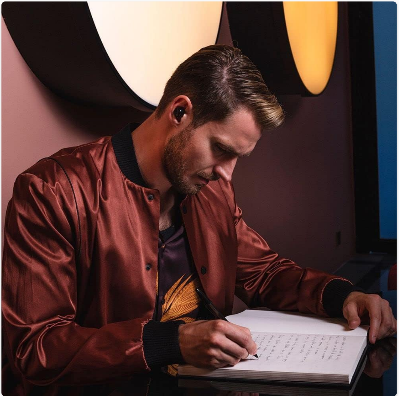
Image: A man wearing the Billboard Soul Track earbuds, demonstrating their use during a focused activity like writing.