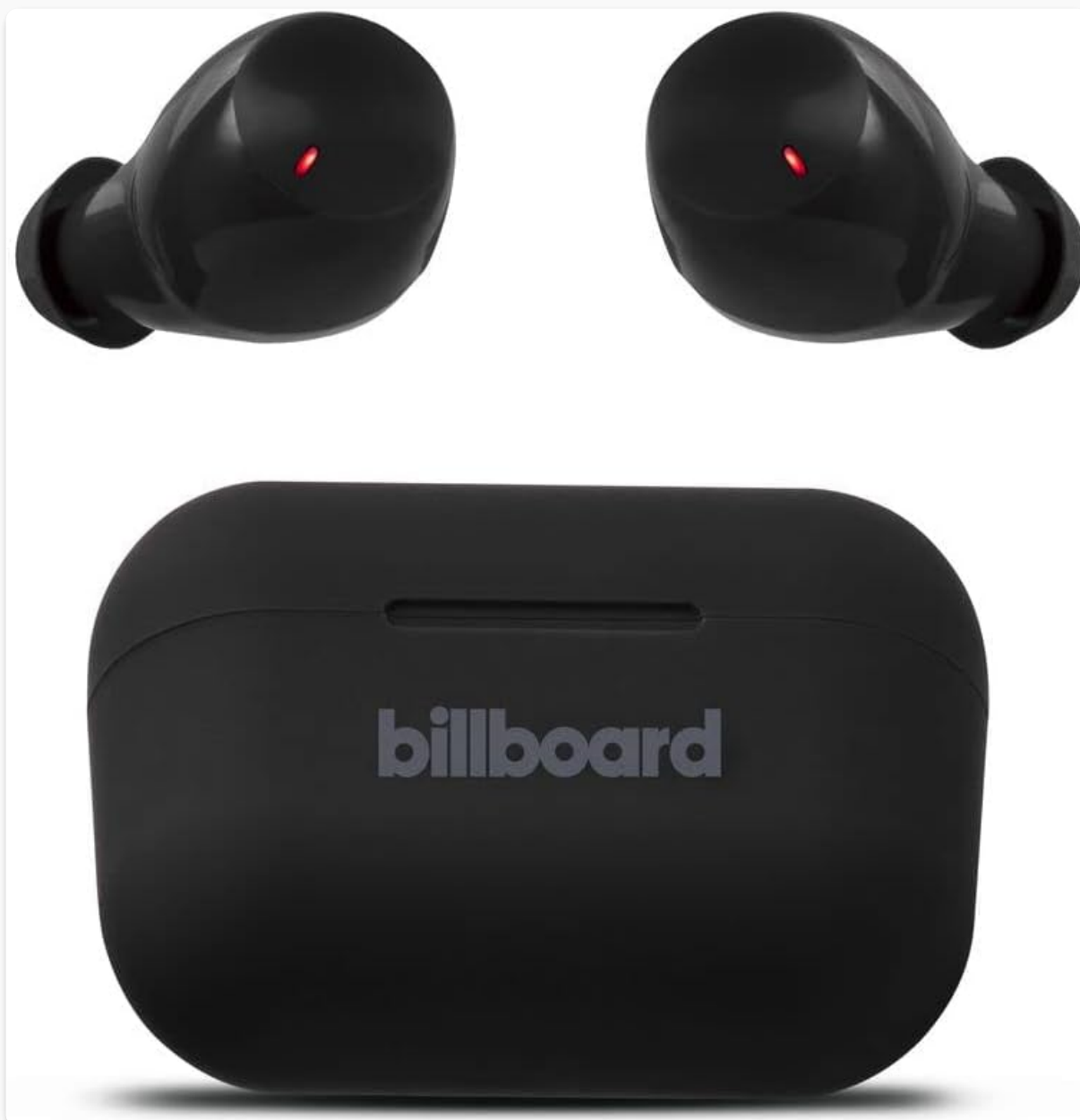
Image: The Billboard Soul Track Wireless Earbuds and their compact charging case.