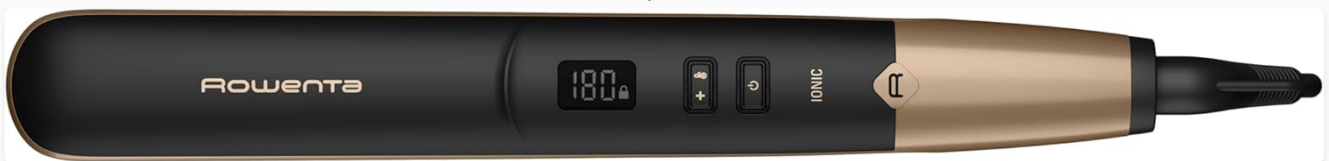
Image: A top-down view of the straightener, highlighting the digital temperature display and control buttons for easy adjustment.