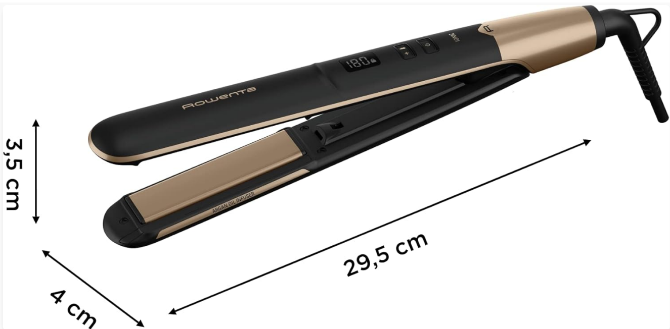
Image: Dimensional diagram of the Rowenta SF4630 straightener, indicating its length, width, and height.