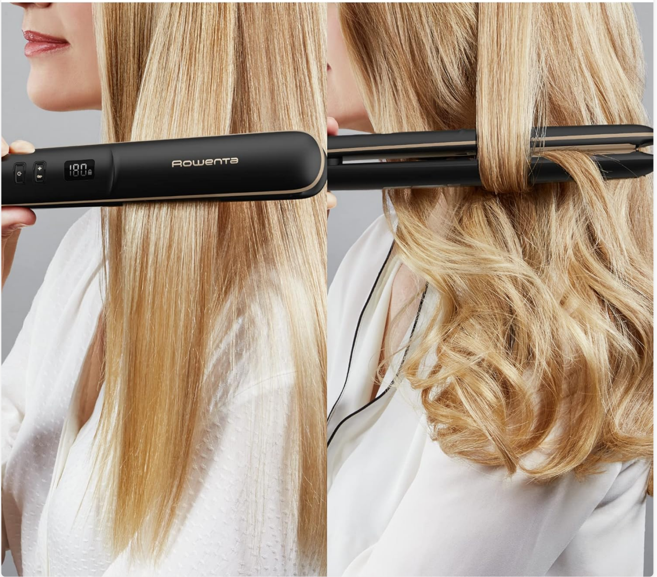
Image: Demonstrating the versatile styling capabilities, showing both hair straightening and curling techniques using the appliance.