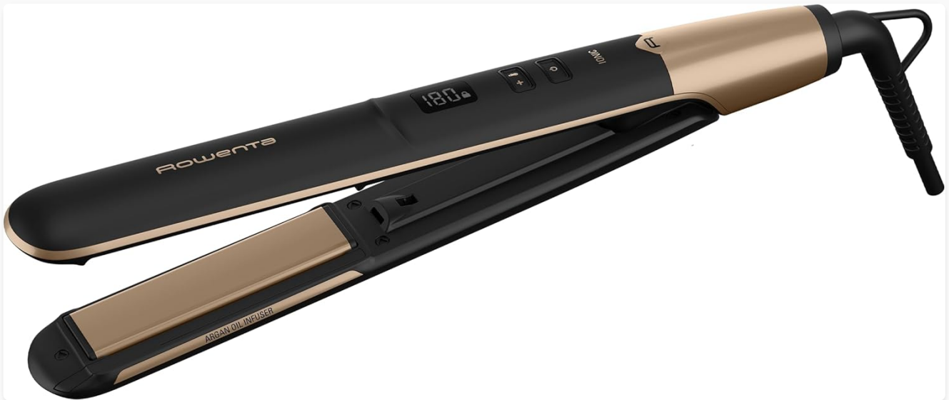
Image: The Rowenta SF4630 Express Shine Hair Straightener, showcasing its sleek black and gold design with the ceramic plates open.