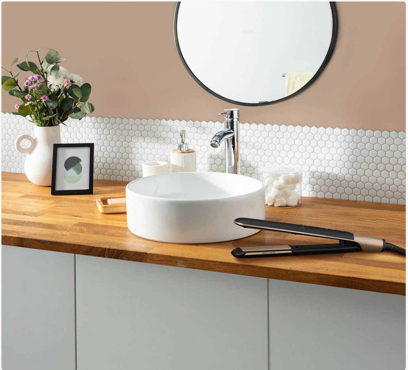
Image: The Rowenta SF4630 straightener placed on a bathroom counter, illustrating a typical storage scenario after use.