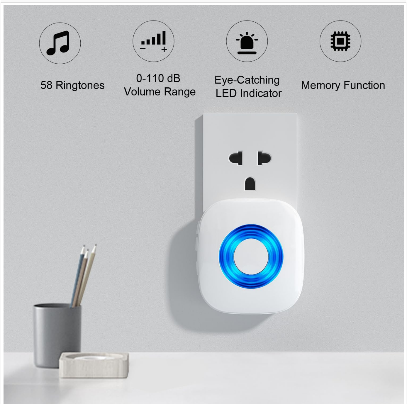
Image: The PHYSEN receiver showing its control buttons for volume and ringtone selection.