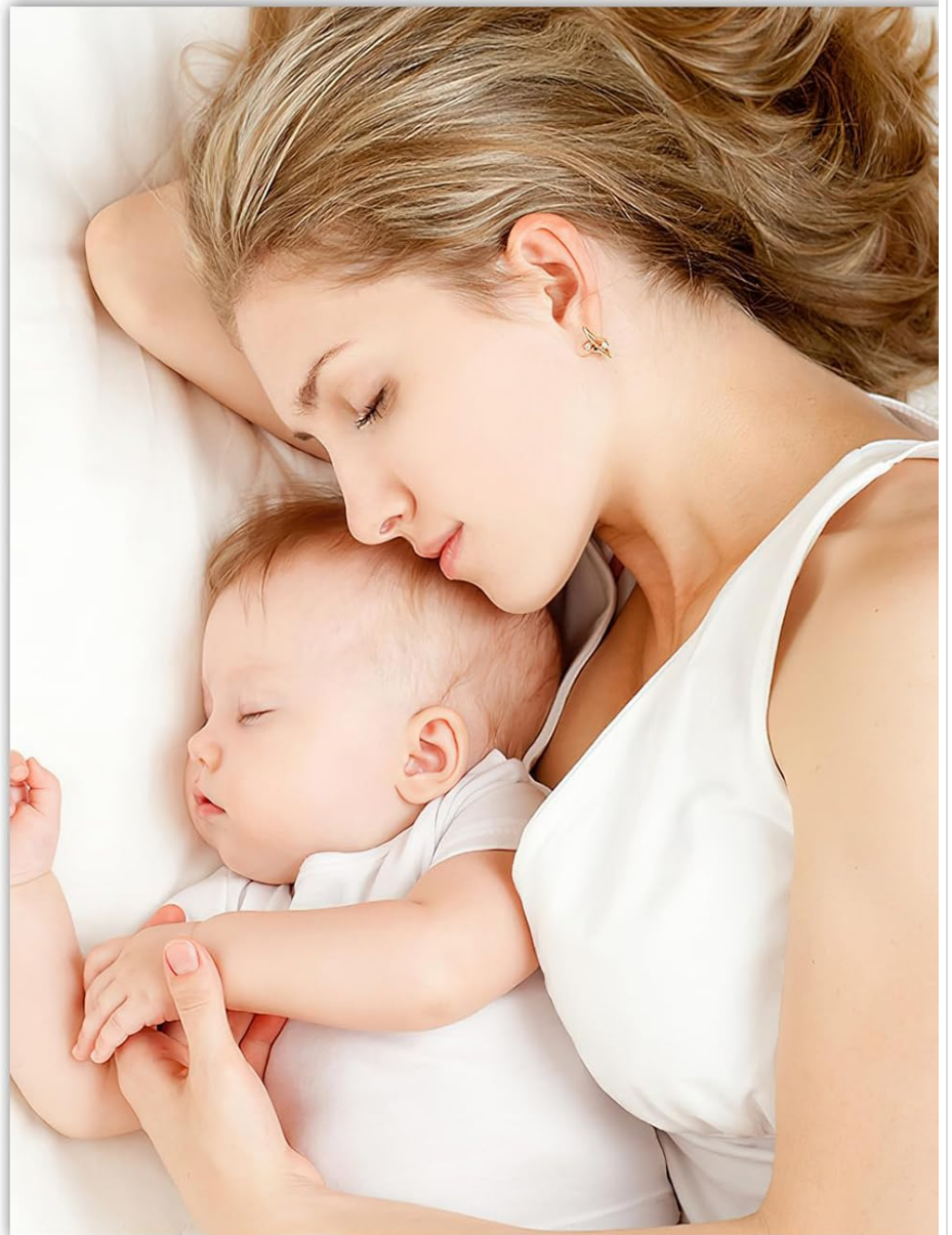
Image: The mute mode feature of the receiver, ideal for environments where sound is undesirable, such as near a sleeping baby.