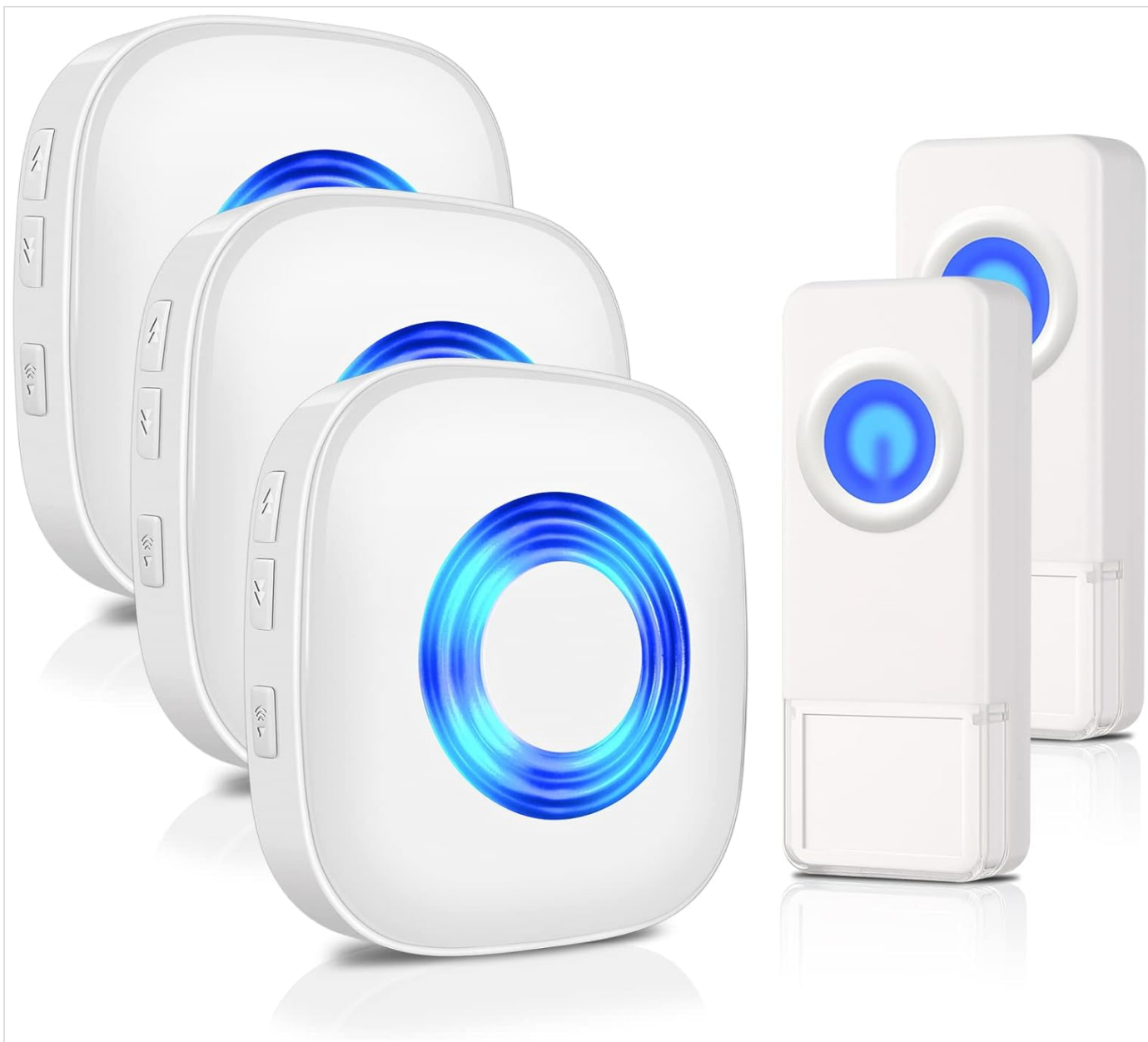
Image: All components of the PHYSEN Wireless Doorbell Kit, including two push buttons and three plug-in receivers.