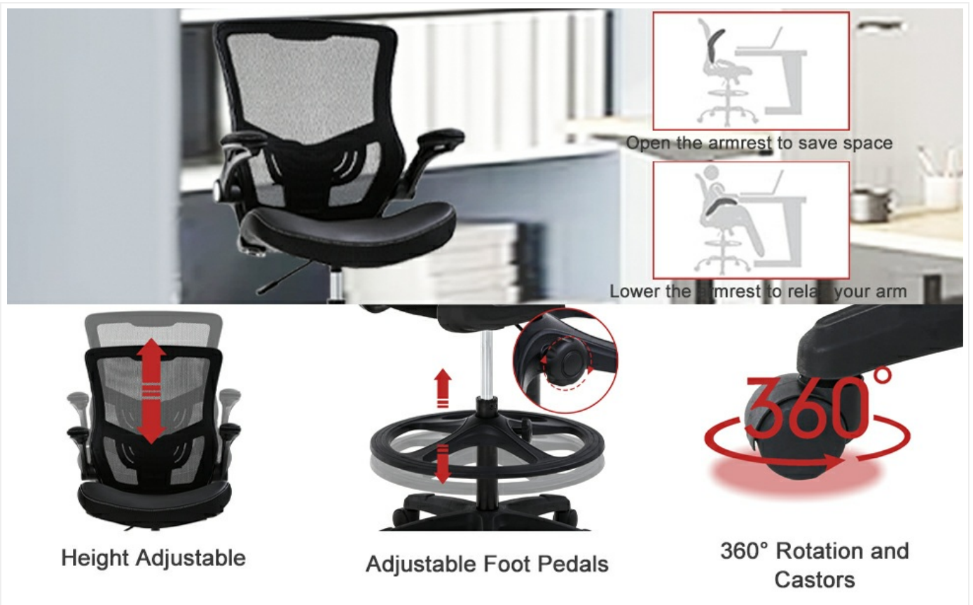
Figure 2: Demonstrates the chair's adjustable features including height, foot ring, and 360-degree swivel.