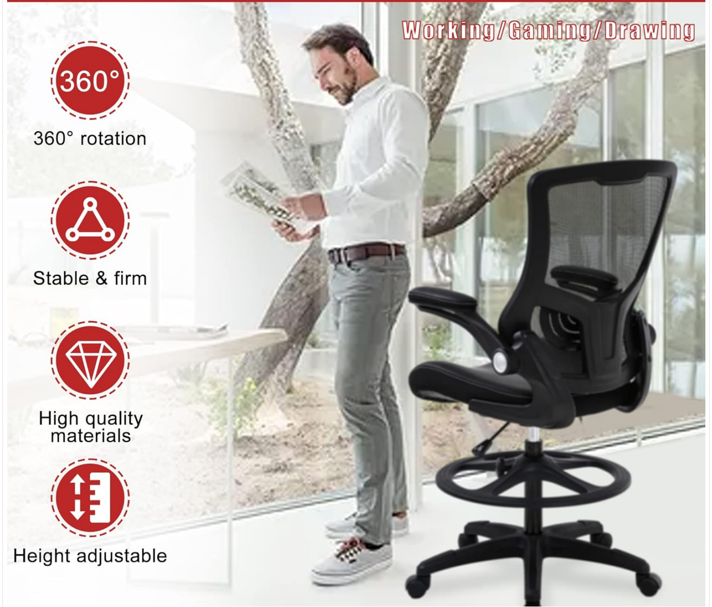
Figure 3: Illustrates the flip-up armrest feature, allowing for space-saving and closer desk access.