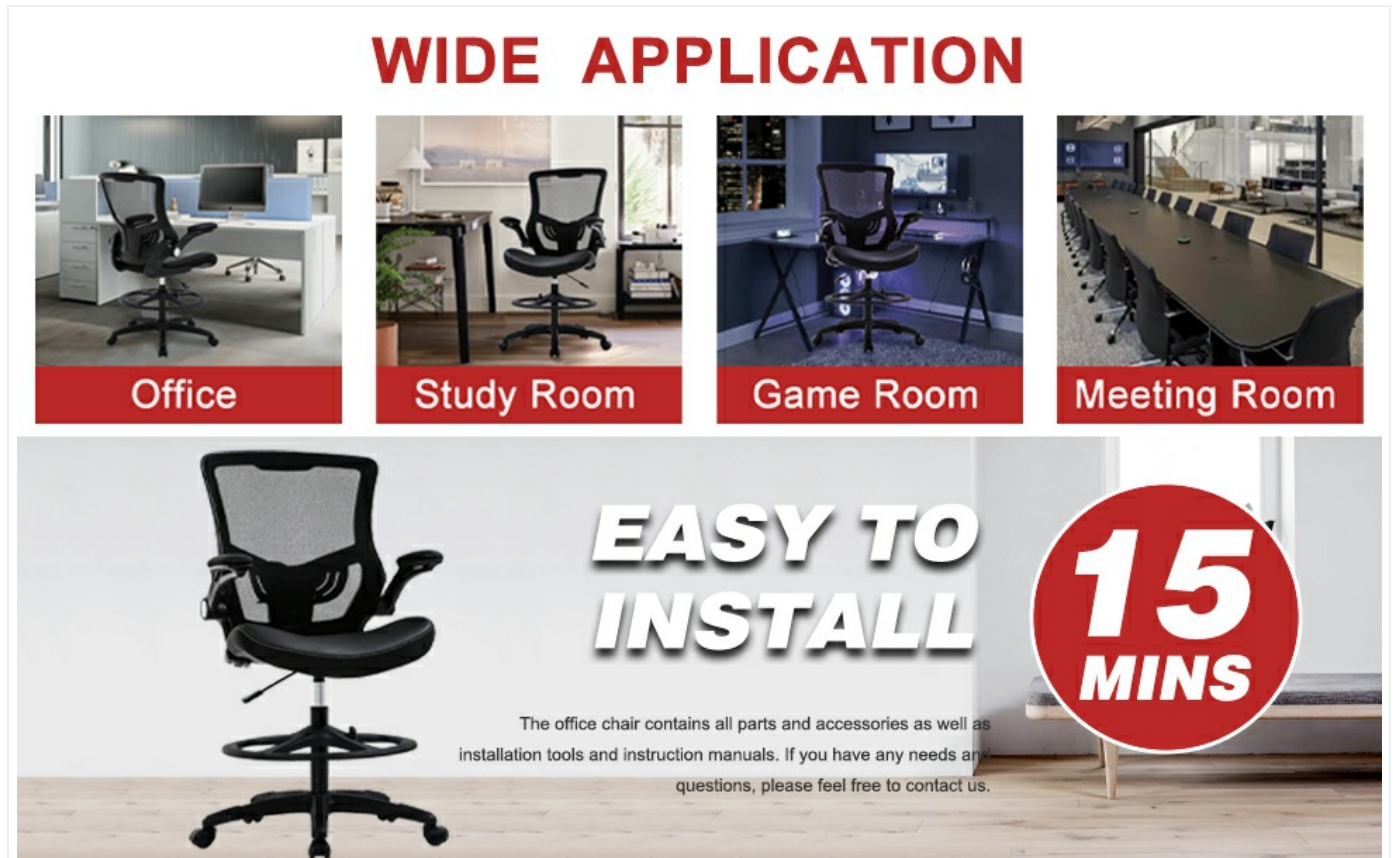
Figure 1: Visual representation of the chair's easy assembly process, indicating an approximate 15-minute setup time.

After assembly, test all adjustments and ensure the chair is stable before use.