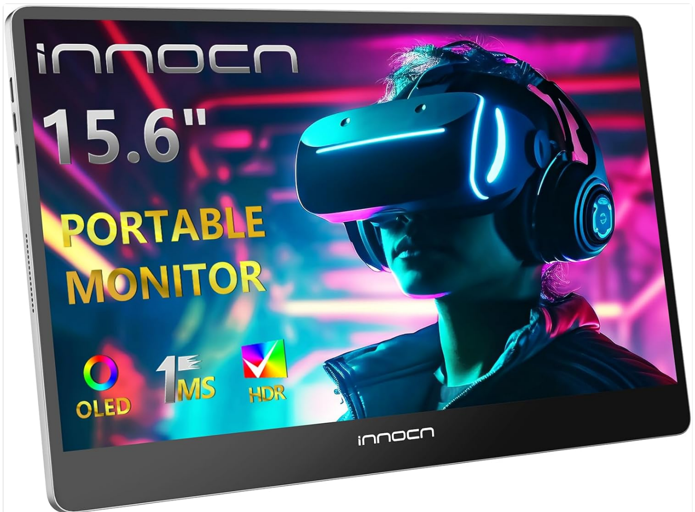
Figure 1: INNOCN 15.6 inch Portable OLED Monitor 15A1F.