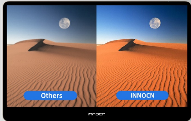
Figure 5: HDR mode offering enhanced viewing experience.