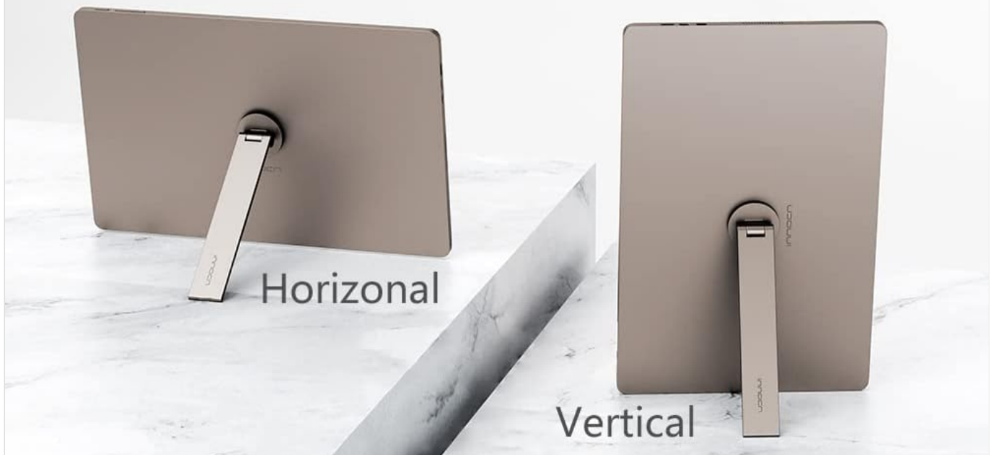
Figure 3: Detachable magnetic stand for flexible monitor positioning.