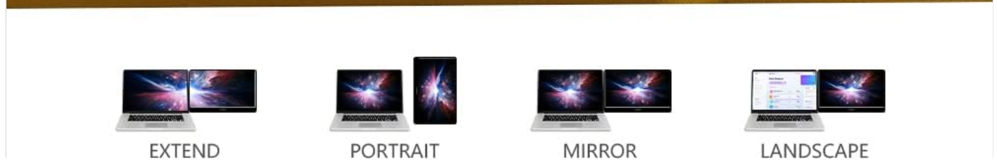
Figure 4: Various multi-using modes supported by the monitor.