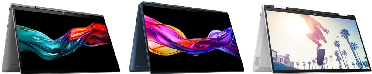
Image: A list of compatible HP Envy x360, Spectre x360, and Pavilion x360 laptop models for the HP Digital Stylus Pen, alongside images of three different HP 2-in-1 laptops.

Please check compatibility before purchasing