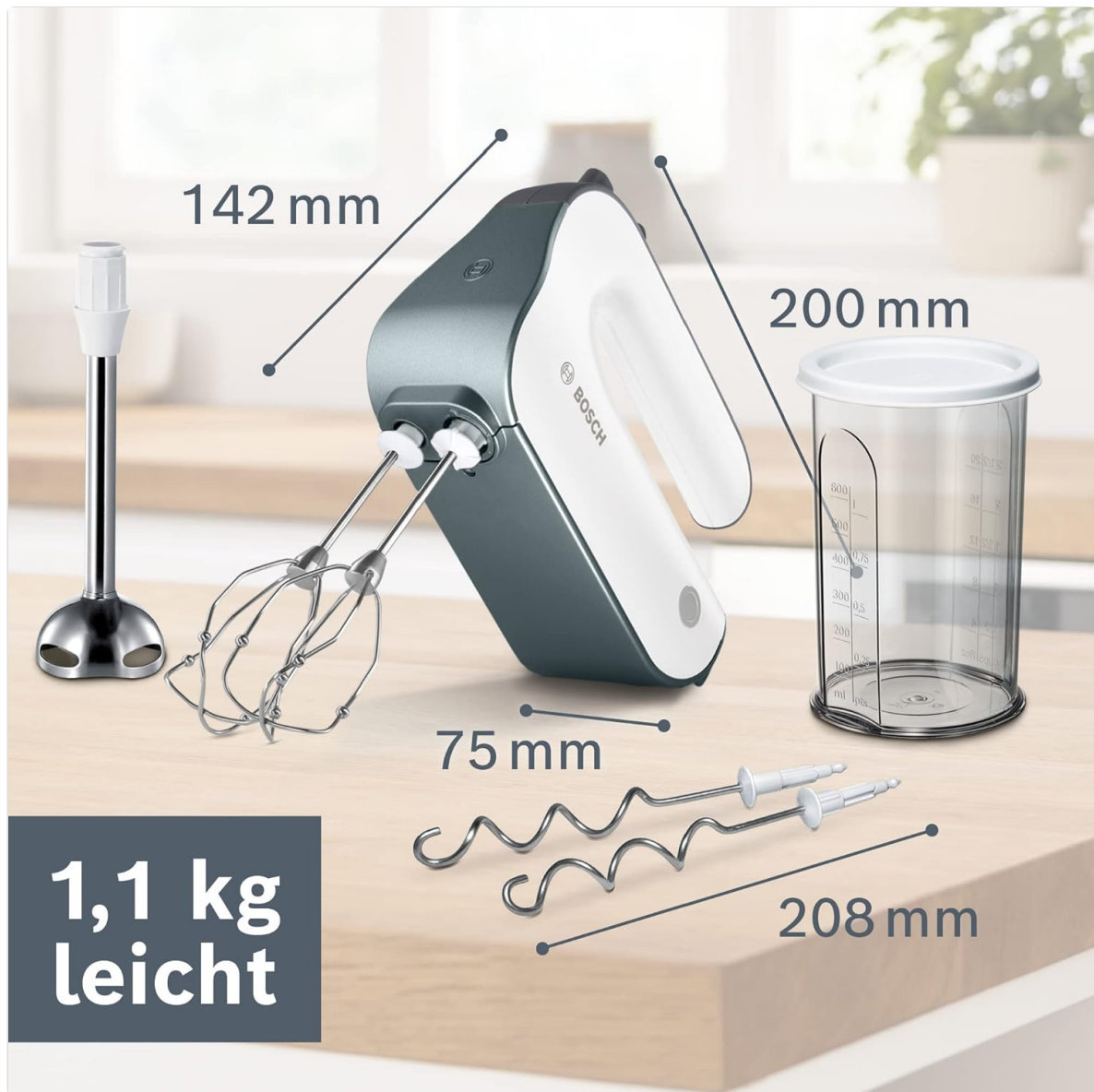
Image: Bosch Styline MFQ49700 Hand Mixer with all included accessories: whisks, kneading hooks, immersion blender foot, and mixing cup. The image also shows product dimensions for the mixer and attachments.