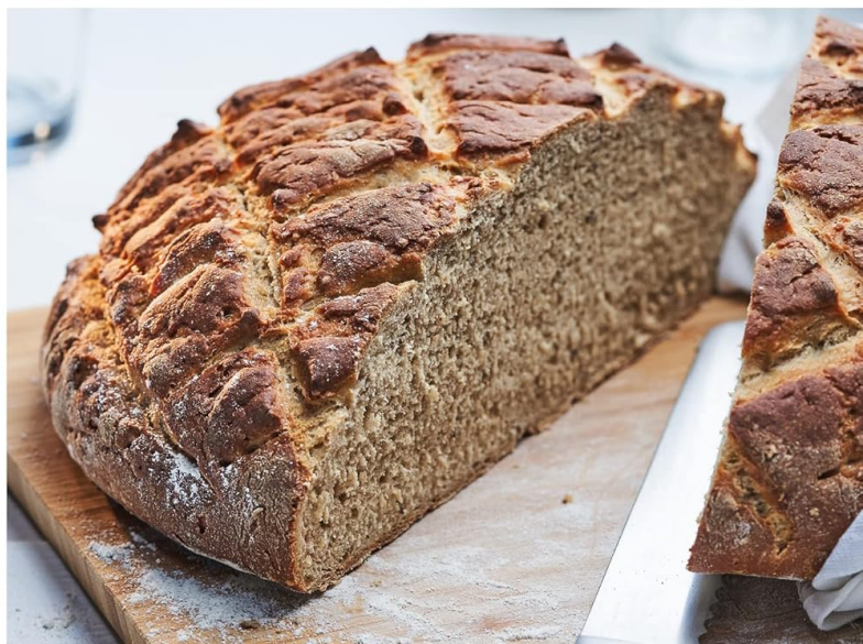
Image: Comparison of FineCreamer whisks and kneading hooks, showing their applications for light batters/creams and heavy doughs respectively. The image shows whipped cream cupcakes and a loaf of bread.