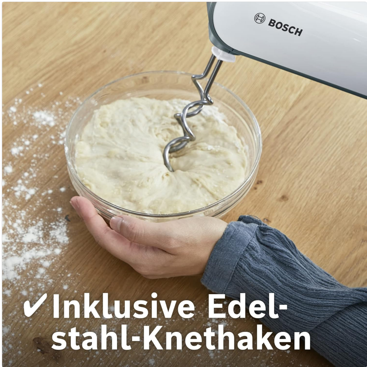
Image: Bosch Styline MFQ49700 hand mixer with stainless steel kneading hooks mixing dough in a clear bowl. The text on the image indicates 'Including stainless steel kneading hooks'.