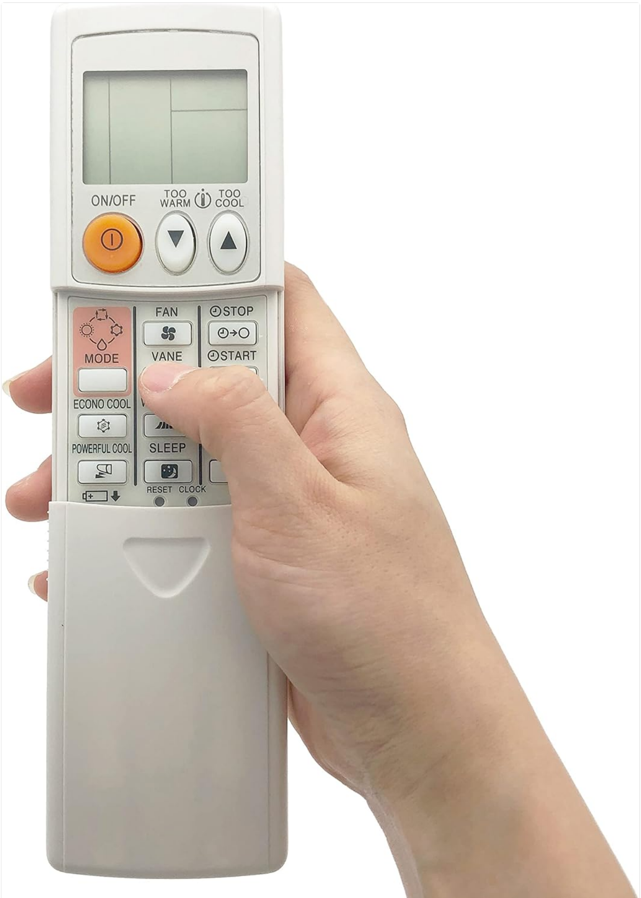
Figure 2.6: A hand holding the remote control, demonstrating the accessibility of the hidden function buttons when the lower panel is open.