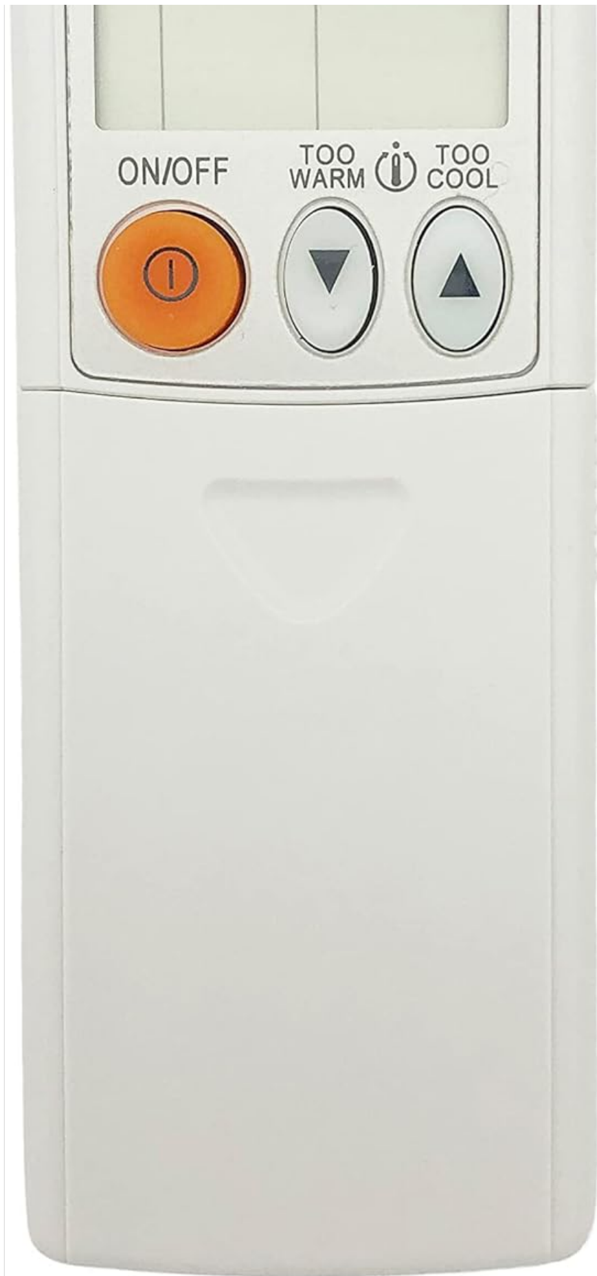
Figure 2.1: Front view of the remote control, showing the display and primary buttons including ON/OFF and temperature adjustments.