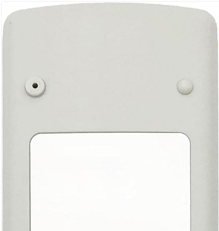
Figure 2.4: Side profile of the remote control, illustrating how the battery cover slides open to access the battery compartment.

To change the battery, please slide the remote control cover, then pull out the cover use a little effort.