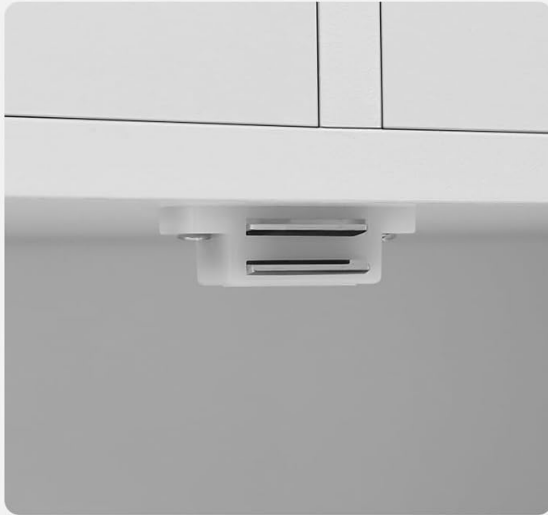
Door Magnetic Holder