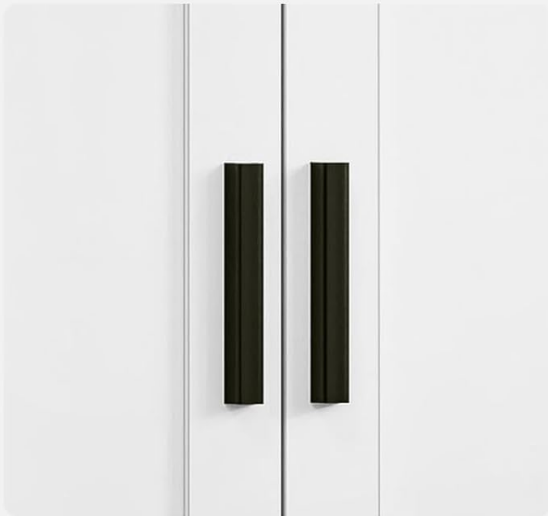
Solid Wood Handles