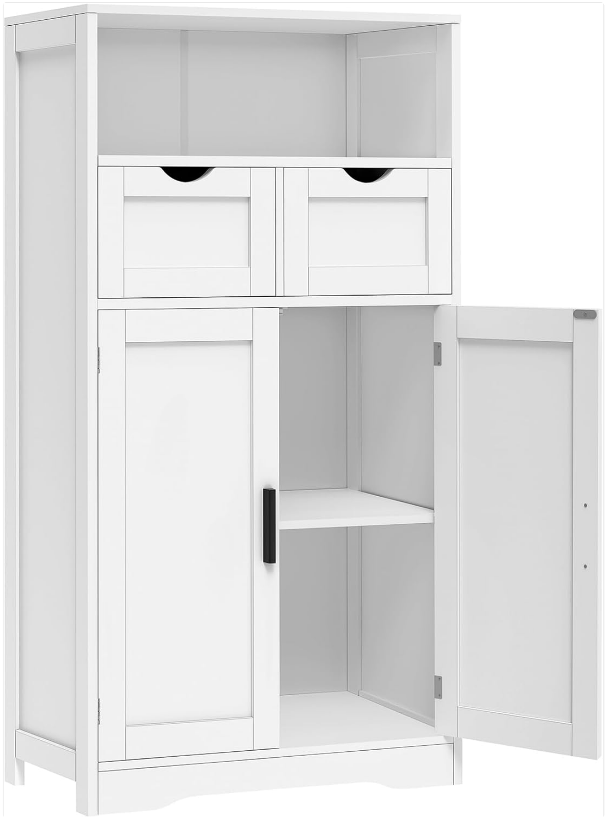
Front view of the Iwell Freestanding Storage Cabinet, showcasing its two doors, two drawers, and an adjustable interior shelf.