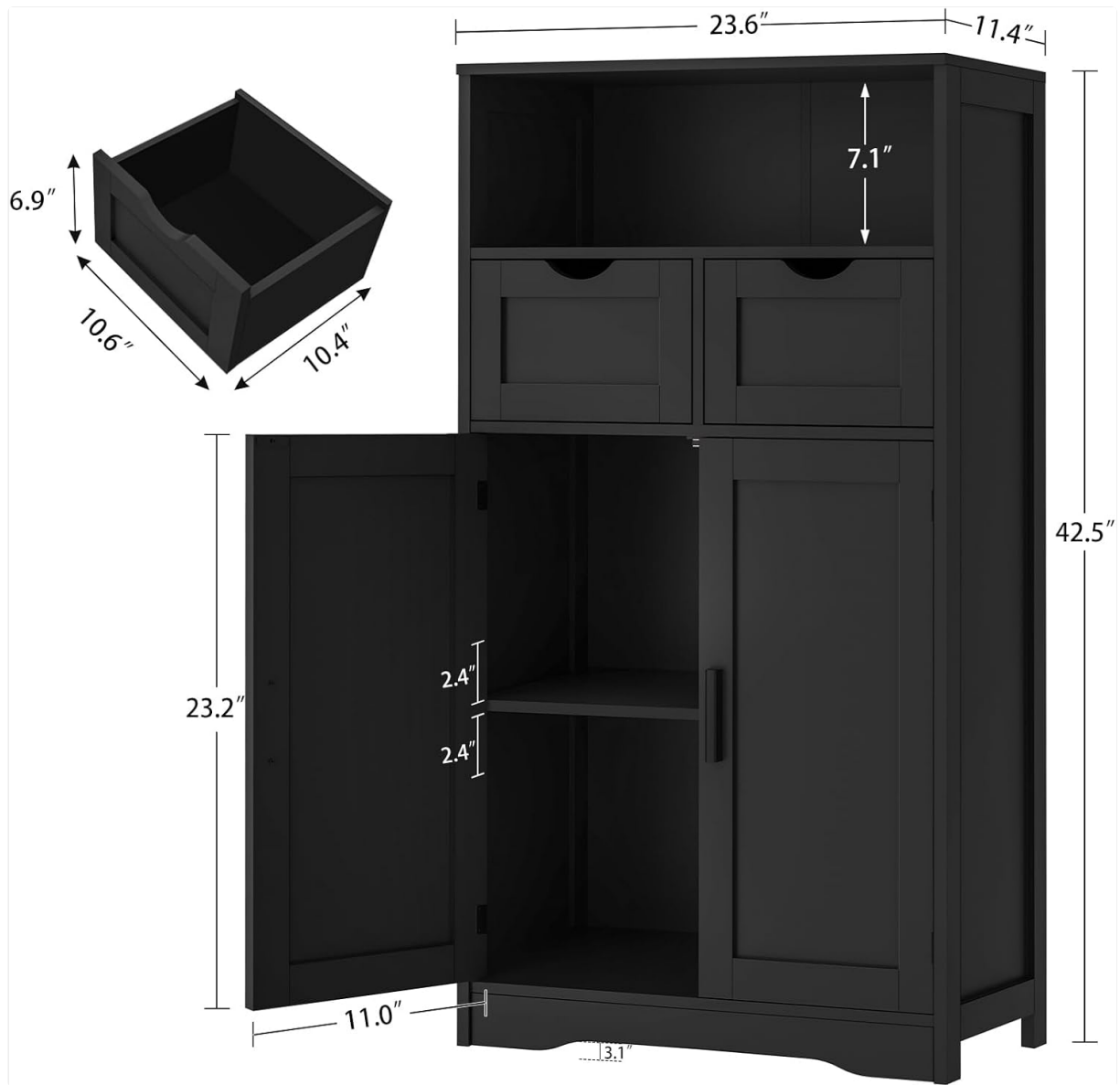
Figure 5: Product Dimensions