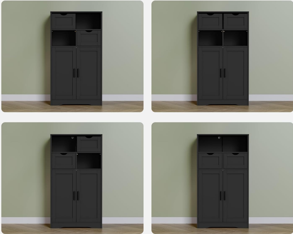
Figure 3: Internal Storage Features

You can change the position of the drawer according to you different needs