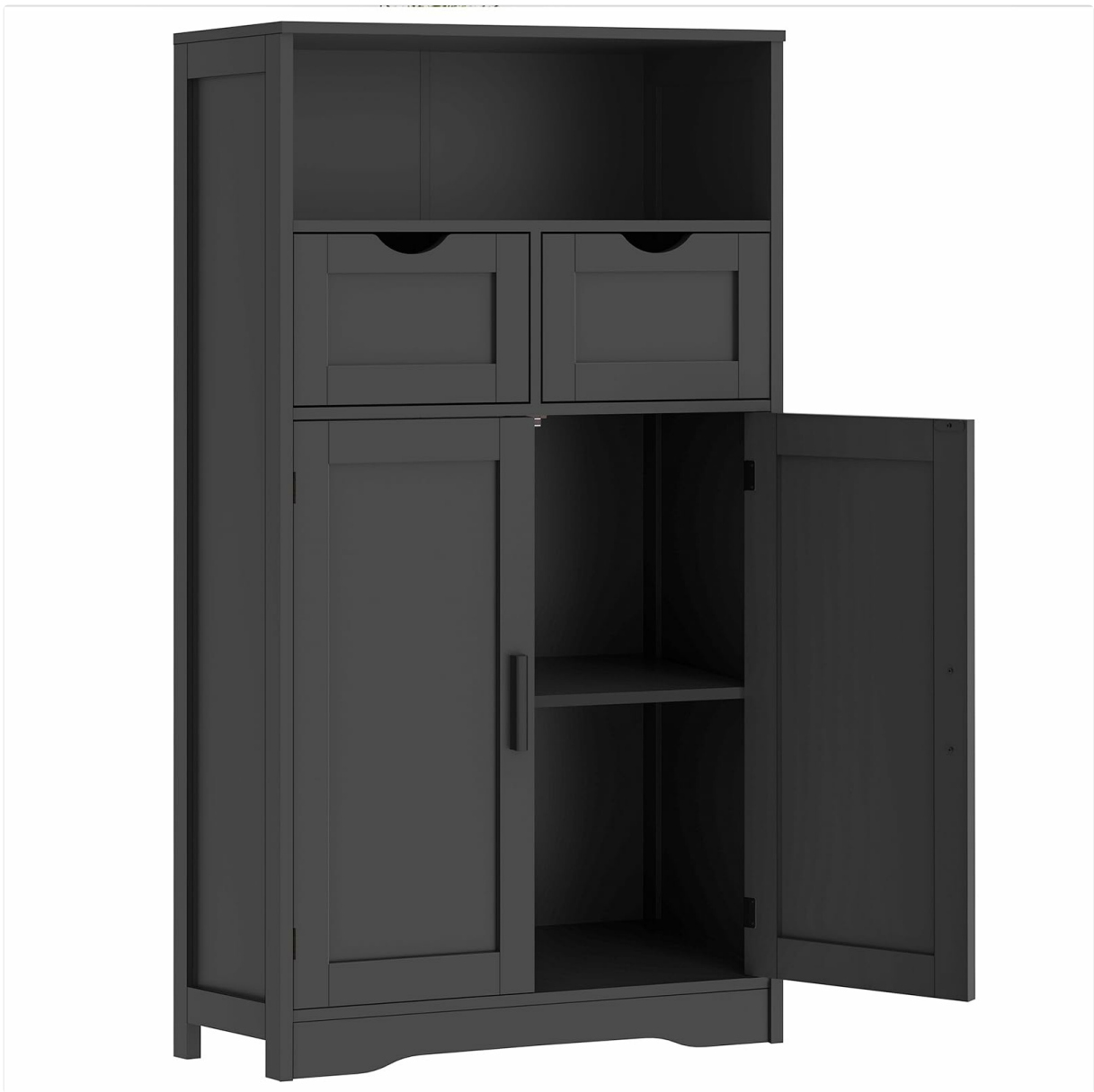
Figure 1: Assembled Iwell Storage Cabinet (Black)