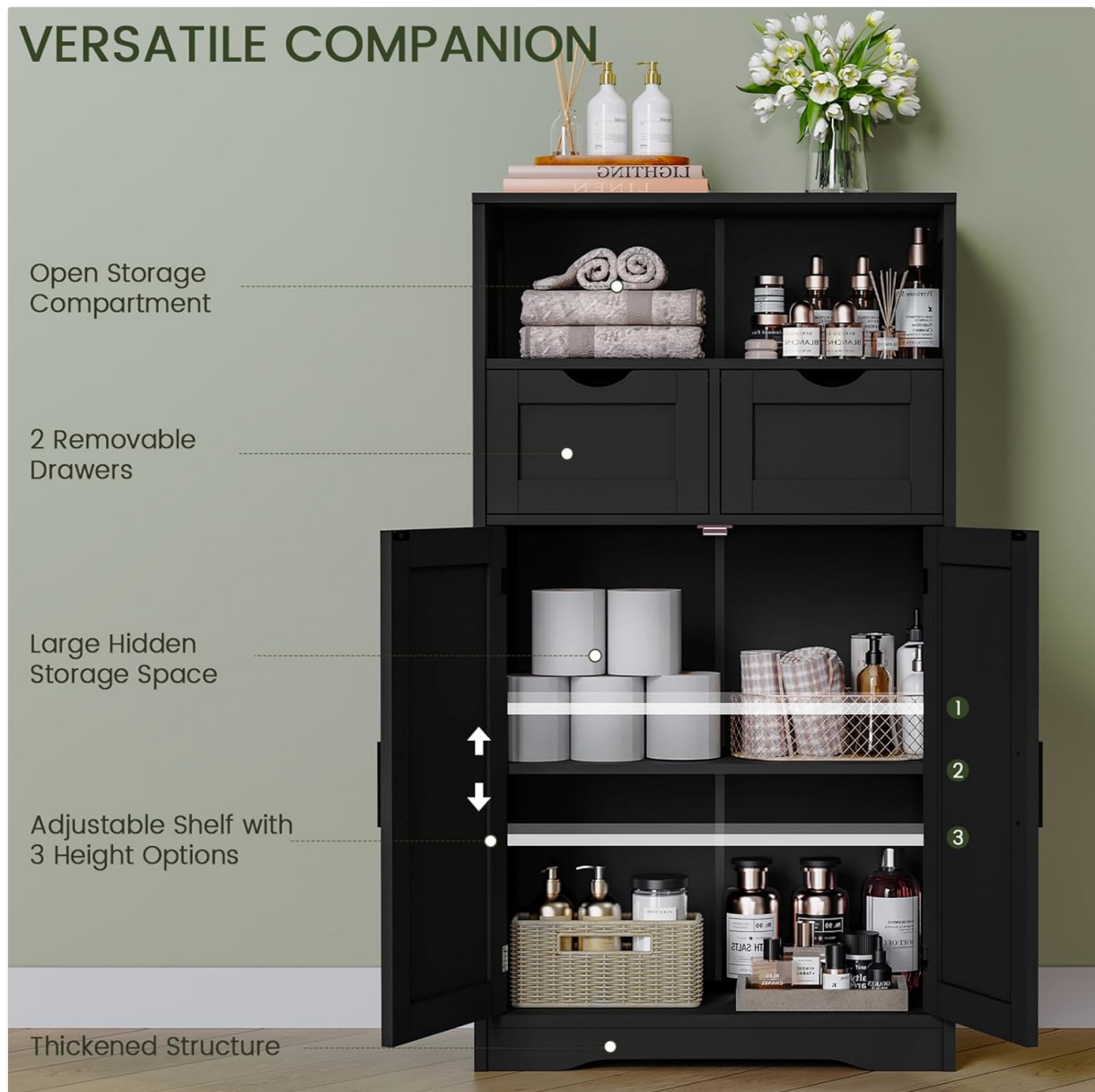
Figure 4: Cabinet in a Kitchen Environment