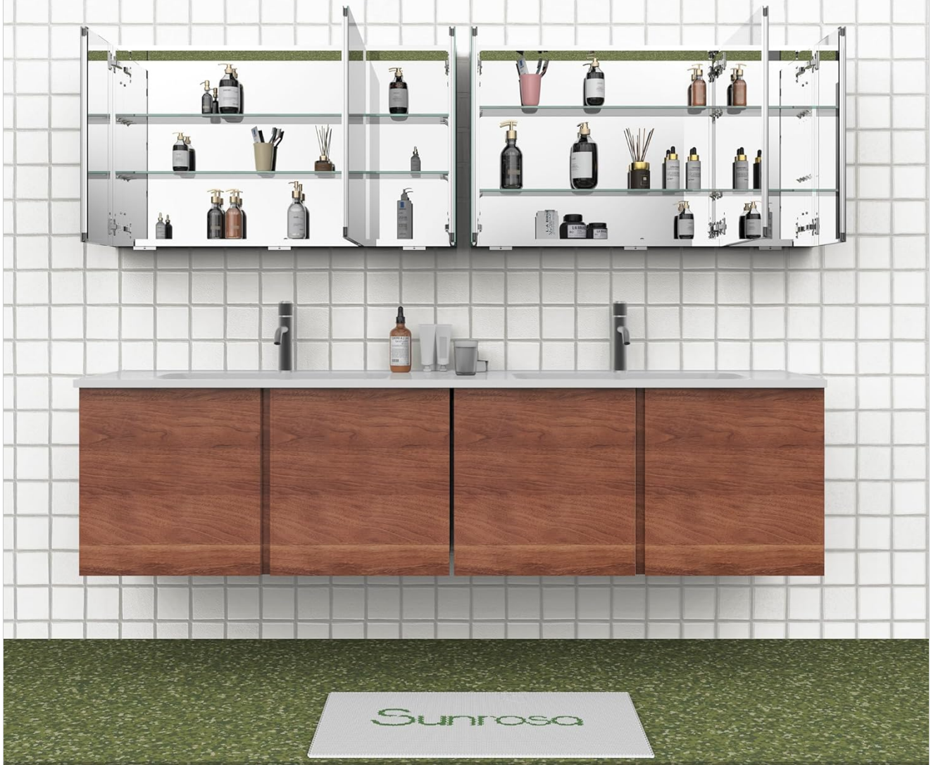
Image: Interior view of the medicine cabinet with doors open, showing adjustable shelves.