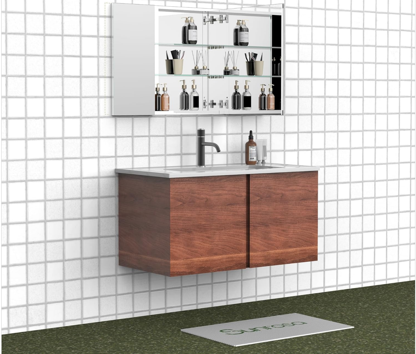
Image: Sunrosa medicine cabinet installed as a recessed mount above a bathroom vanity.