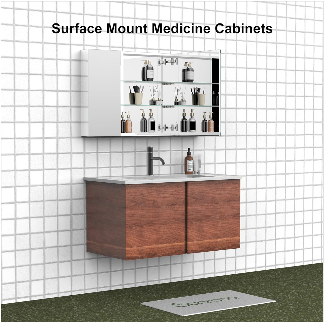
Image: Sunrosa medicine cabinet installed as a surface mount above a bathroom vanity.