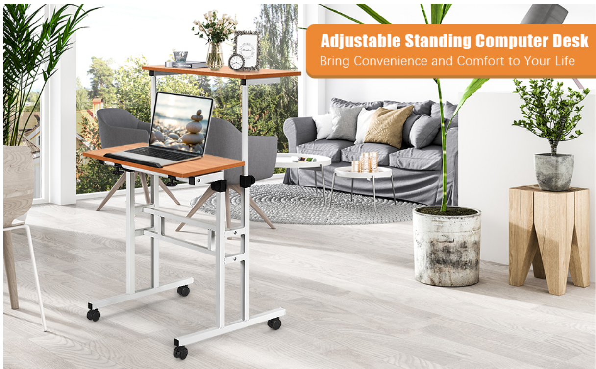
Image: The COSTWAY Mobile Standing Desk in a modern living room, showcasing its design and versatility.

Thank you for choosing the COSTWAY Mobile Standing Desk. This manual provides essential information for the safe assembly, operation, and maintenance of your new desk. Please read it thoroughly before use and retain it for future reference.