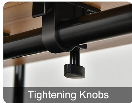
Image: A close-up view of the tilting desktop feature, highlighting the anti-skid strip and the tightening knobs for angle adjustment.