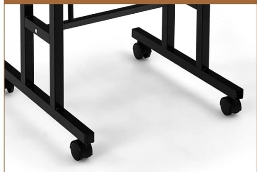
Image: Detailed view showing the anti-skid barrier strip on the desktop and the smooth, lockable casters for mobility and stability.