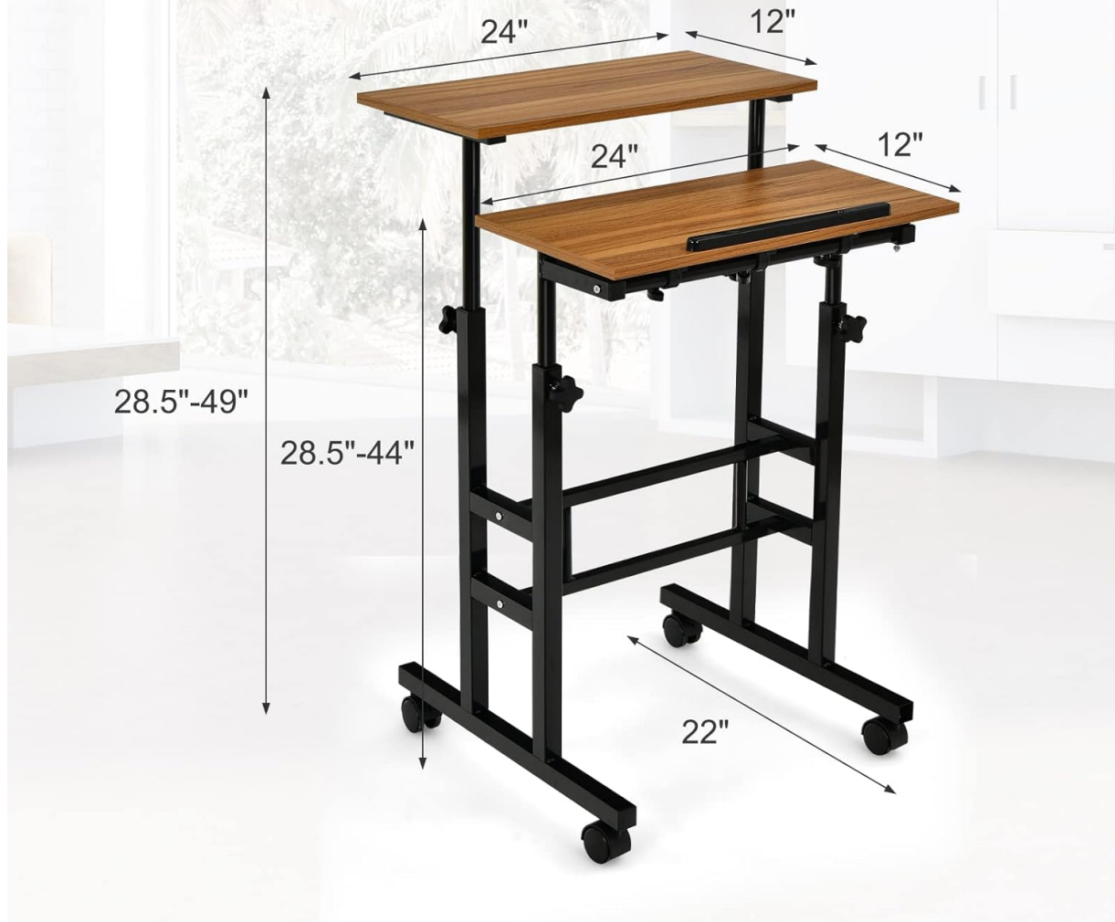
Image: A detailed diagram illustrating the overall dimensions and weight capacity of the COSTWAY Mobile Standing Desk.