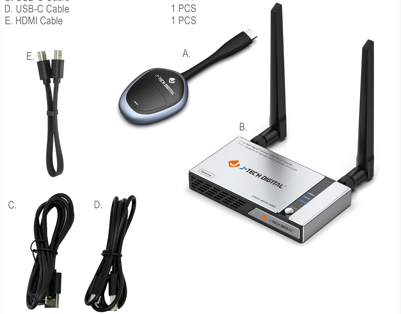
Figure 2: Package Contents