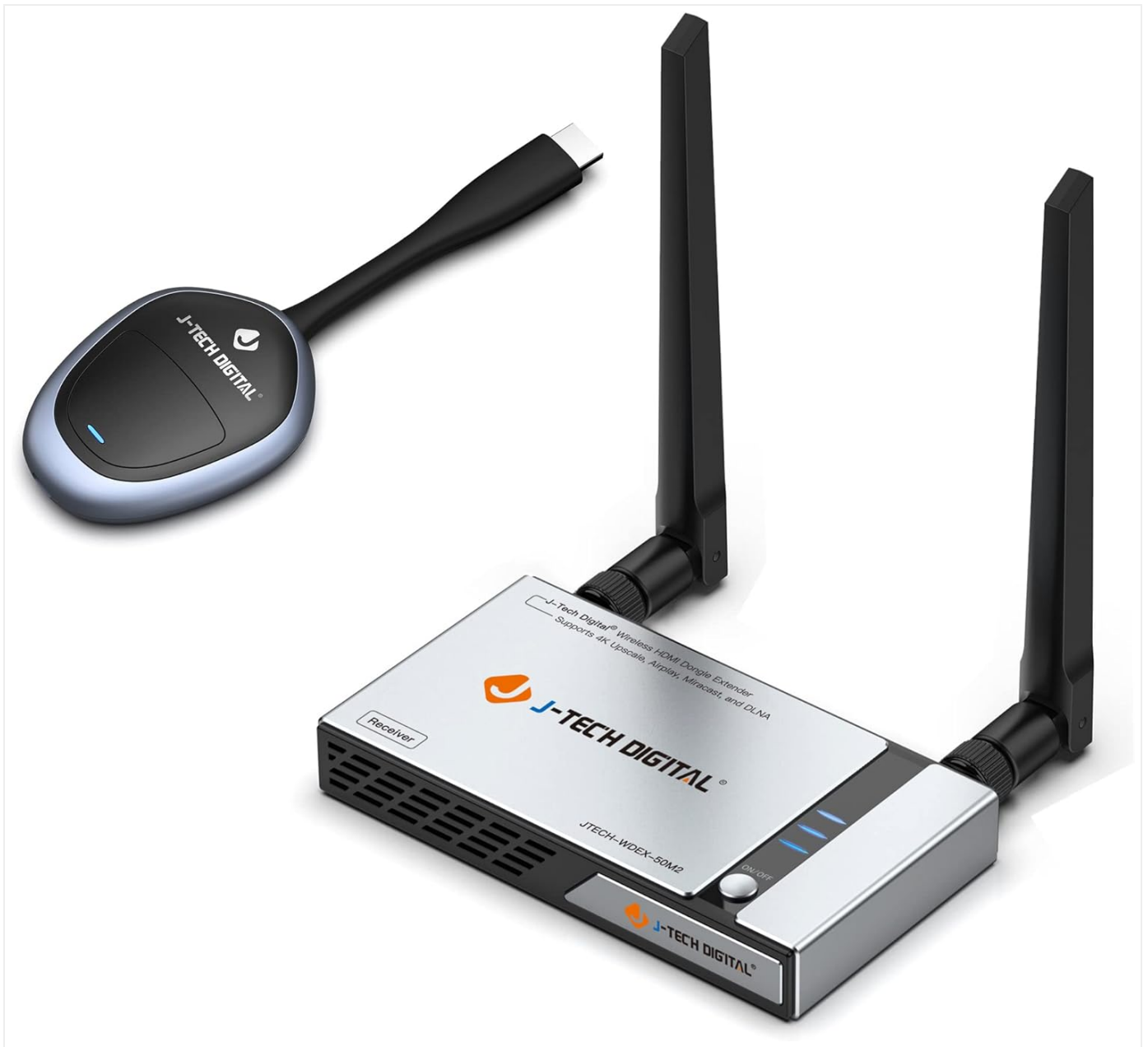
Figure 1: J-Tech Digital HDMI Wireless Extender Dongle Adapter Kit (JTECH-WDEX-50M2)