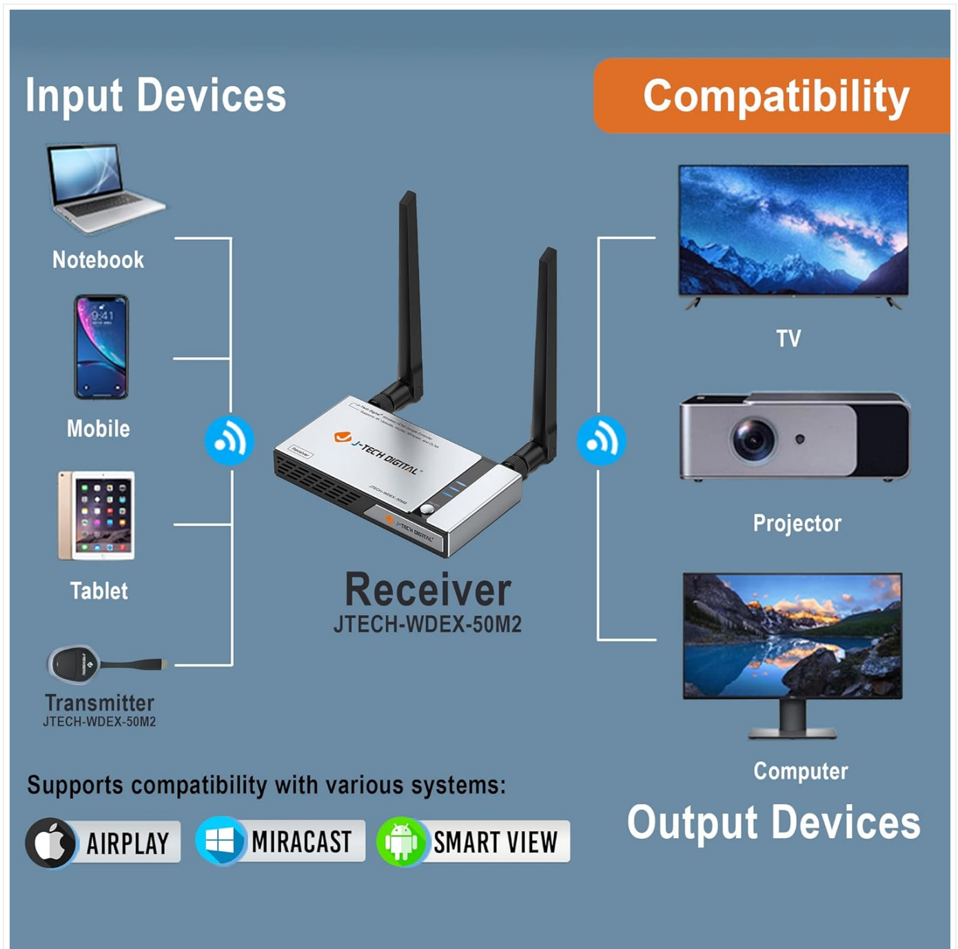
Figure 9: Device Compatibility Overview