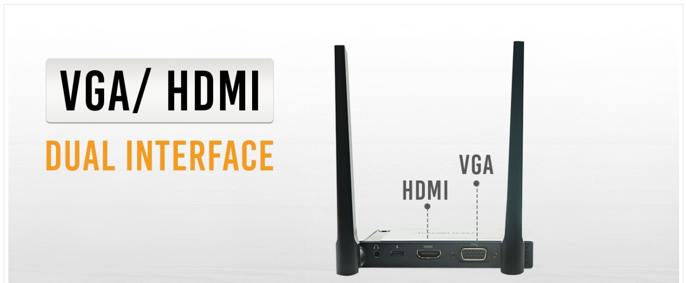
Figure 7: Wireless Streaming Options

To use these features, ensure your device is connected to the same network as the JTECH-WDEX-50M2 Receiver (if applicable, or follow on-screen instructions for direct connection) and select the appropriate mirroring option from your device's settings.