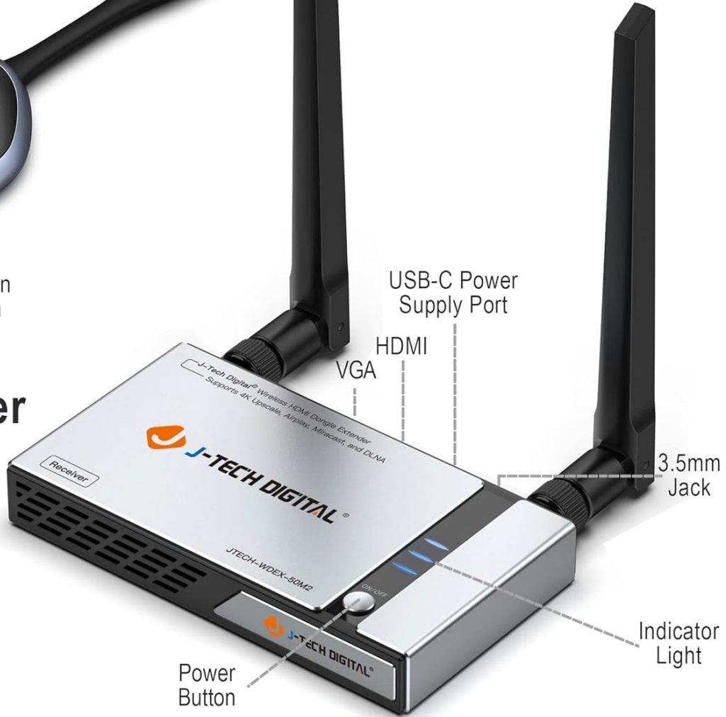
Figure 3: Receiver Unit Ports and Controls