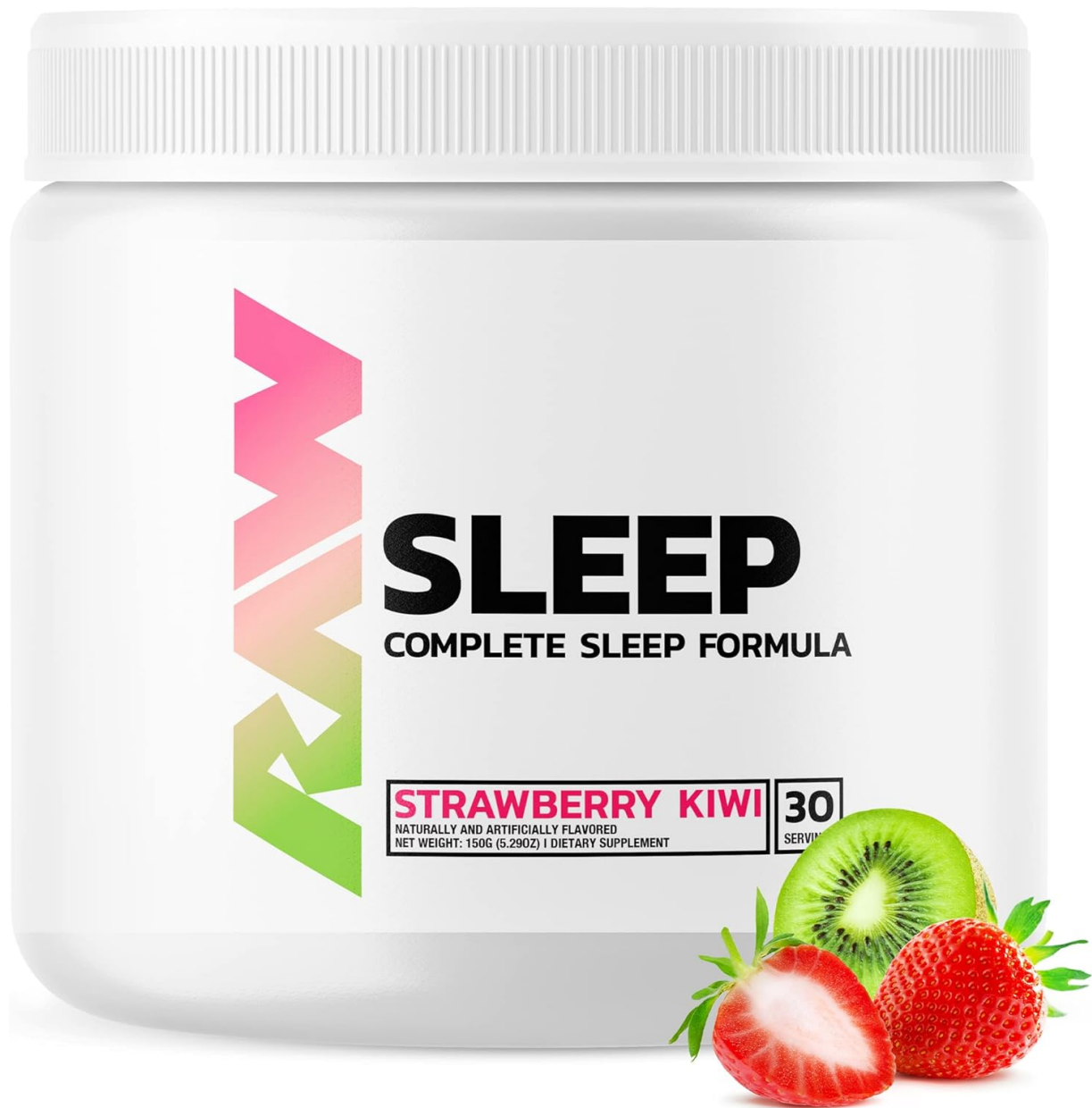
Image 1.1: RAW Sleep Natural Sleep Aid Supplement, Strawberry Kiwi.