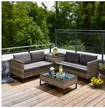
Image 4.1: The coffee table with its black safety glass top, a key component requiring careful placement during assembly.