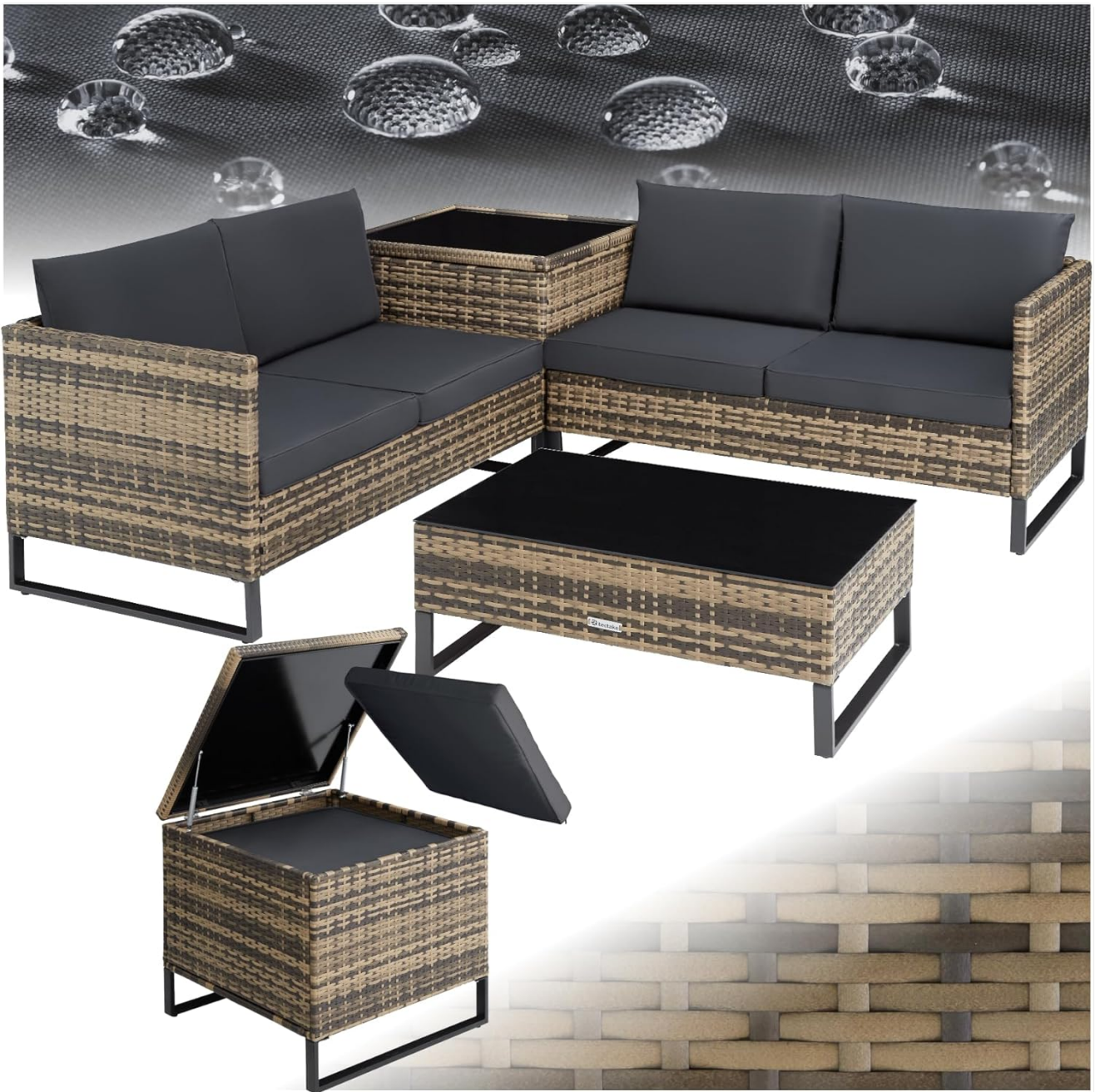
Image 1.1: The tectake Ostuni Rattan Garden Lounge Set, showcasing the two sofas, coffee table, and integrated storage box in an outdoor setting.