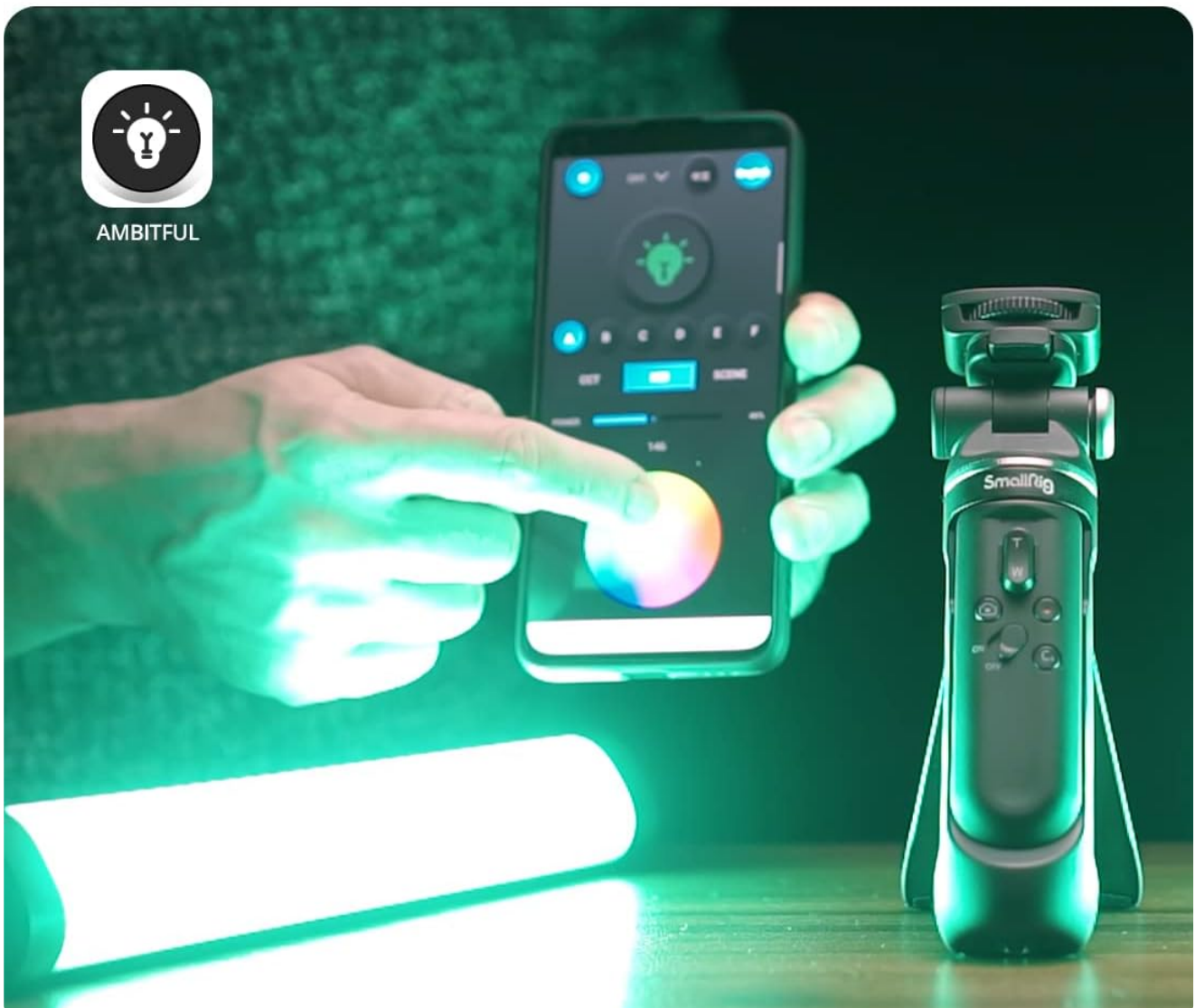
Figure 5: Control panel for manual adjustments.