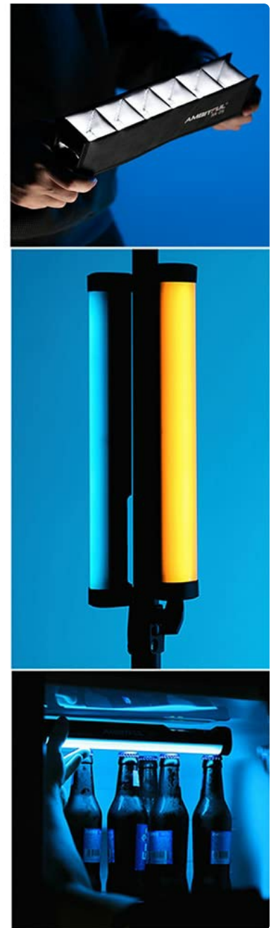
Figure 1: AMBITFUL A2 RGB Tube Light