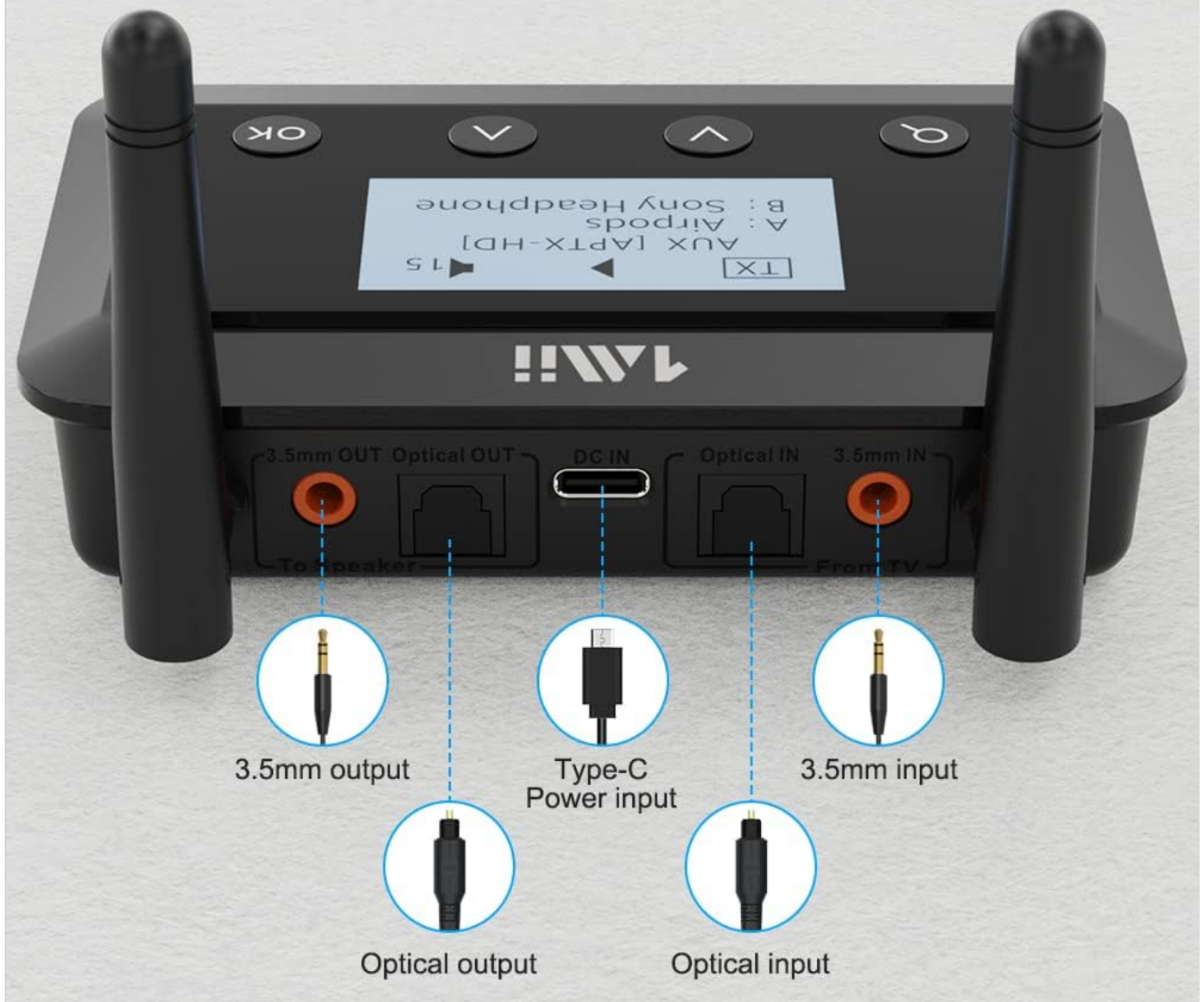
Image: Diagram showing the rear panel of the 1Mii B03+ with labeled ports: 3.5mm output, Optical output, Type-C Power input, Optical input, and 3.5mm input.