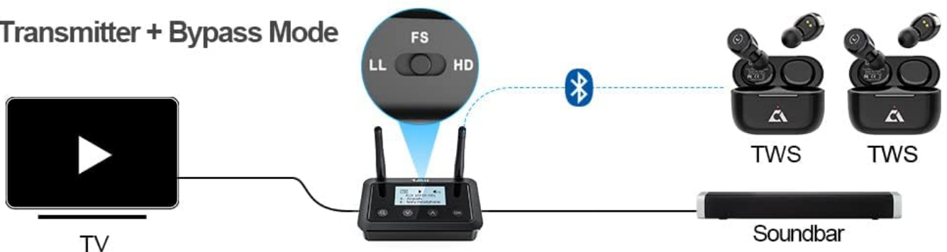
Image: A family watching TV, with some members using wireless earbuds and others listening through a soundbar, all connected via the 1Mii B03+ in Transmitter + Bypass Mode.