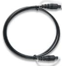
5 Optical Cable