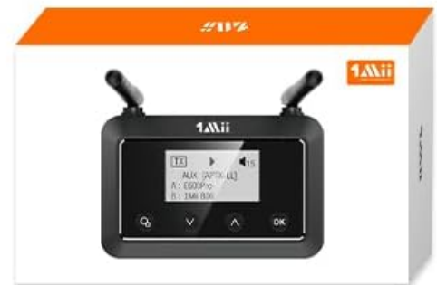
Image: Contents of the 1Mii B03+ package, including the adapter, power cable, RCA cable, 3.5mm audio cable, and optical cable.