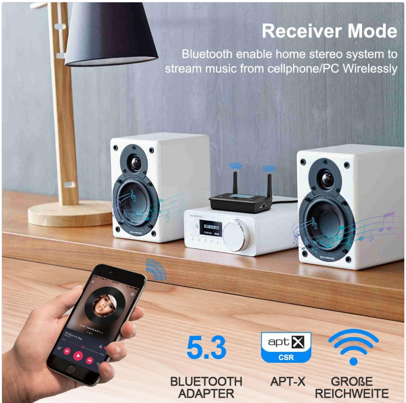
Image: A smartphone streaming music wirelessly to a home stereo system via the 1Mii B03+ in Receiver Mode. The device is placed on a desk next to two speakers.

Bluetooth enable home stereo system to stream music from cellphone/PC Wirelessly