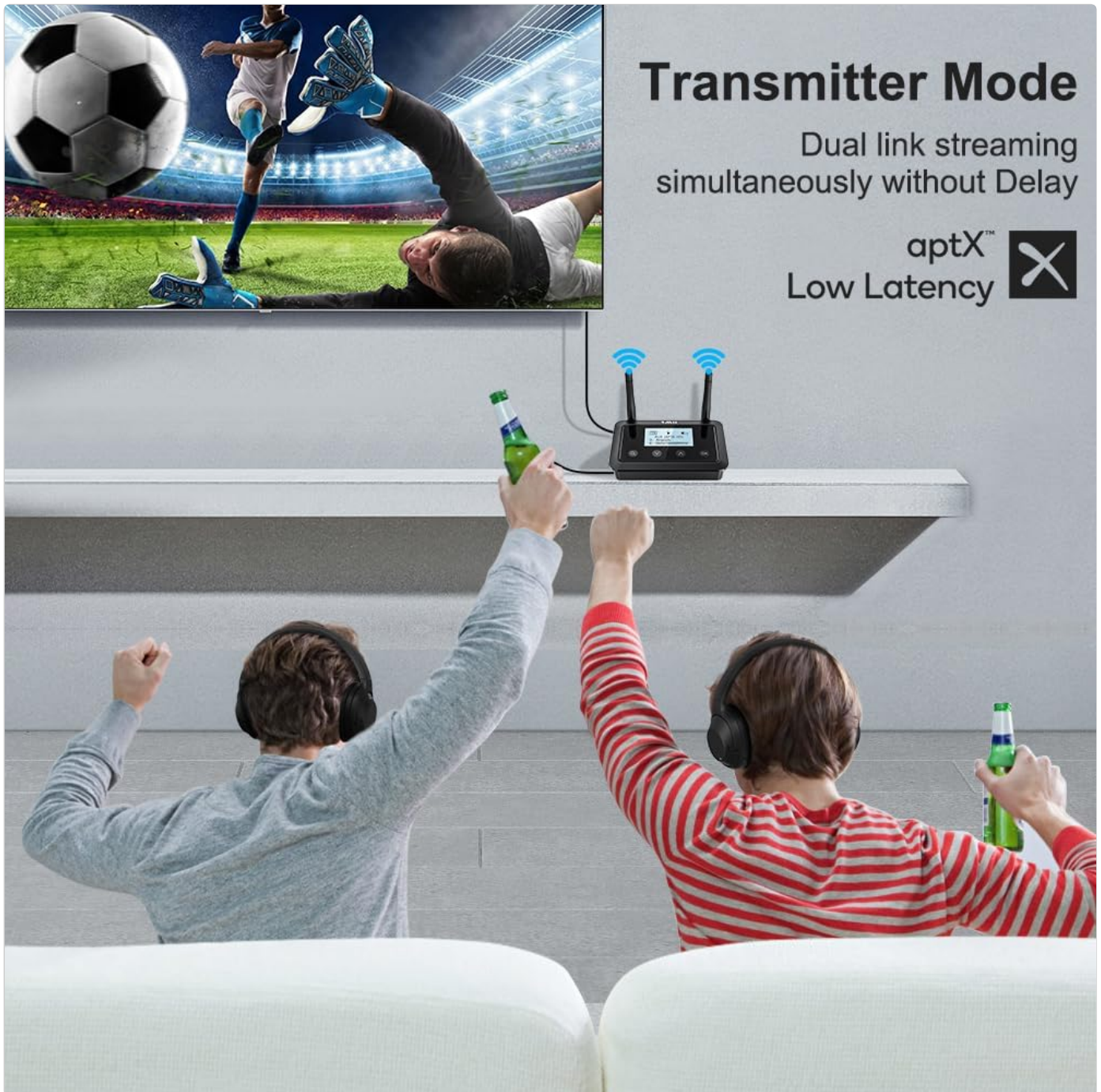
Image: Two individuals wearing headphones, enjoying audio from a TV wirelessly via the 1Mii B03+ in Transmitter Mode. The device is placed on a shelf below the TV.