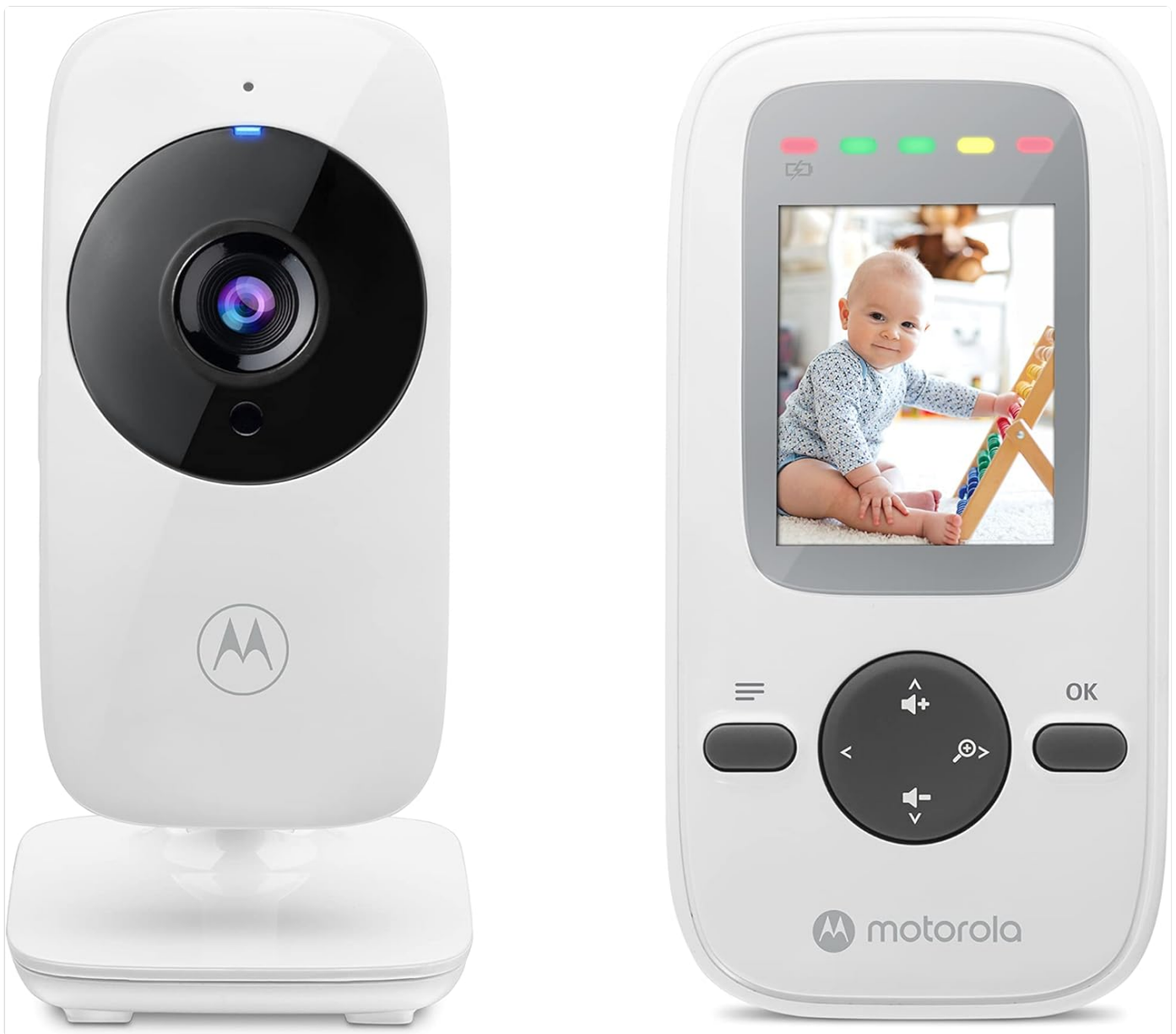
Image: The Motorola VM481 Video Baby Monitor, featuring the camera unit on the left and the parent unit with a 2-inch color screen on the right. The parent unit displays a live feed of a baby.