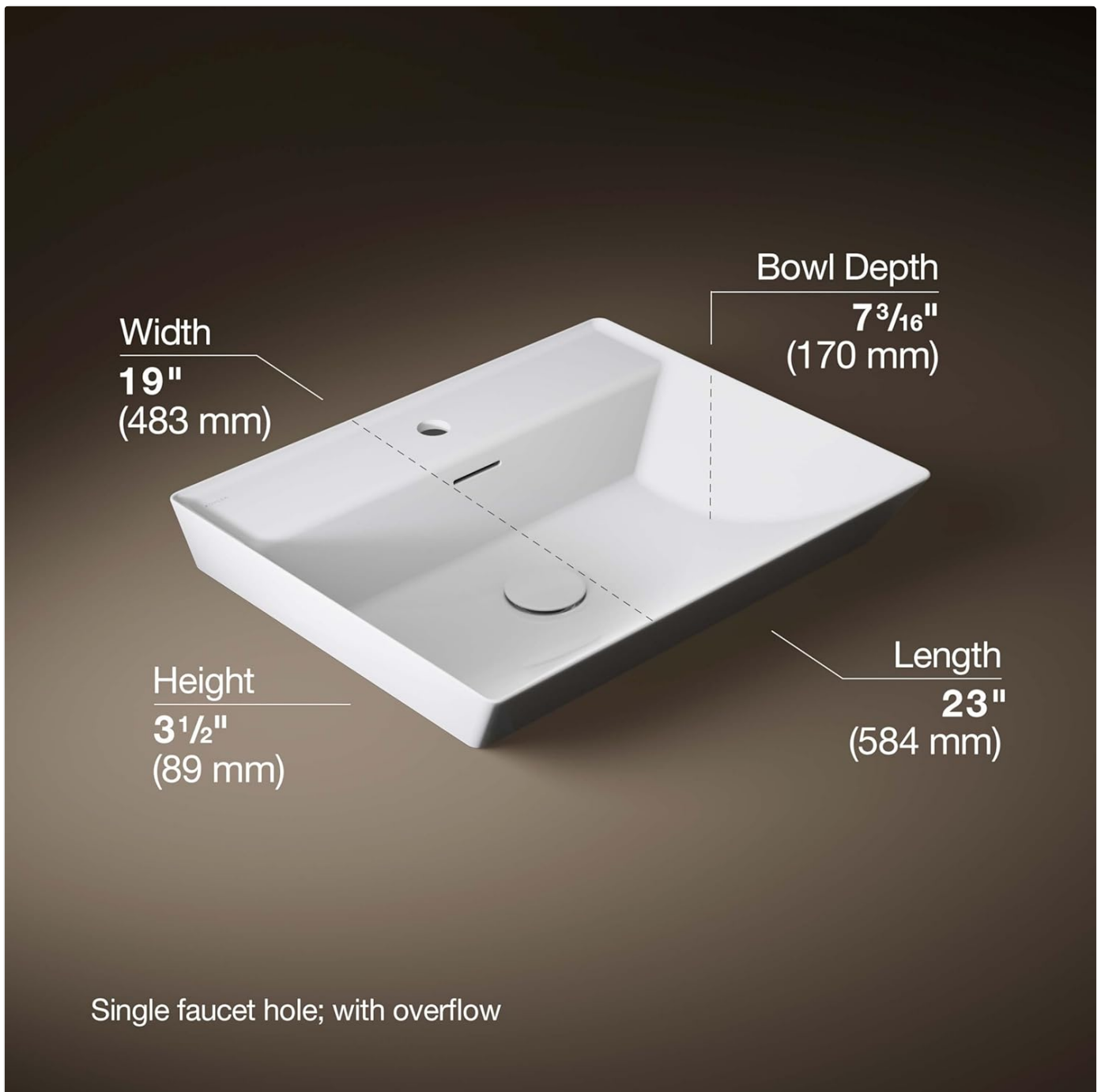
Image: Diagram illustrating the dimensions of the KOHLER Brazn sink, including width, height, and bowl depth, along with notes on the single faucet hole and overflow.