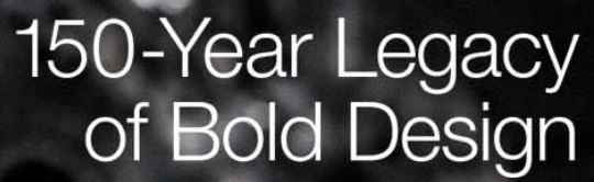
Image: A visual representation of KOHLER's 150-year legacy of bold design, emphasizing the brand's commitment to quality and innovation.