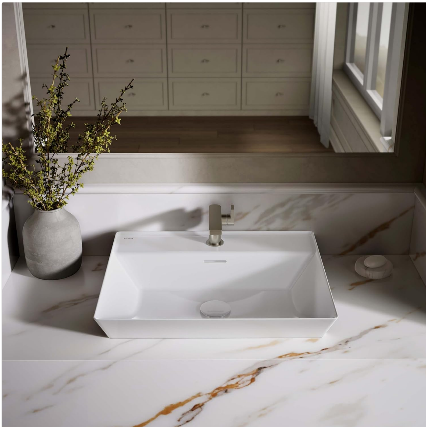
Image: An overhead view of the KOHLER Brazn sink installed in a bathroom, showing its rectangular form and faucet placement.