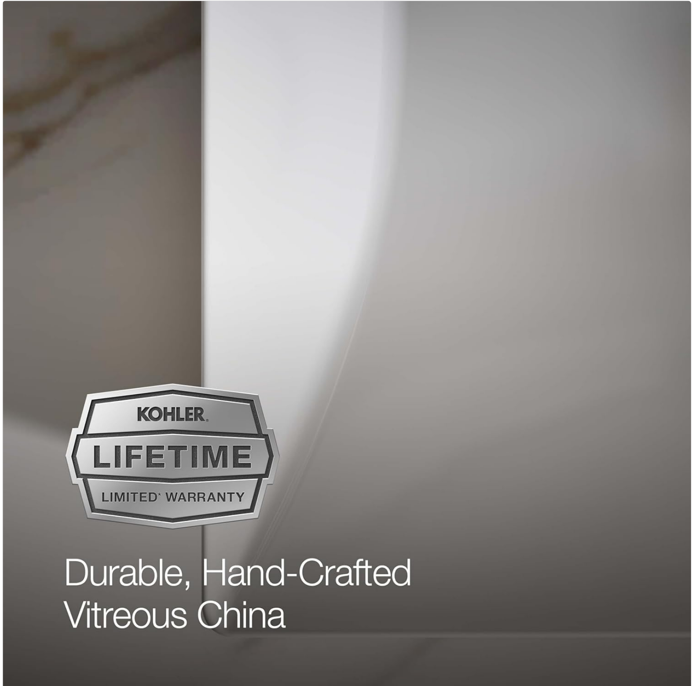
Image: A close-up showing the durable, hand-crafted vitreous china material of the sink, accompanied by the KOHLER Lifetime Limited Warranty emblem.