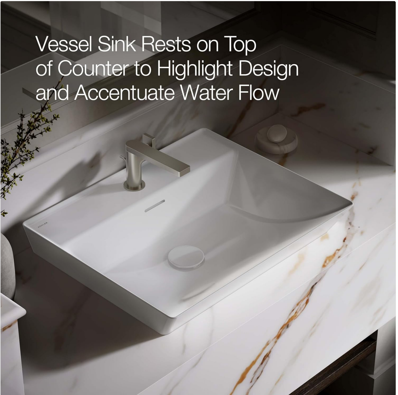
Image: The vessel sink resting on top of a counter, highlighting its design and how it accentuates water flow.