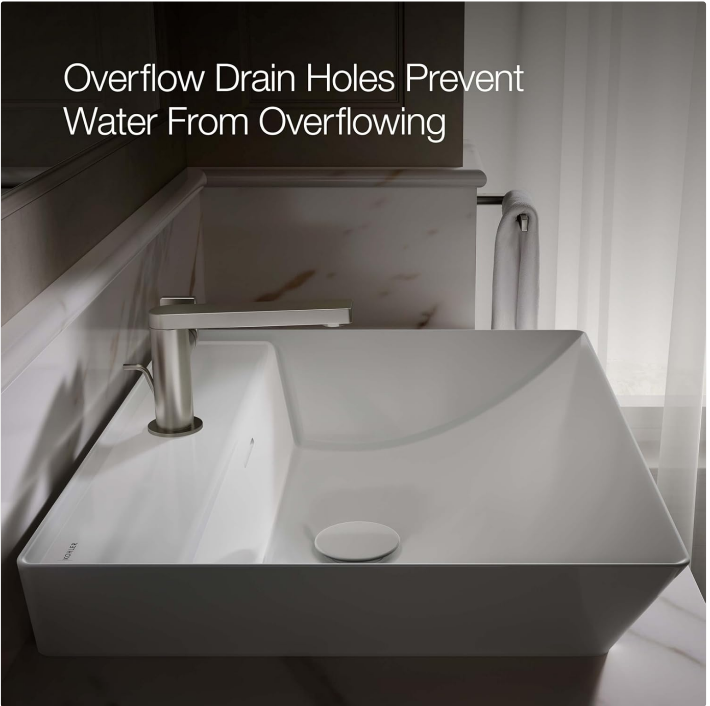
Image: A close-up view of the overflow drain holes, designed to prevent water from overflowing the sink basin.