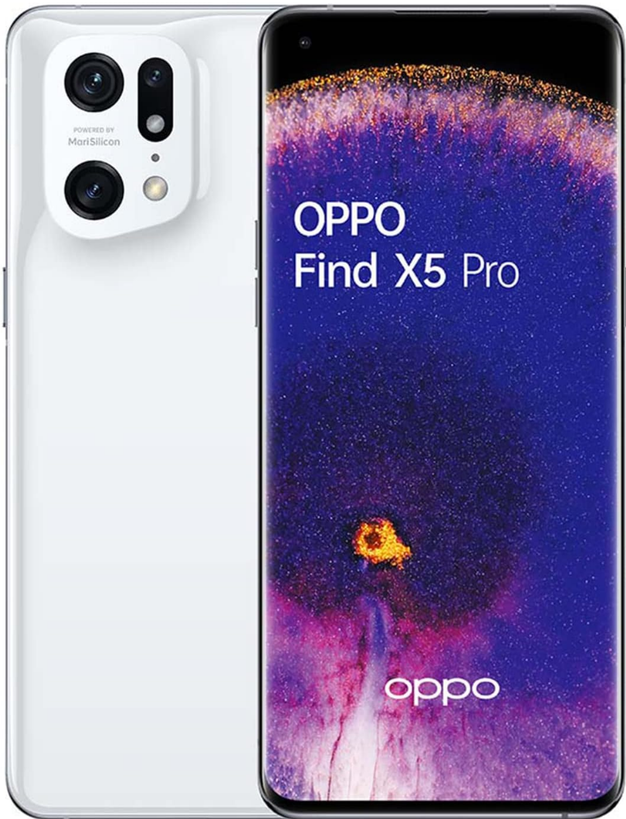
Figure 1: OPPO Find X5 Pro 5G in Ceramic White.

To power on your device, press and hold the power button located on the right side of the phone until the OPPO logo appears. Follow the on-screen prompts to select your language, connect to a Wi-Fi network, and set up your Google account. You will also be guided through setting up the in-display fingerprint sensor for secure and convenient unlocking.