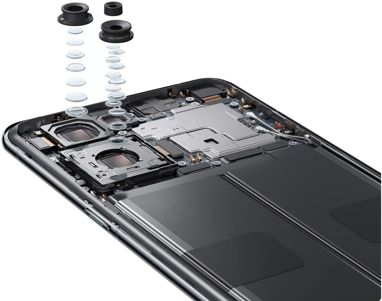
Figure 2: Internal view of the OPPO Find X5 Pro, highlighting key components.

slots. Please note that this device does not support microSD card expansion.