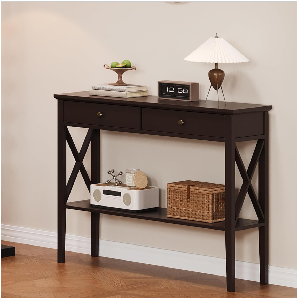
Figure 4.2: The console table adorned with a plant, books, an alarm clock, and a decorative lamp, showcasing its use as a functional and aesthetic piece.