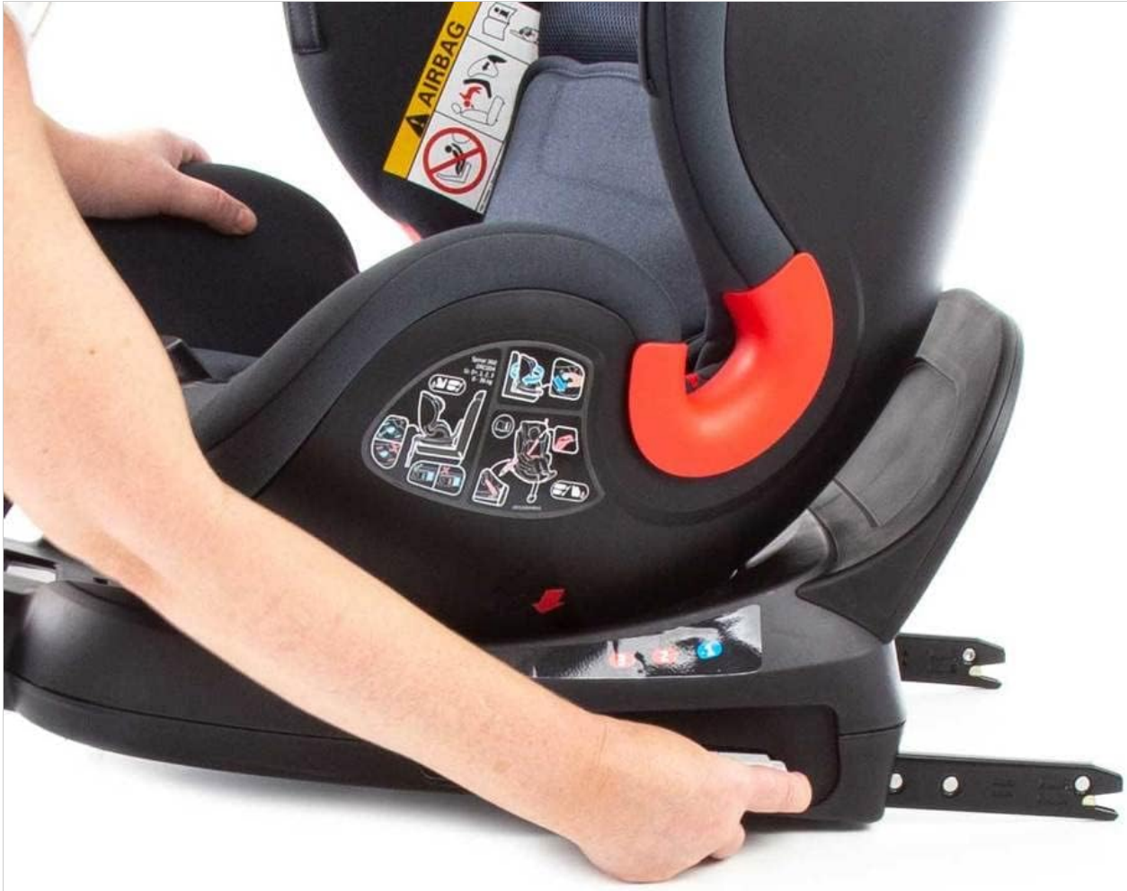
Figure 4.1: Operating the ISOFIX release lever to extend connectors.