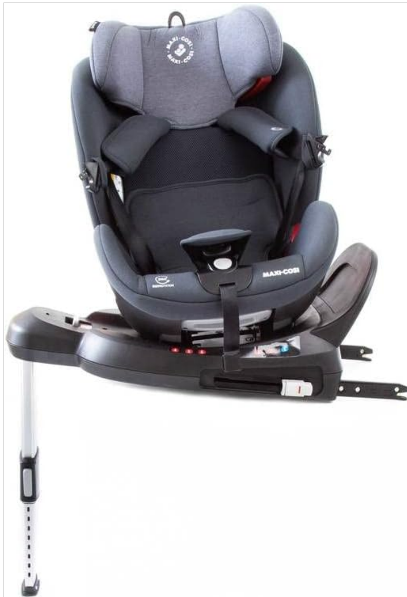
Figure 3.1: Full view of the Maxi-Cosi Spinel 360 car seat with its ISOFIX base and support leg extended.