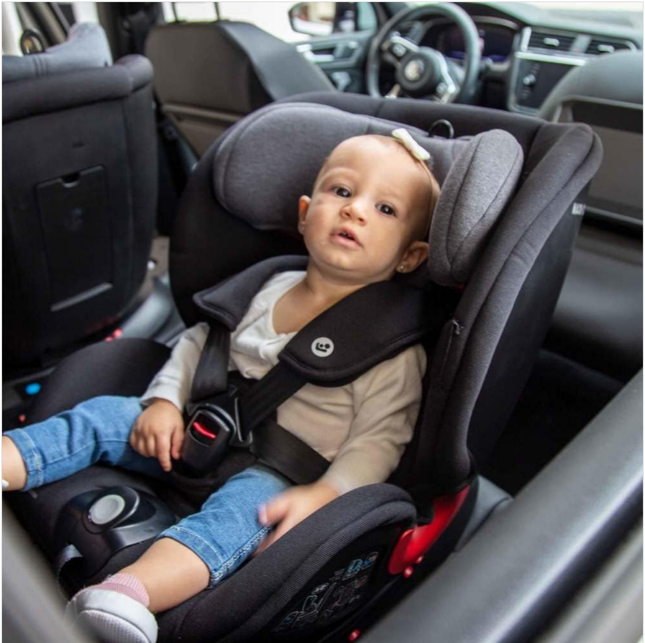
Figure 5.9: Maxi-Cosi Spinel 360 accommodating children from 0-36 kg.