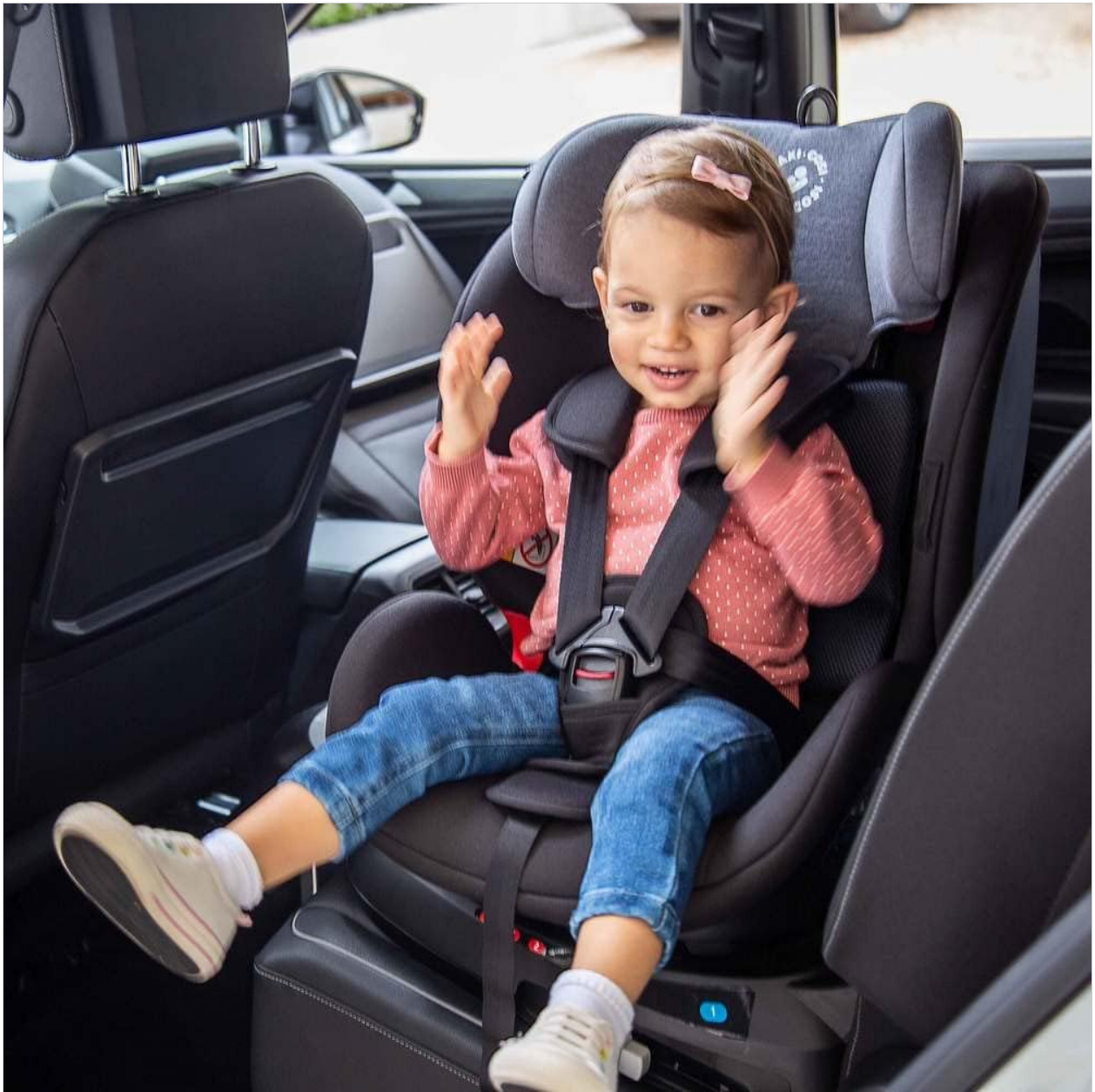
Figure 5.8: Child secured in the car seat.