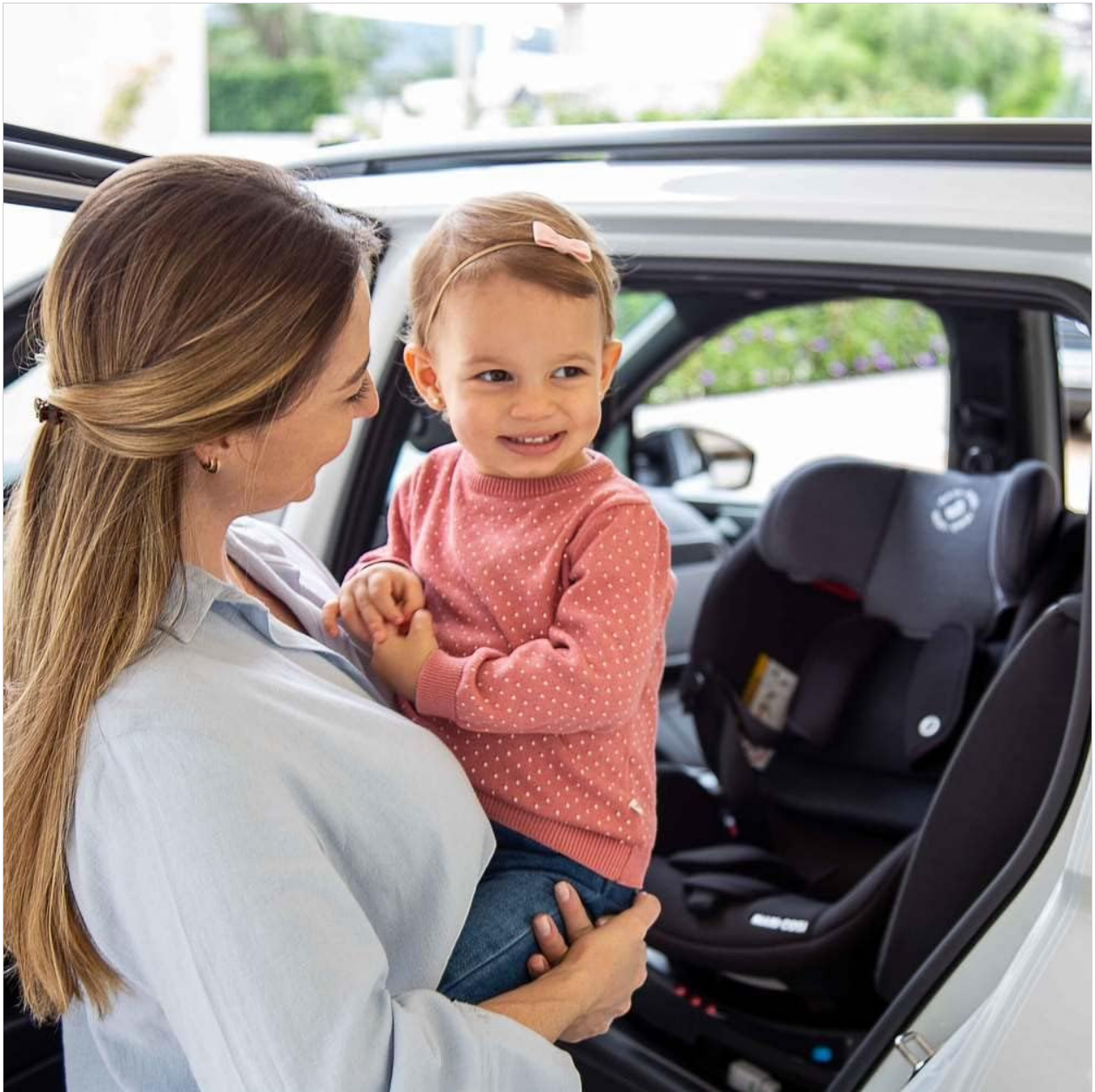
Figure 5.6: Placing a child into the car seat.