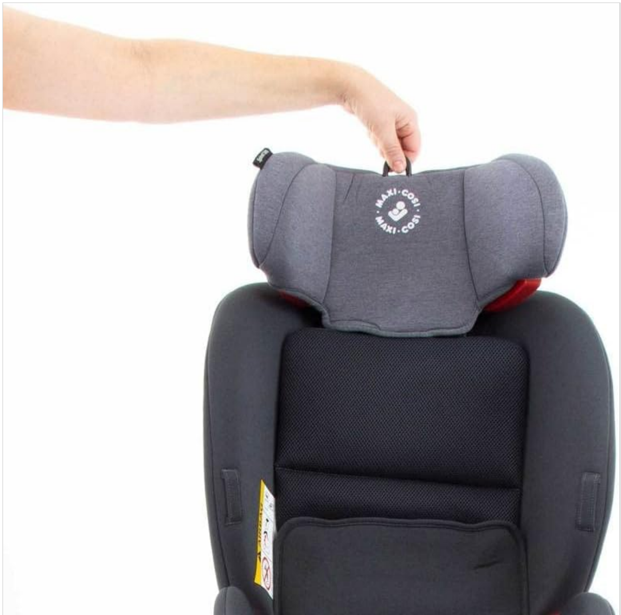
Figure 5.1: Adjusting the headrest height.