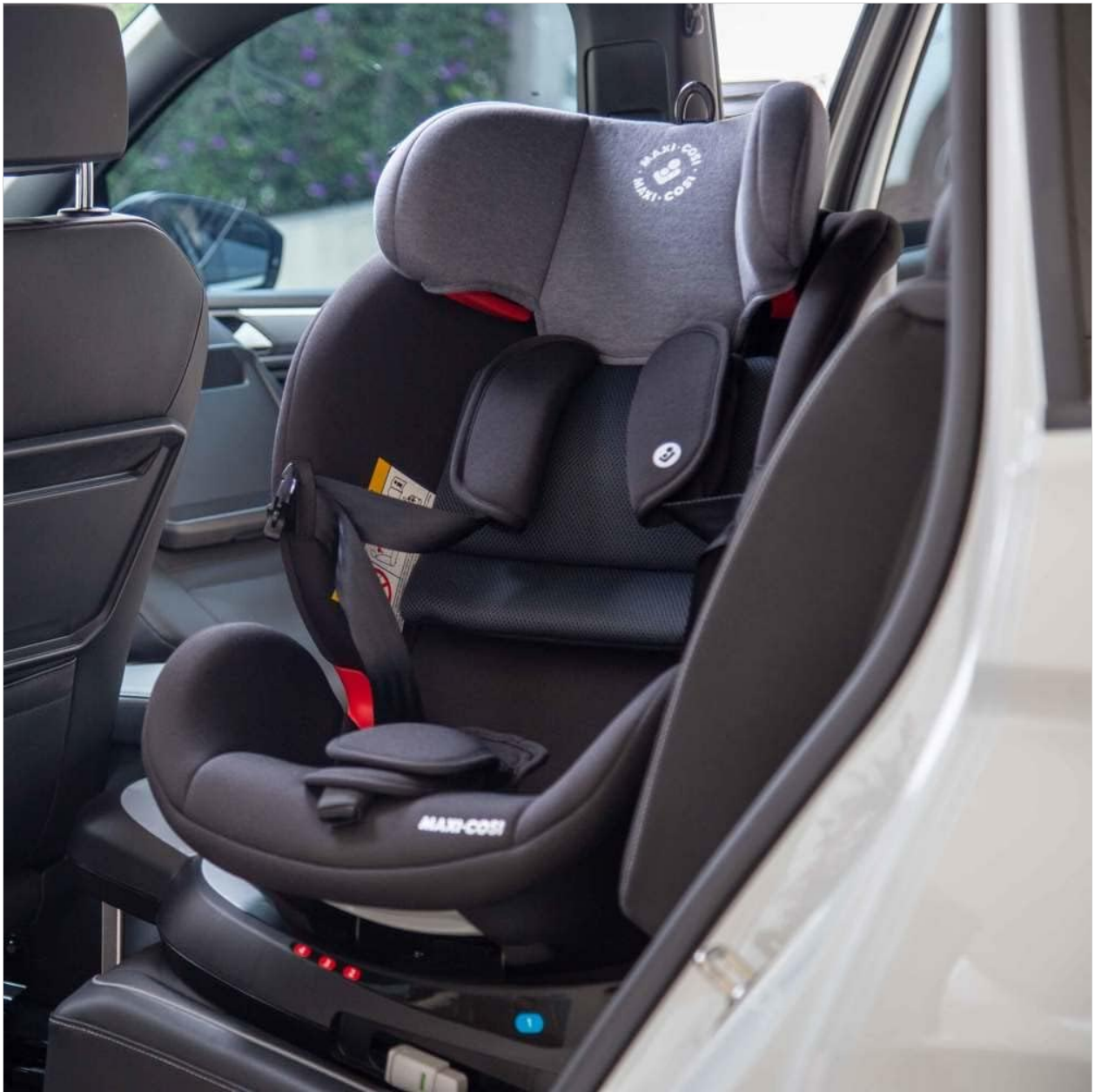
Figure 5.5: Car seat installed in a vehicle.