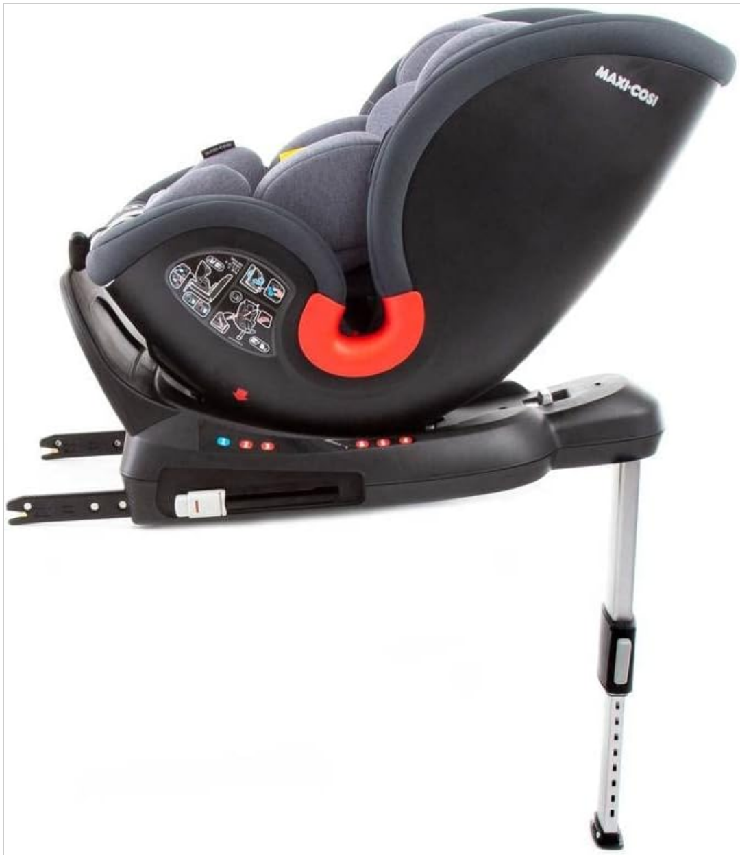
Figure 5.2: Car seat in a reclined position.