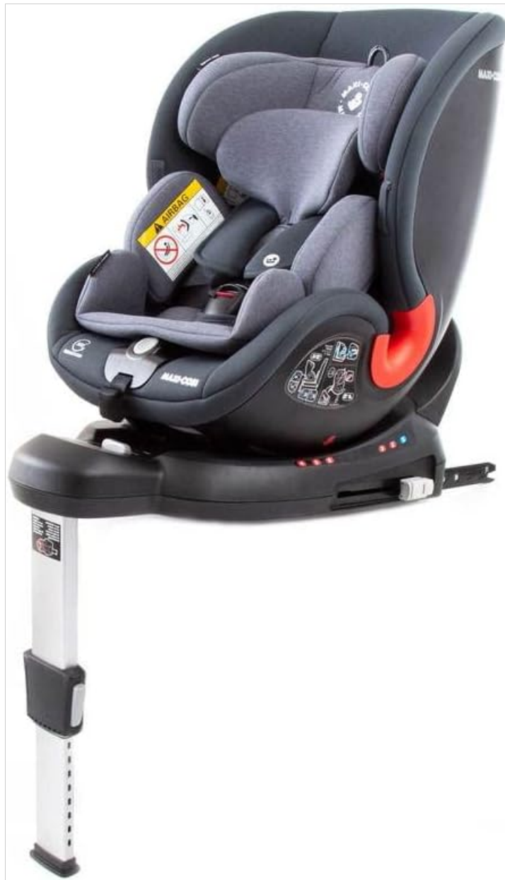
Figure 5.3: Front-side view of the car seat in a reclined position.