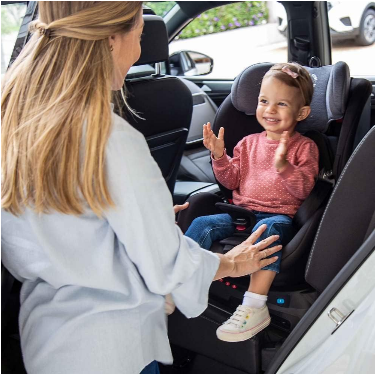
Figure 5.7: Securing the child in the car seat.