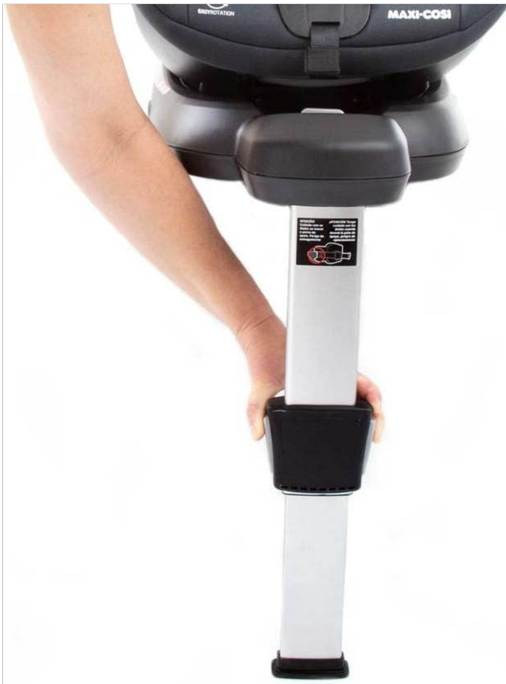
Figure 4.2: Adjusting the support leg for stability.