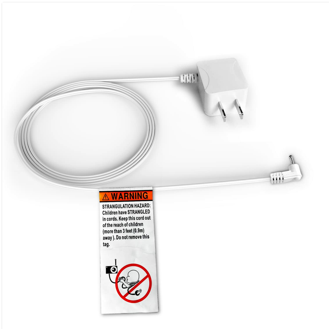
Figure 1: HelloBaby replacement charger with its attached warning tag. Always keep cords out of reach of children.