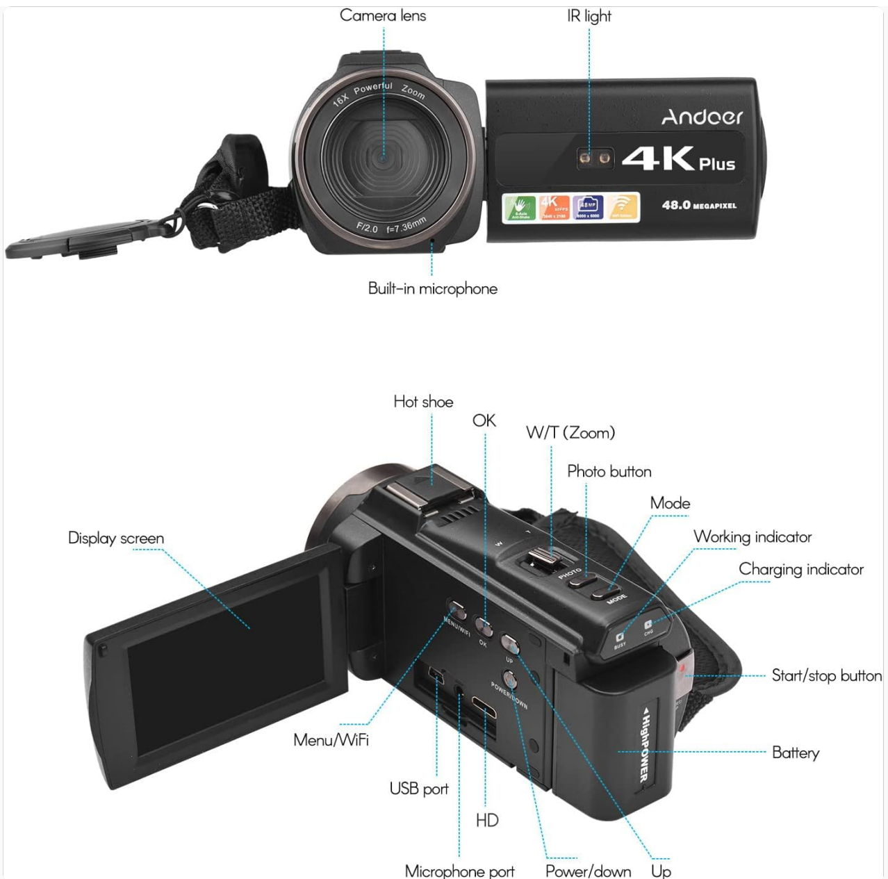
Image 3.1: Front and Rear View of the Camcorder with labeled components.