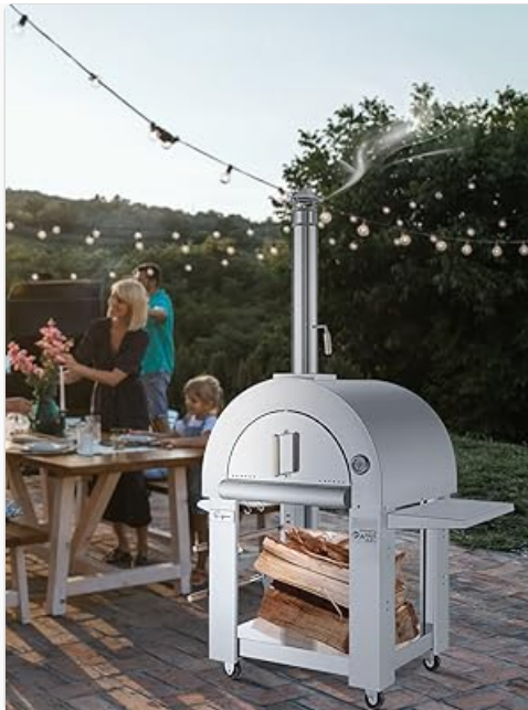
Figure 4.1: Convenient wood storage beneath the oven.