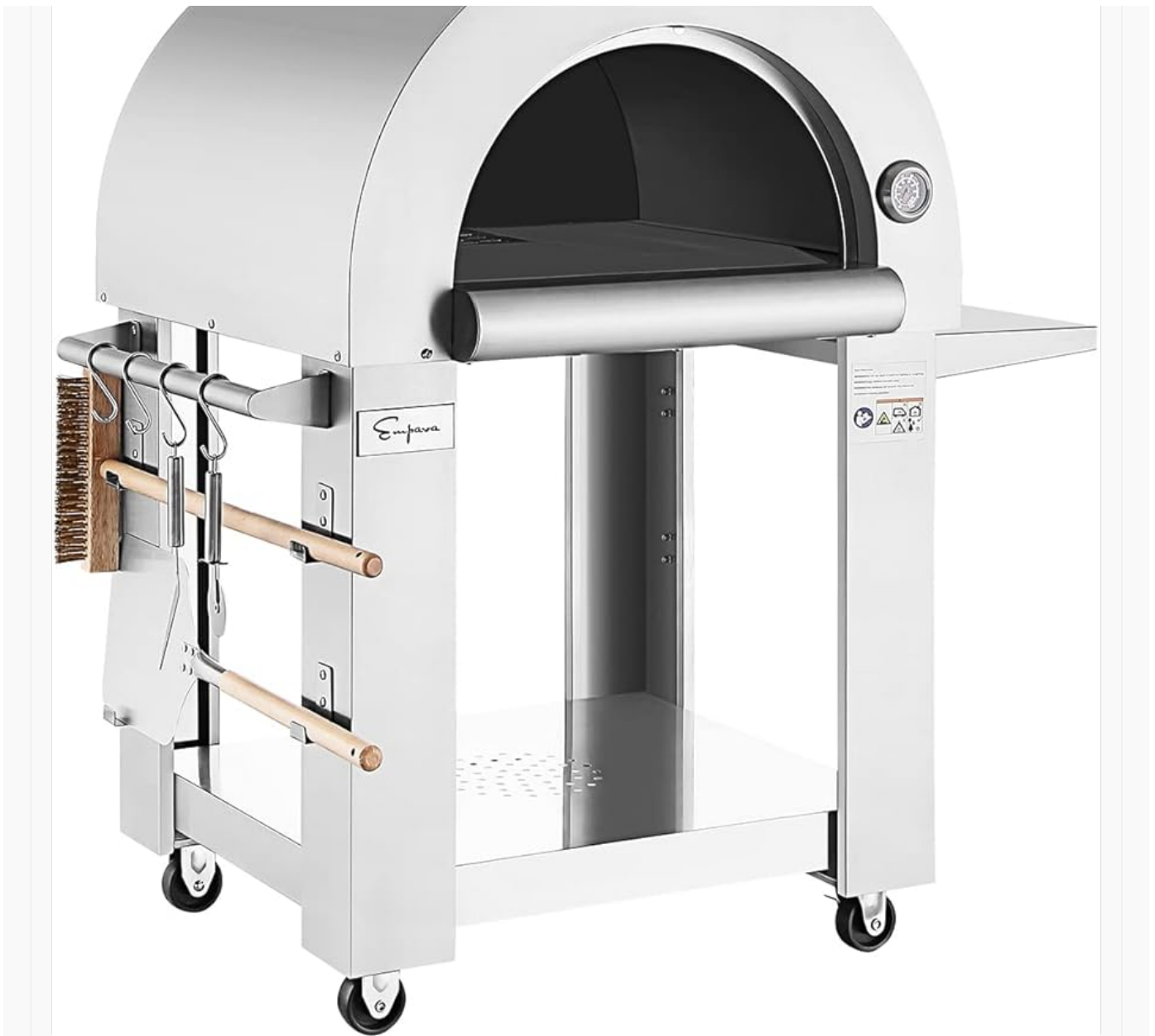
Figure 3.1: Dimensional drawing of the Empava pizza oven.