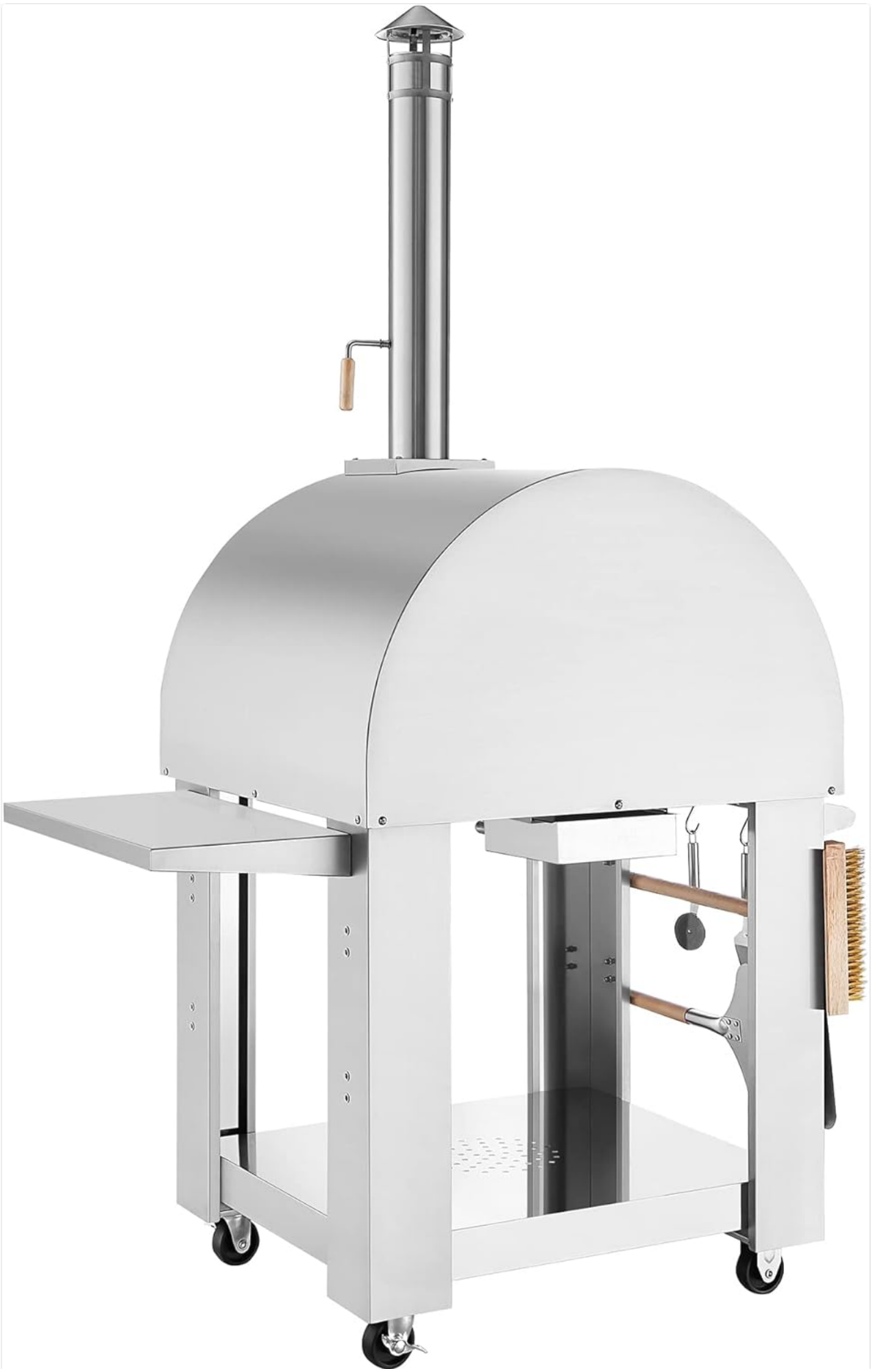
Figure 2.1: Included accessories for the Empava pizza oven.