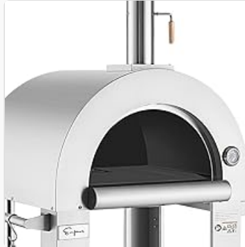
Figure 4.2: Integrated thermometer for monitoring oven temperature.