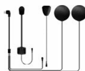
3 Speaker & Hard Tube Microphone & Button Microphone