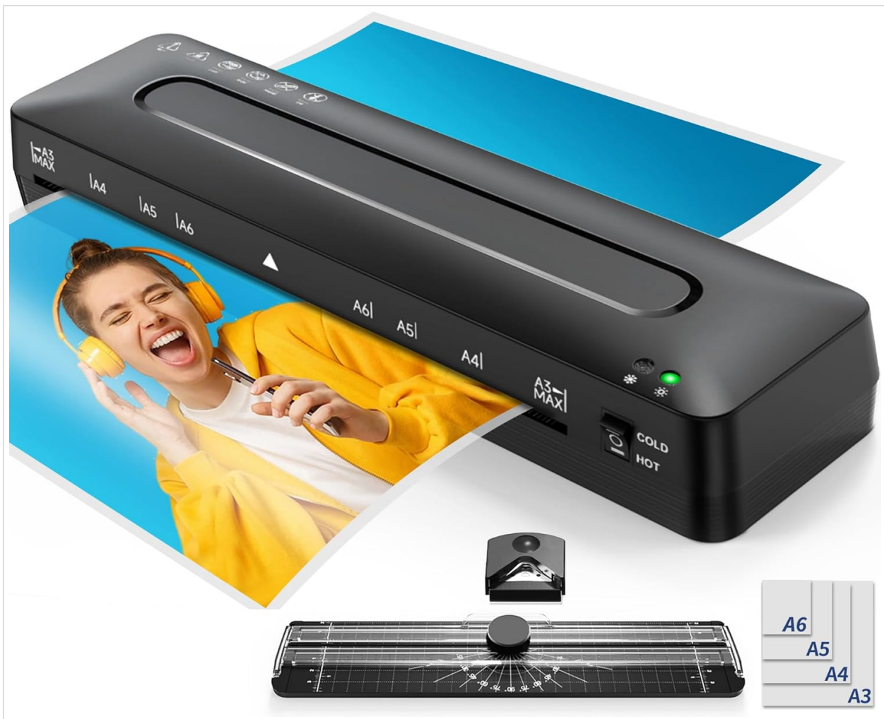
Figure 1: MAXDONE Laminator Machine