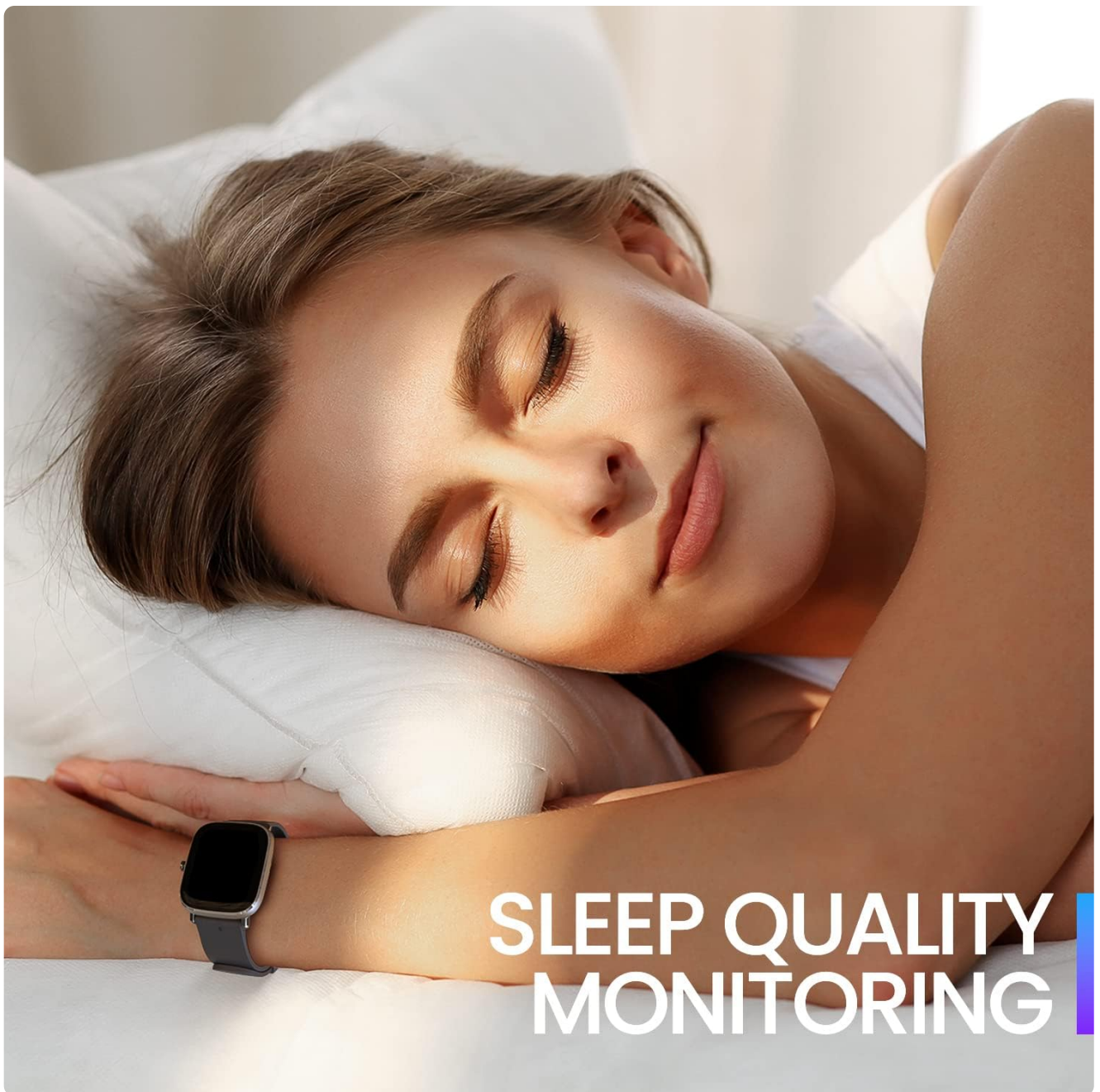
Image: A person sleeping, with the Amazfit GTS 2 Mini on their wrist, highlighting the sleep quality monitoring feature.