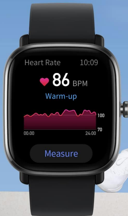
Image: The Amazfit GTS 2 Mini showing 24-hour heart rate tracking, with a graph illustrating heart rate zones.