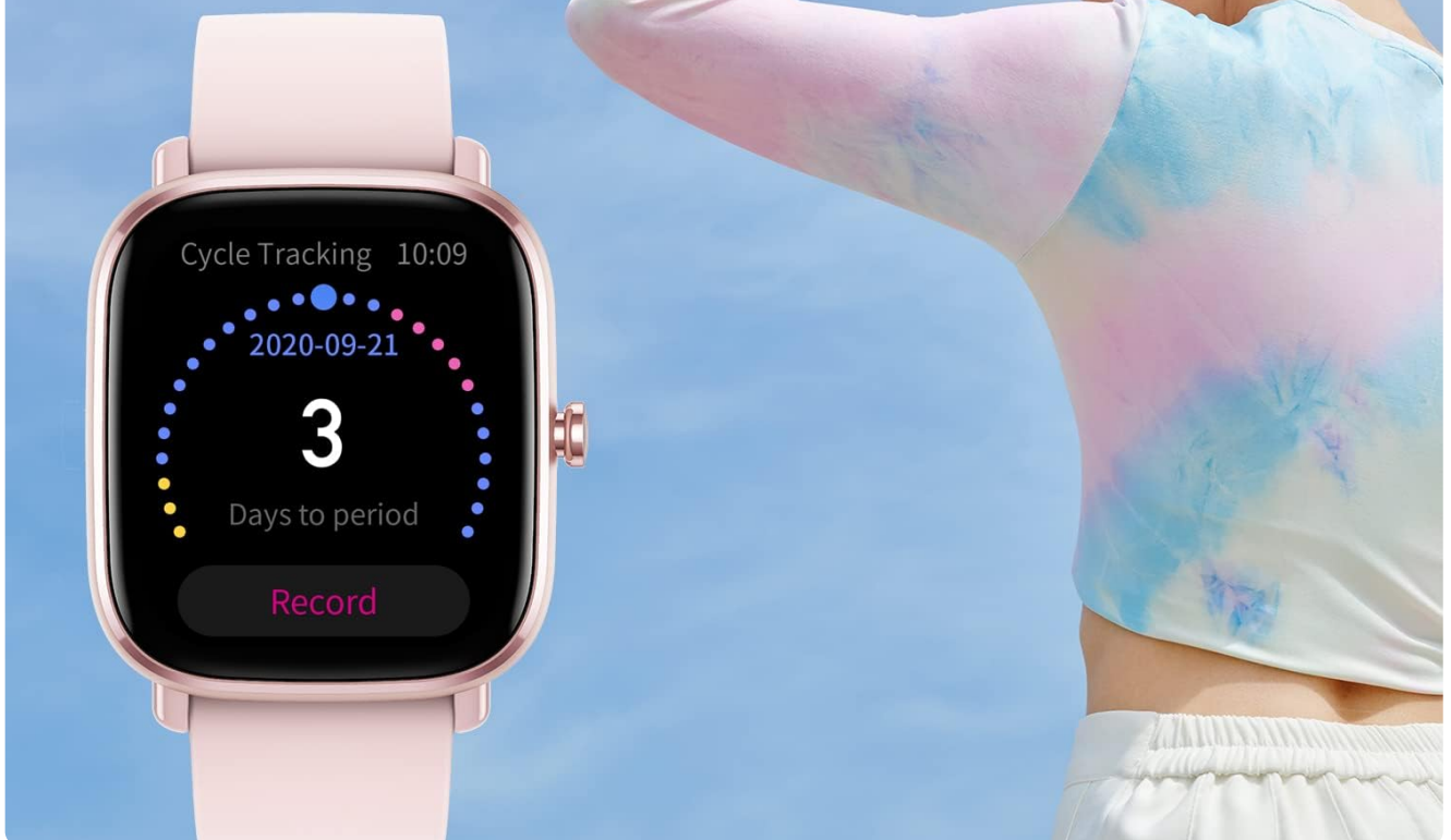
Image: The Amazfit GTS 2 Mini displaying the female cycle tracking feature, showing days to period.