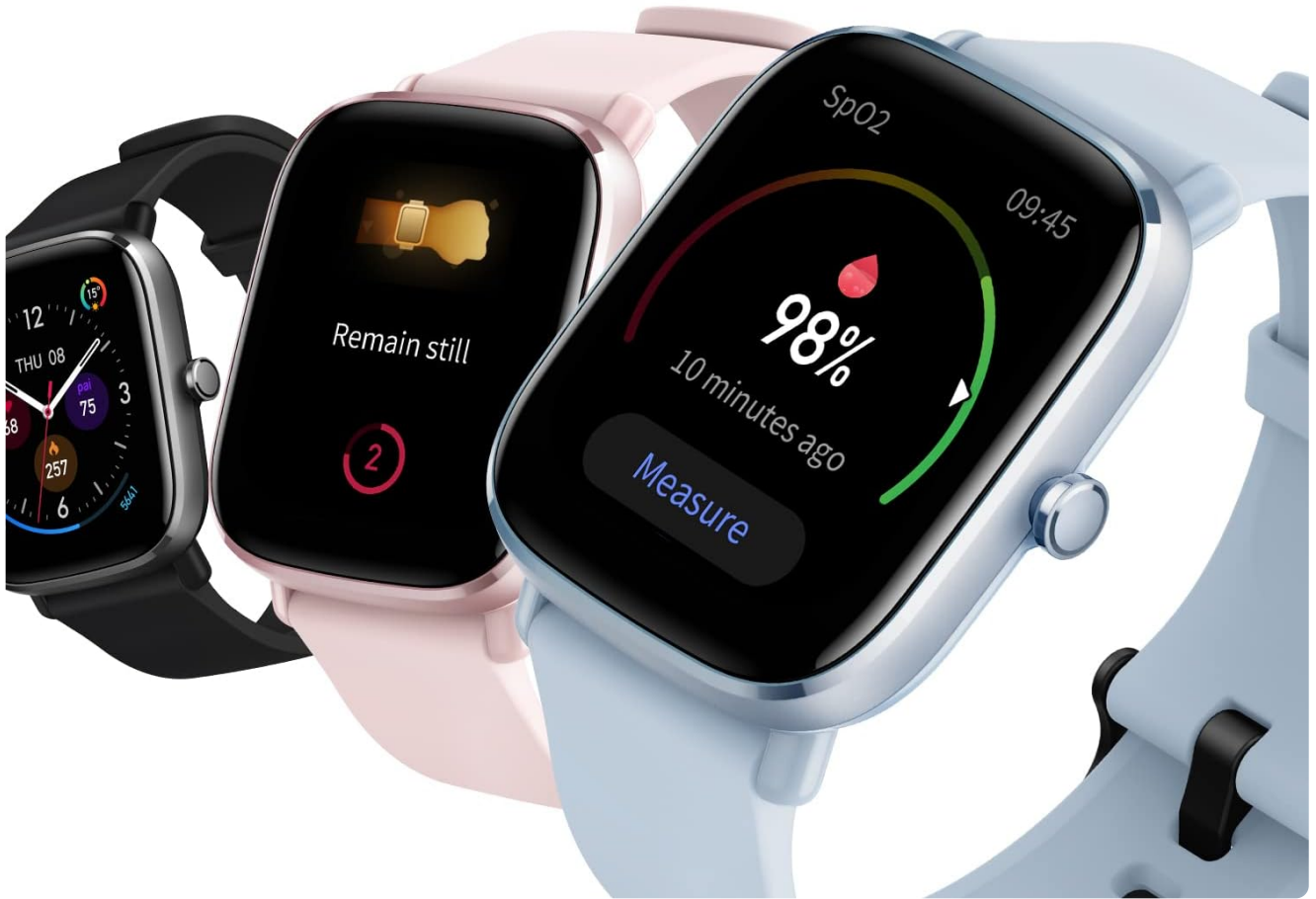
Image: Multiple Amazfit GTS 2 Mini watches demonstrating the blood-oxygen monitoring feature, showing a 98% SpO2 reading.