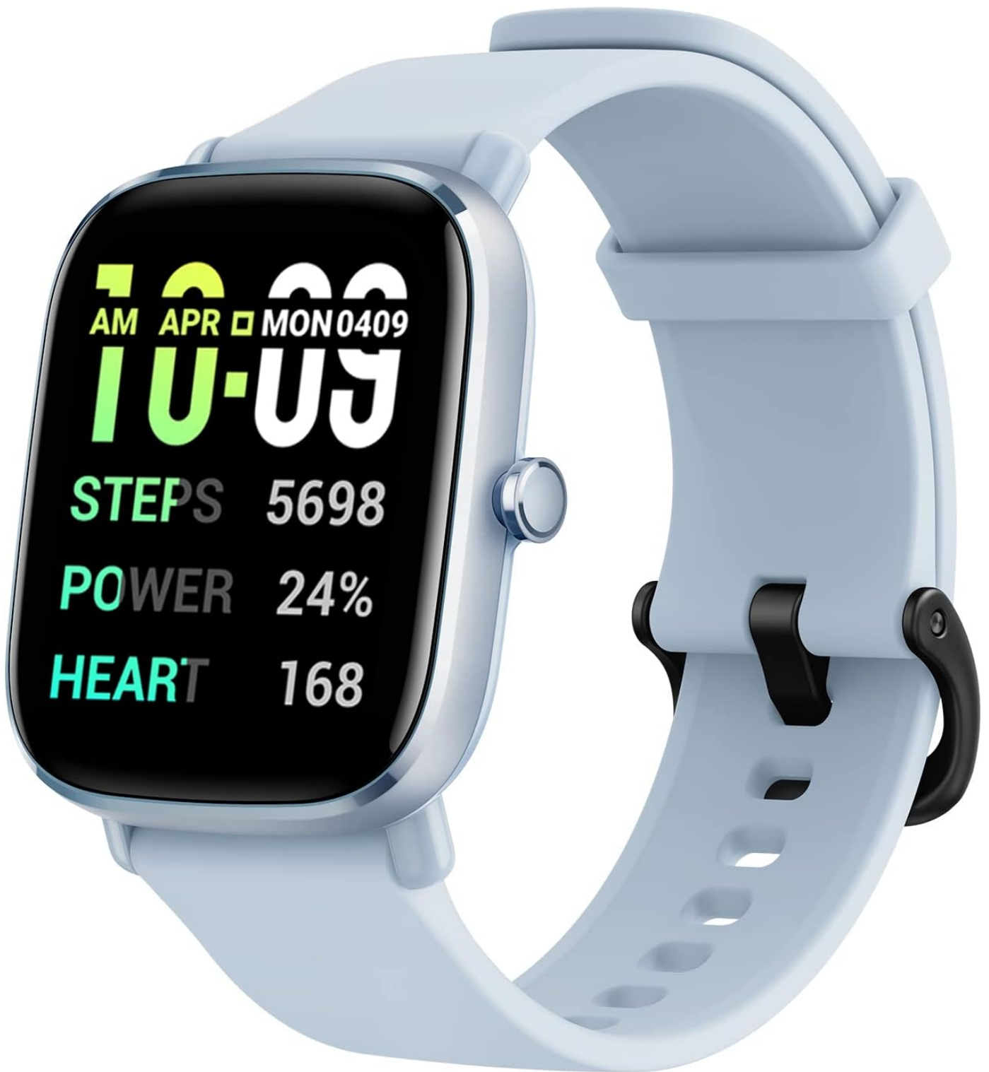
Image: The Amazfit GTS 2 Mini smartwatch, showcasing its vibrant display and sleek design.