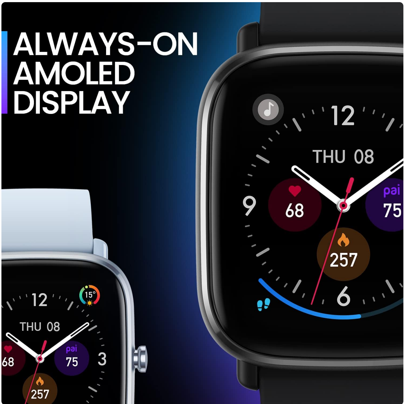
Image: Two Amazfit GTS 2 Mini watches, illustrating the Always-On AMOLED Display feature.