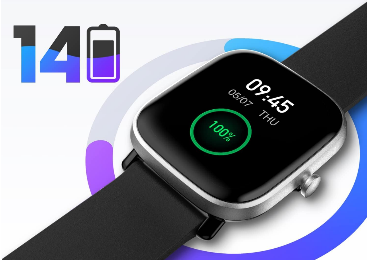
Image: The Amazfit GTS 2 Mini being charged on its magnetic charging base, illustrating the battery life feature.