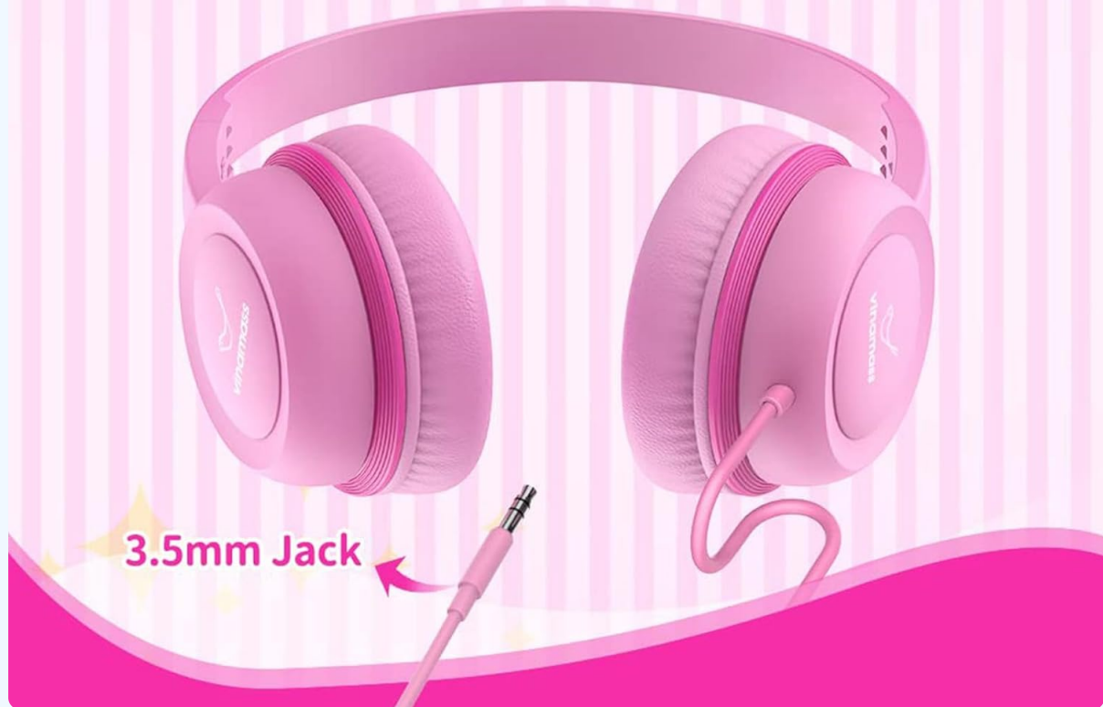
Image 3.4: Illustrates the universal compatibility of the 3.5mm jack with various devices such as laptops, tablets, iPads, phones, Macs, and iPods.