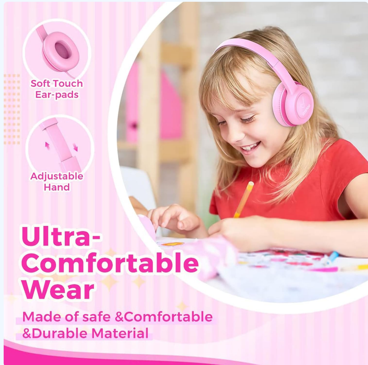
Image 3.2: Demonstrates the ultra-comfortable wear provided by the soft touch ear-pads and adjustable headband.

Crafted with a unique soft silicone and donut macaron design, these headphones offer a stylish and comfortable wearing experience. The flexible PP outer-layer, combined with light and cozy foam sponge ear cushions covered in premium PU leather, ensures maximum comfort for extended listening sessions. The lightweight and ergonomic design minimizes burden on a child's neck, making them suitable for daily use.