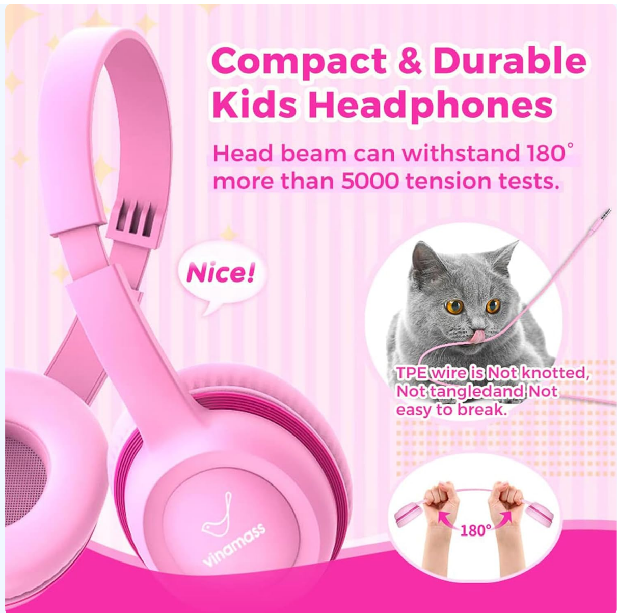
Image 3.3: Highlights the compact and durable construction, including the TPE wire designed to prevent tangling and breaking.