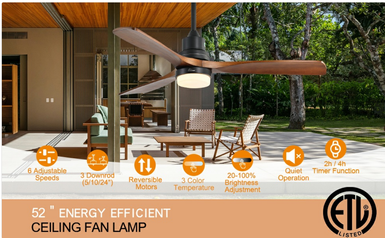
Image: The ceiling fan illustrating the 5, 10, and 24 inch downrod options and its compatibility with flat or sloped ceilings, supporting an inclination angle of up to 30 degrees.