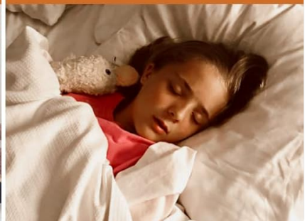
Image: The ceiling fan's LED light demonstrating adjustable brightness levels, from high brightness suitable for working, to medium brightness for reading, and low brightness for sleeping.