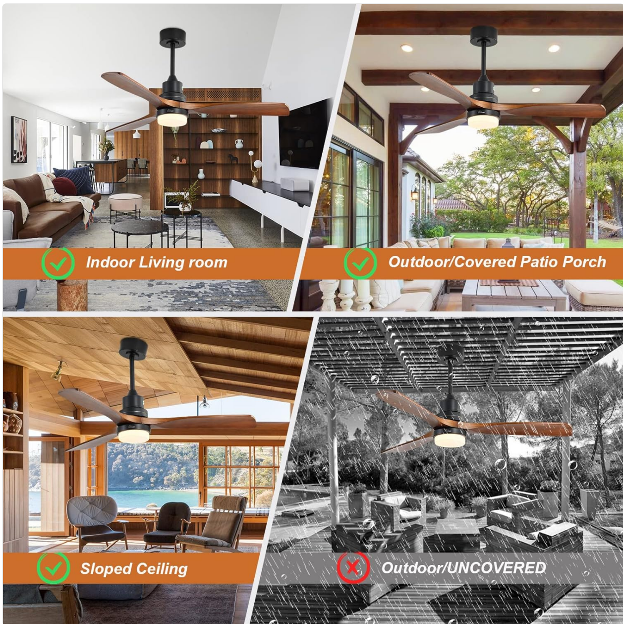
Image: The Sofucor 52 Inch Ceiling Fan installed in an indoor living room, a covered outdoor patio, and a room with a sloped ceiling. It is not suitable for uncovered outdoor areas exposed to direct rain.