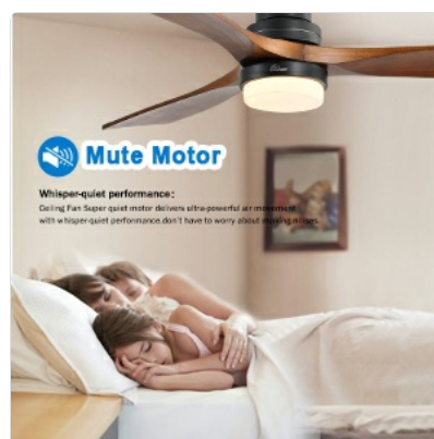
Image: A graphic highlighting the fan's mute motor, emphasizing its whisper-quiet performance for a peaceful environment.

Image: The ceiling fan illustrating its reversible function, with blue arrows indicating downward airflow for summer cooling and orange arrows indicating upward airflow for winter heat circulation.