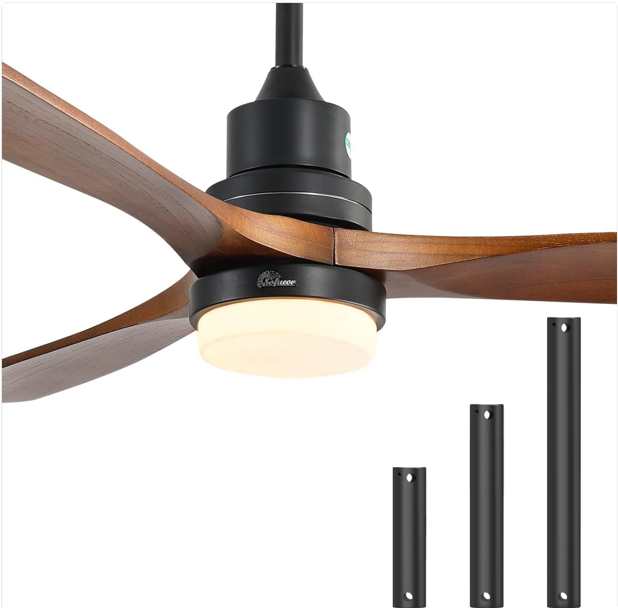
Image: Main components of the Sofucor 52 Inch Ceiling Fan, including the fan body with integrated light, three wooden blades, and three black downrods (5, 10, and 24 inches).