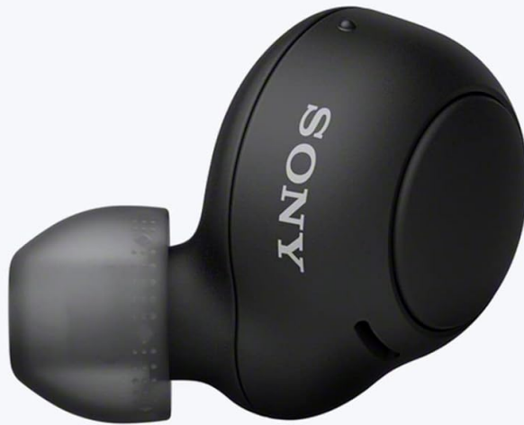
Image: Single Sony WF-C500 Earbud