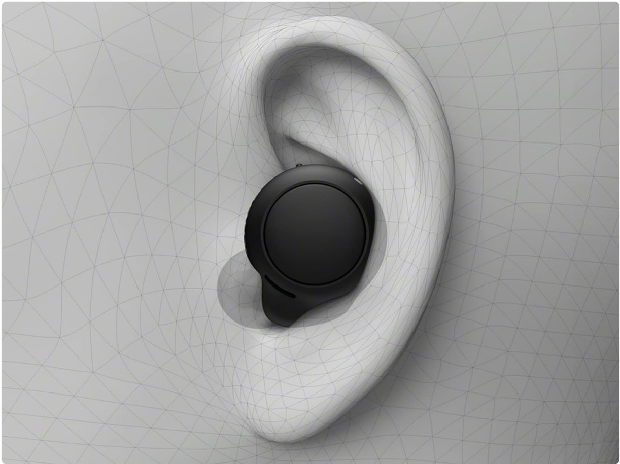
Image: Proper Earbud Placement