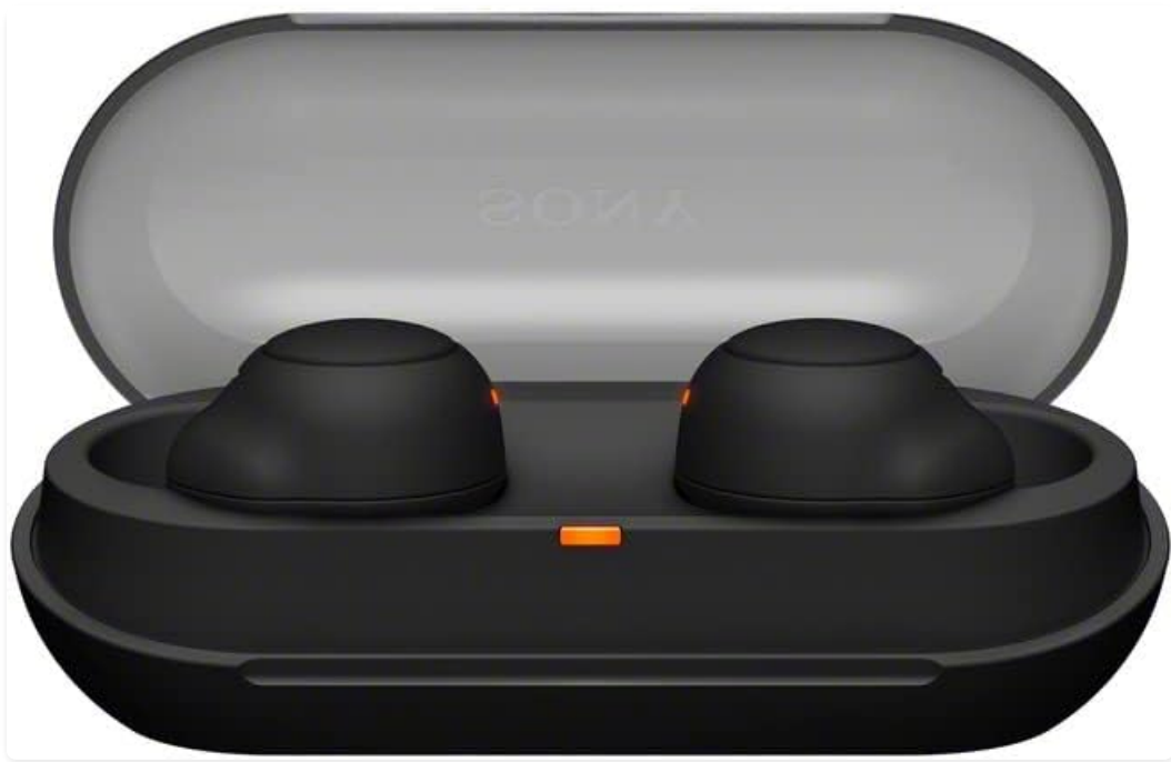
Image: Sony WF-C500 Earbuds in Charging Case