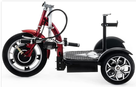
Detail of the front wheel and brake system.