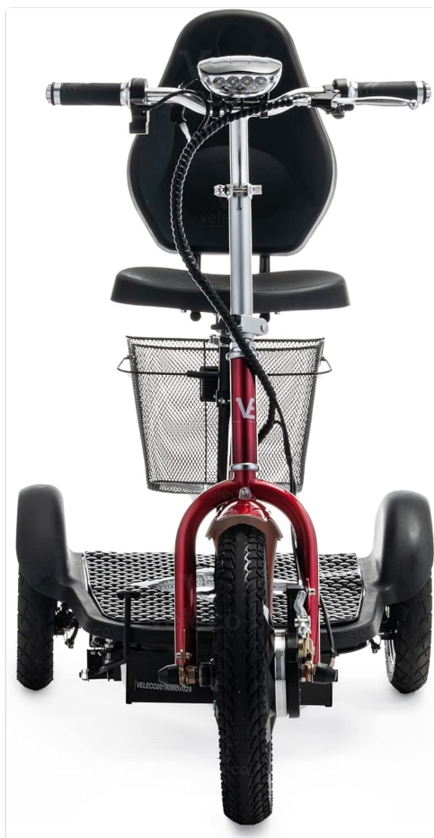
Front view of the scooter, highlighting the headlight and front wheel.