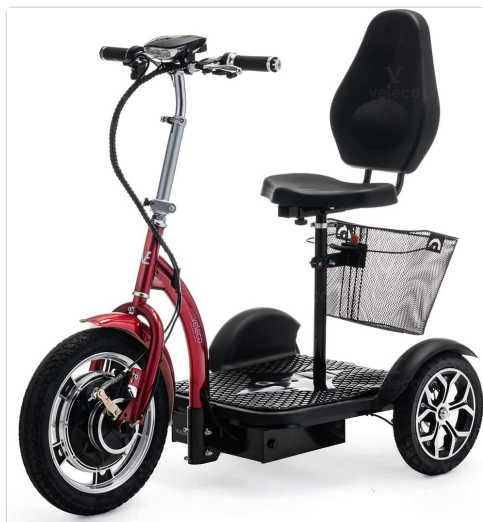
Overall view of the VELECO ZT16 mobility scooter.

Familiarize yourself with the different parts of your VELECO ZT16 mobility scooter.