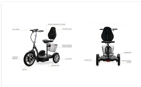
Labeled diagram of scooter components.