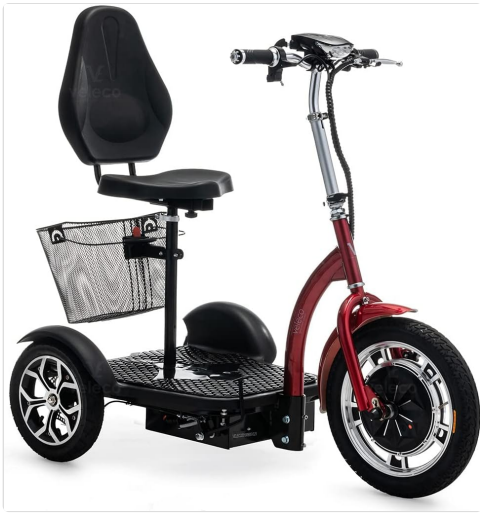
Side profile of the scooter, showing the seat and overall structure.