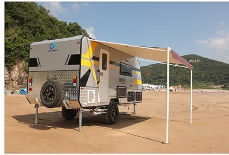
The awning arm is fixed on the grass or beach, which can increase the height of the awning, making it more convenient for you to use with other accessories.

Image: The Awnlux RV awning fully installed and extended, showcasing its appearance on the travel trailer.