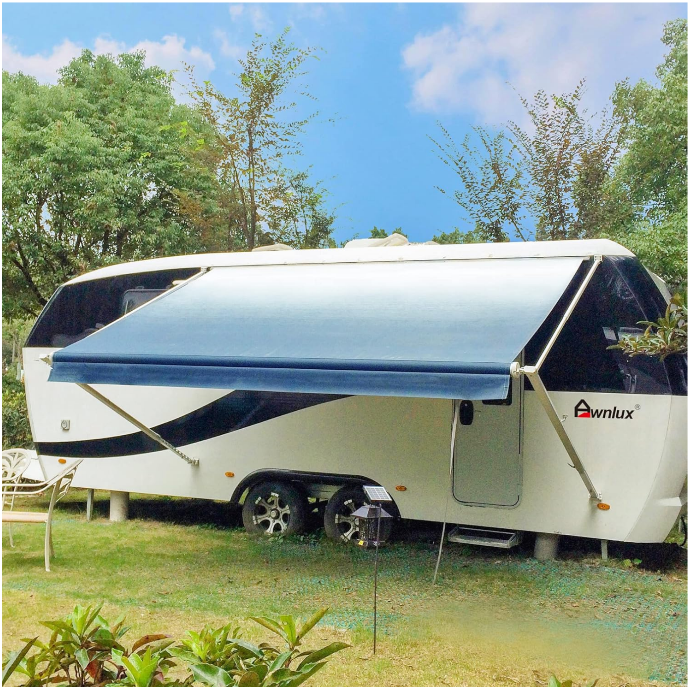
Image: Awnlux RV Awning extended, providing shade for an RV parked in a natural setting.