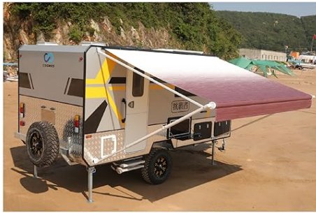
The awning arm is fixed on the RV, and the triangle formed makes the awning particularly stable.